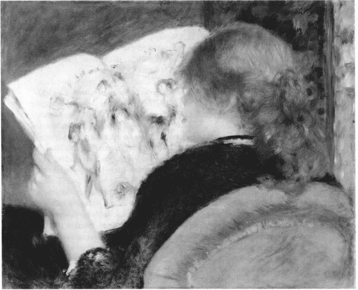
1. Auguste Renoir, Young Woman Reading an Illustrated Journal, c. 1880. 46.35 × 55.88, Museum of Art, Rhode Island School of Design, Museum Appropriation

Chapter 3 reinterprets Degas's relatively little-studied works on the theme of millinery, proposing that they portray the Parisian culture of consumption, highlighting commodity display and women consumers and workers. Situating Degas's representations of millinery boutiques and ateliers within a visual culture, including photographs, illustrations and advertising posters, the chapter presents close readings of Degas's works spanning some three decades. Distinctions are made here between images that focus on the display of decorated hats, those that focus on women consumers attended by saleswomen and those that focus primarily on the modistes at work. Different sites of consumption, from boutiques to an elite designer salon and an alcove in a department store, are distinguished. The chapter investigates the different gazes of modern women at sites of consumption as artisans and consumers and contextualizes these within