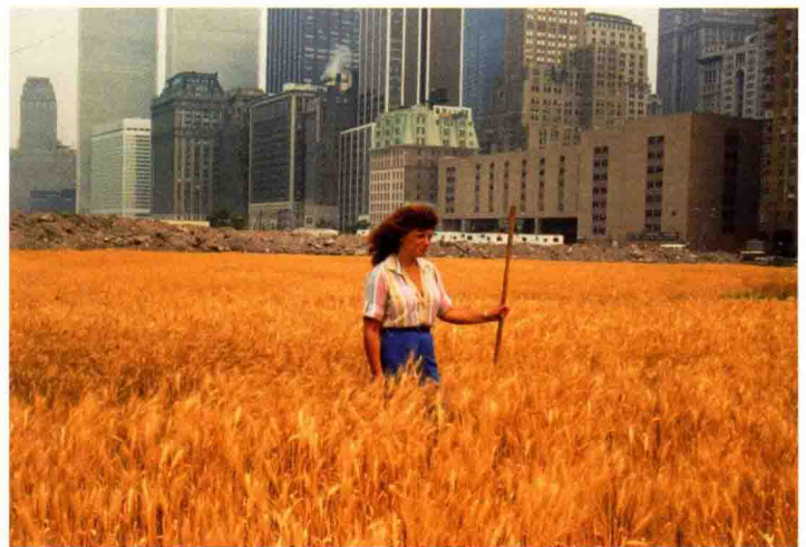
Agnes Denes, Wheatfield, A Confrontation: Battery Park Landfill, Downtown Manhattan (1982)

Public art can be understood as a variety of forms and approaches that engage with the sites and situations of the public realm. But this publication is not engaged in the task of definition. As Nato Thompson, chief curator of the New York-based commissioning organization Creative Time, states: 'Many artists aren't specifically invested in describing their work as art so much as they utilize the tools of artistic production to produce interesting moments and provocations. This isn't a strategy unique