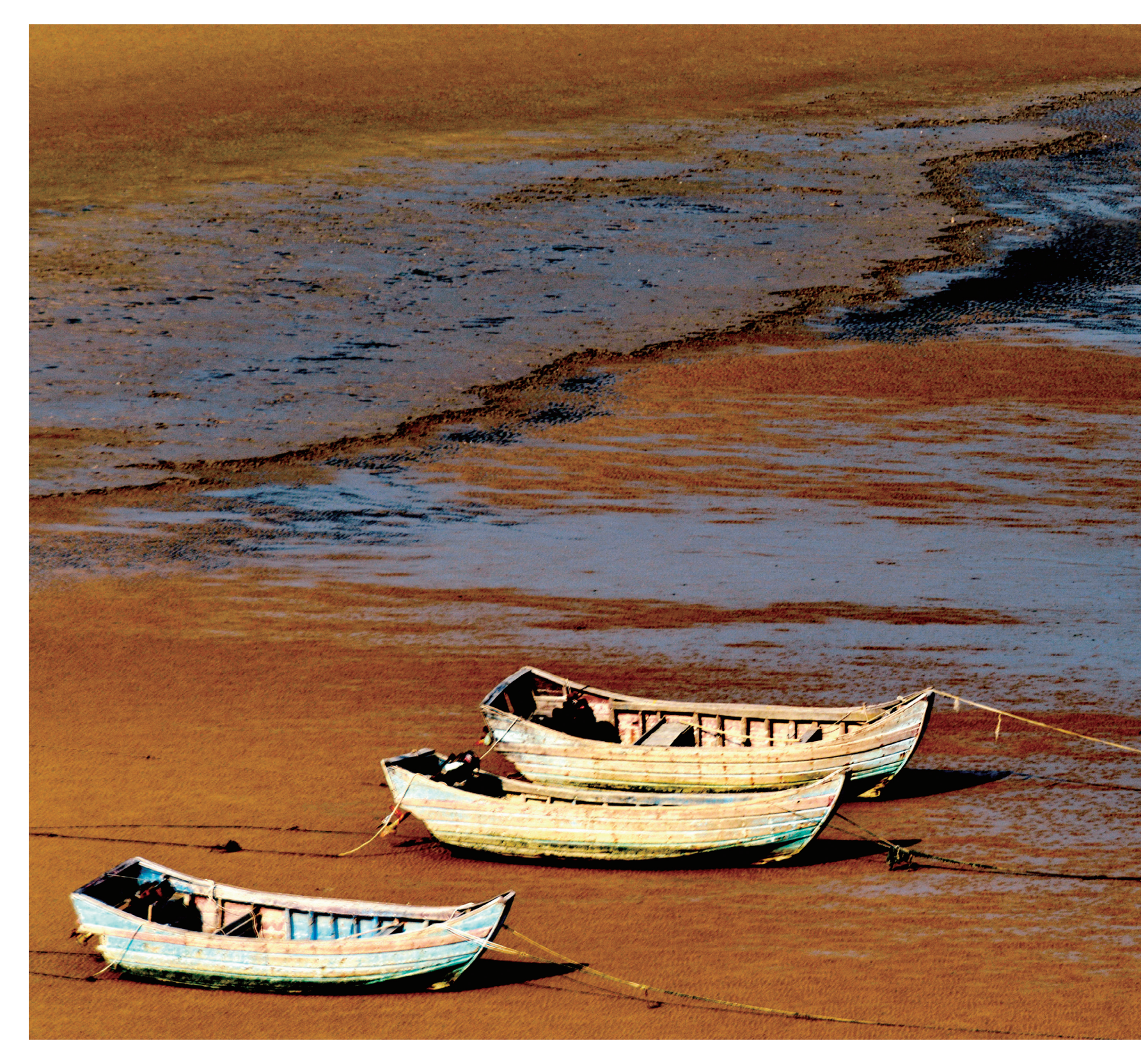
16 / 光影述说 LIGHTING RECOUNT