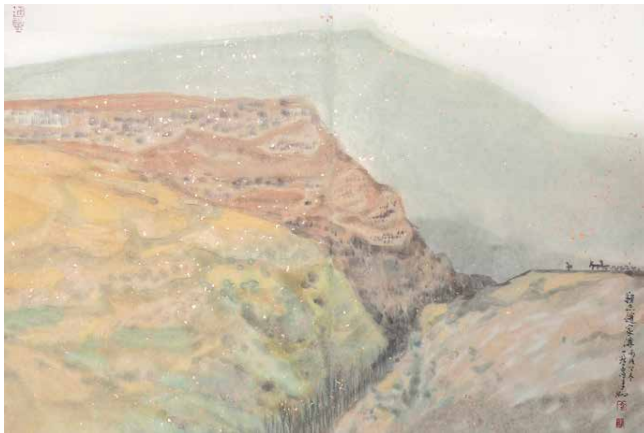
难忘赵家沟 2006年·山西 赵家沟 26cm × 34cm