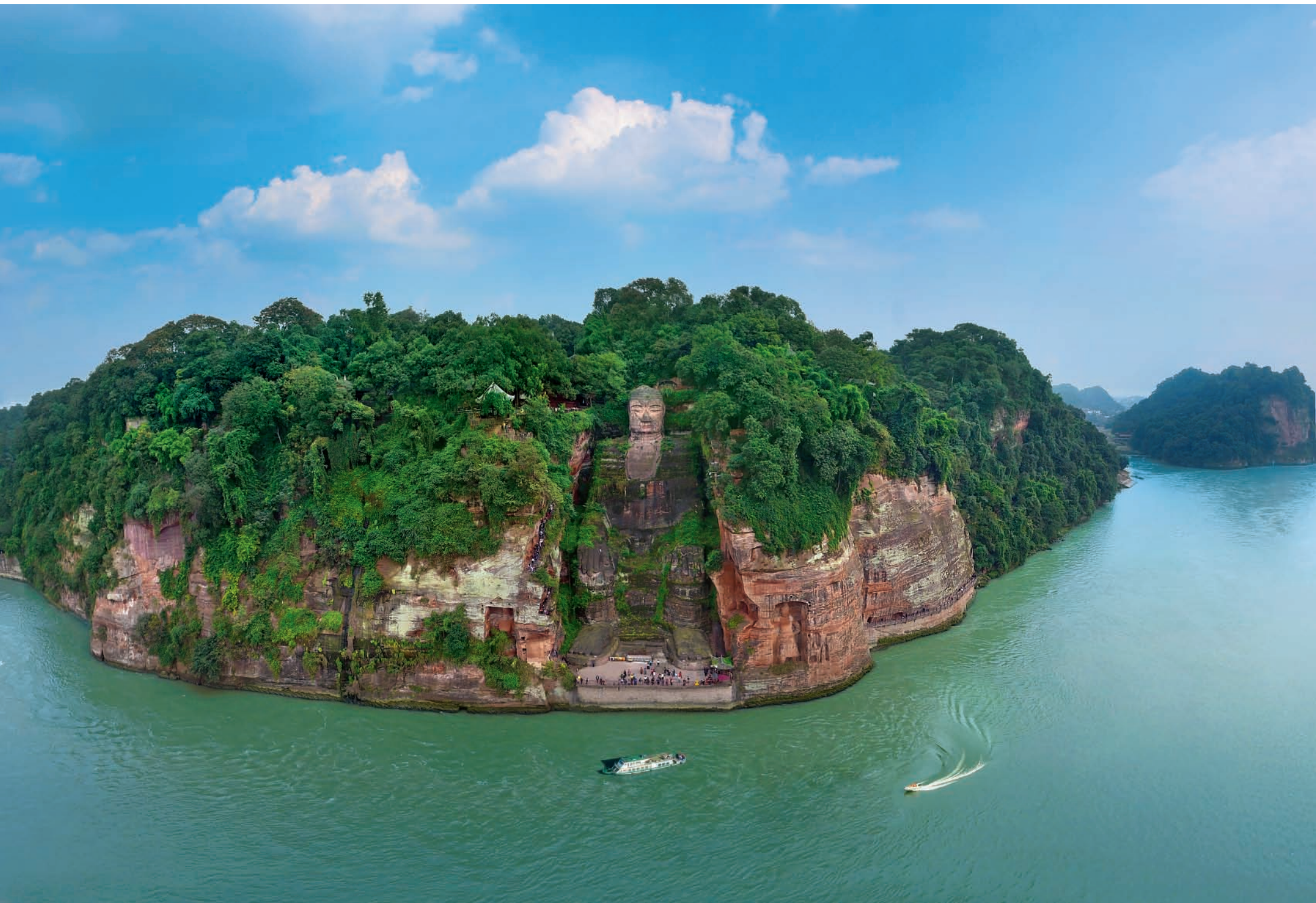
山是一尊佛 佛是一座山 Buddha is a mountain and the mountain is a Buddha