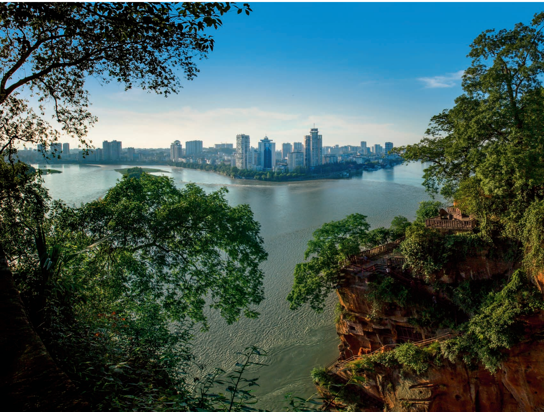
千年乐山大佛，坐拥三江，守望乐山。 Leshan Giant Buddha sits among three rivers and guards the land of Leshan for more than one thousand years.

Top Choice of Travel to Sichuan / Green-oriented Transformation Demonstration City / Livable Garden City / Headquarter Economy Cluster Area