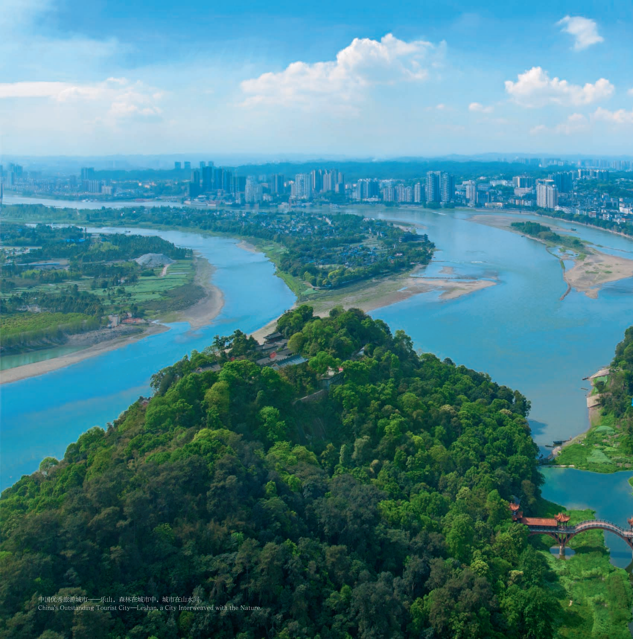
中国优秀旅游城市——乐山，森林在城市中，城市在山水间。 China's Outstanding Tourist City—Leshan, a City Interweaved with the Nature.