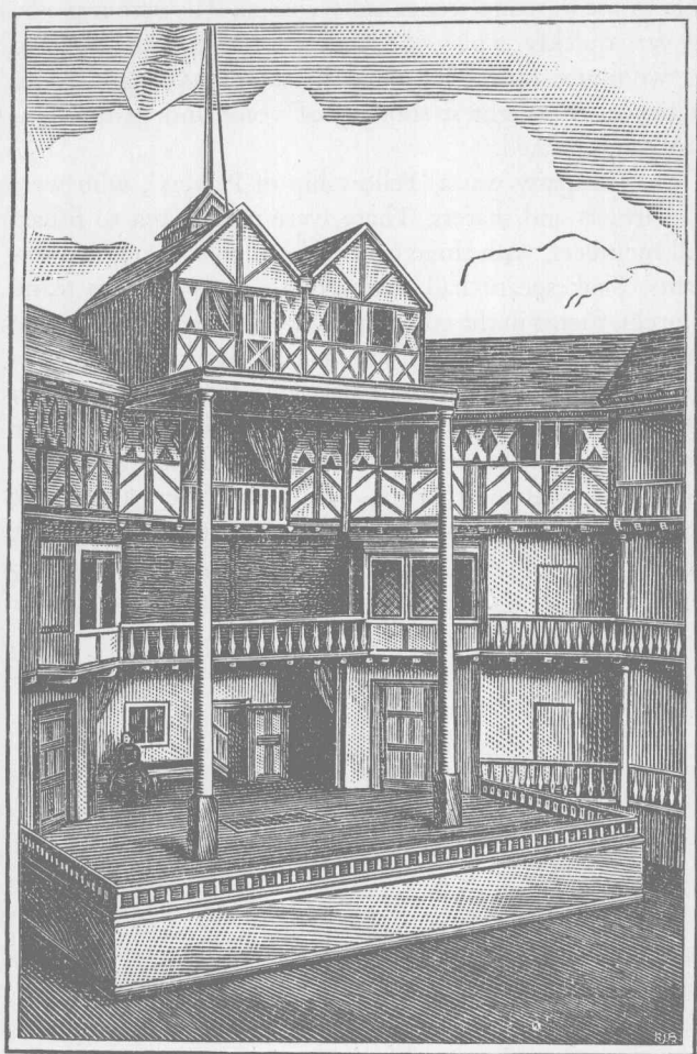
THE GLOBE THEATRE