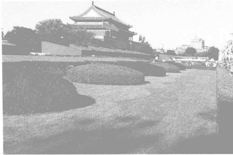
FIGURE 1.2 A concentric circle pattern around these shrubs is achieved in the turf by using turfgrass cultivars with different genetic color near Tiananmen Square in Beijing, China.

landscapes, turf provides green color for a large portion of the year. Some turfgrasses still have ornamental value when dormant, such as the straw gold color of dormant zoysiagrass ( Zoysia spp.). Turfgrasses with different shades of green can even be used to create a pattern in a turf sward (Figure 1.2). Though athletic fields are primarily maintained for recreation, they are often mown into intricate patterns that provide a very attractive appearance for major events (Figure 1.3). The low height of turf gives a feeling of openness that cannot be achieved with trees or shrubs, and it can act as a foreground and/or background for the focal points in a landscape.