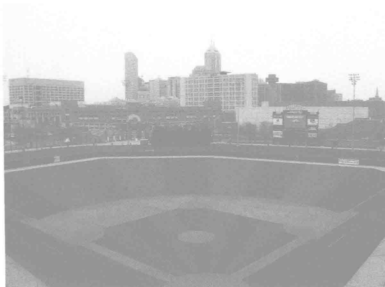
FIGURE 1.3 An intricate mowing pattern on a baseball field that provides aesthetic appeal without influencing the playability.

and allergy-related pollens (Beard and Green, 1994), and it offers a less favorable habitat for unwanted nuisance insects and disease vectors (Clopton and Gold, 1993).