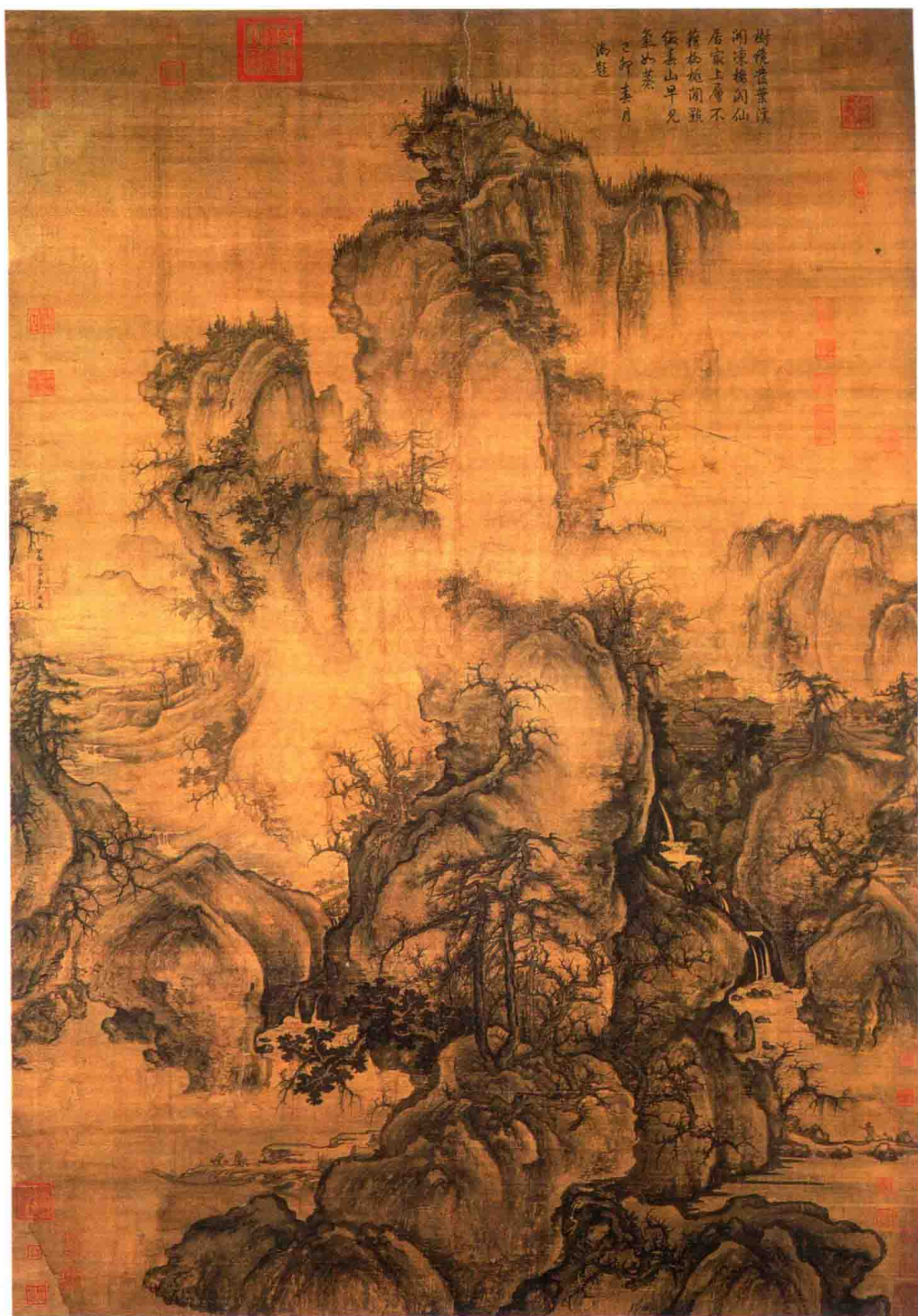
Fig. 1. Guo Xi, Early Spring , signed and dated 1072. Hanging scroll, ink and light color on silk, 158.3 × 108.1 cm.