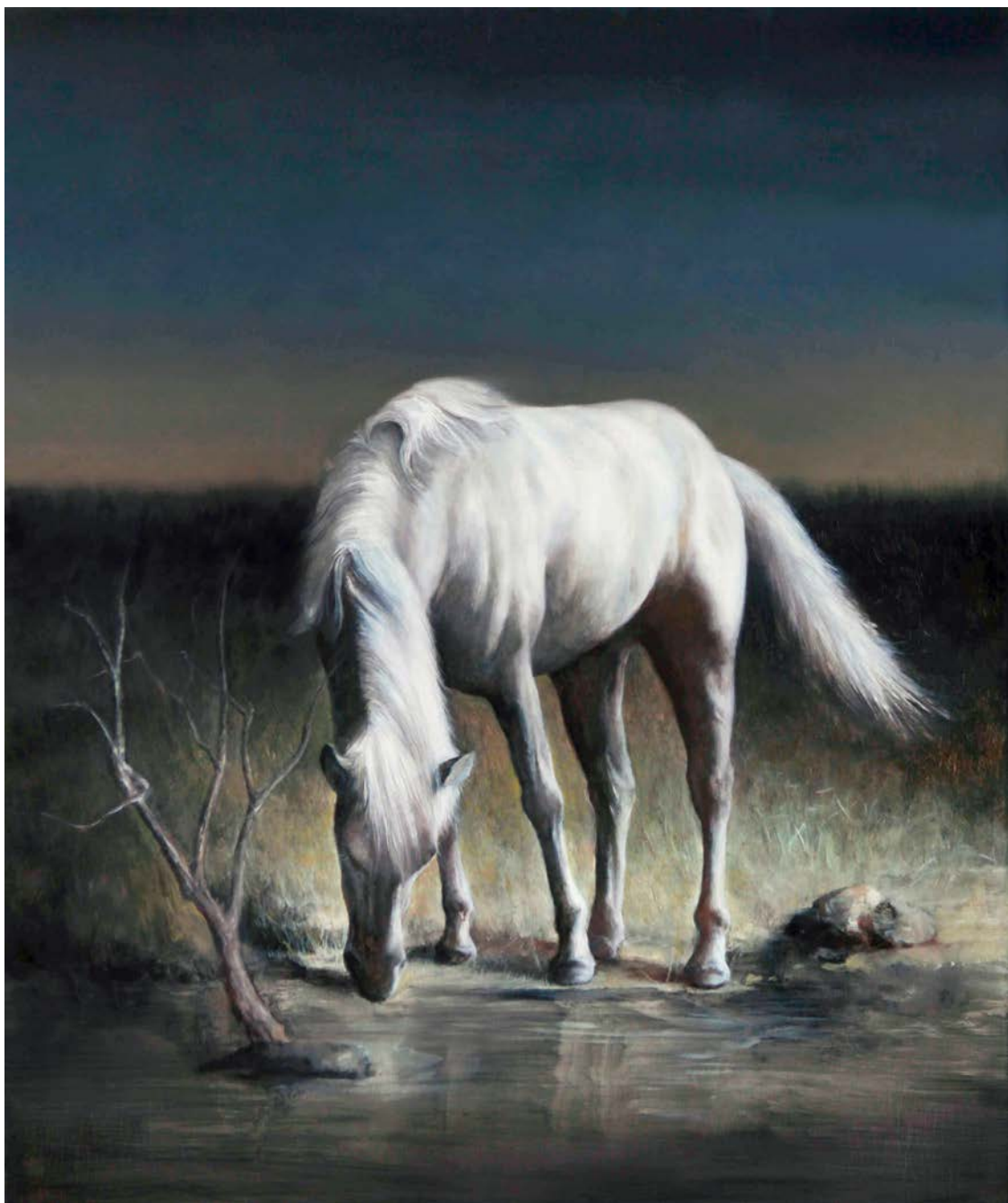
【幽泉】60x50cm 布面油画 2014