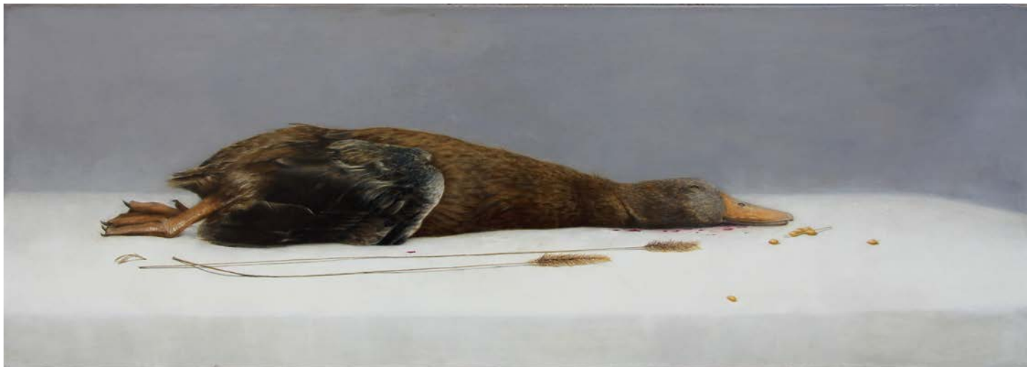
【逝系列 1】35×100cm 布面油画 2012