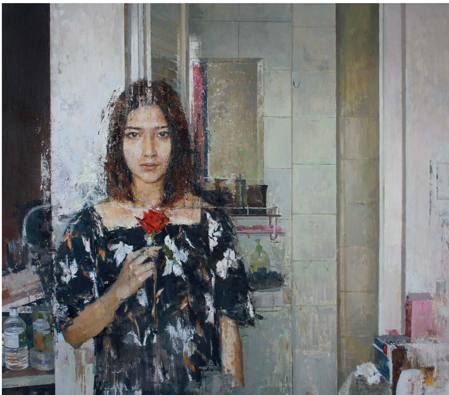
【玫瑰】 120x105cm 布面油画 2014