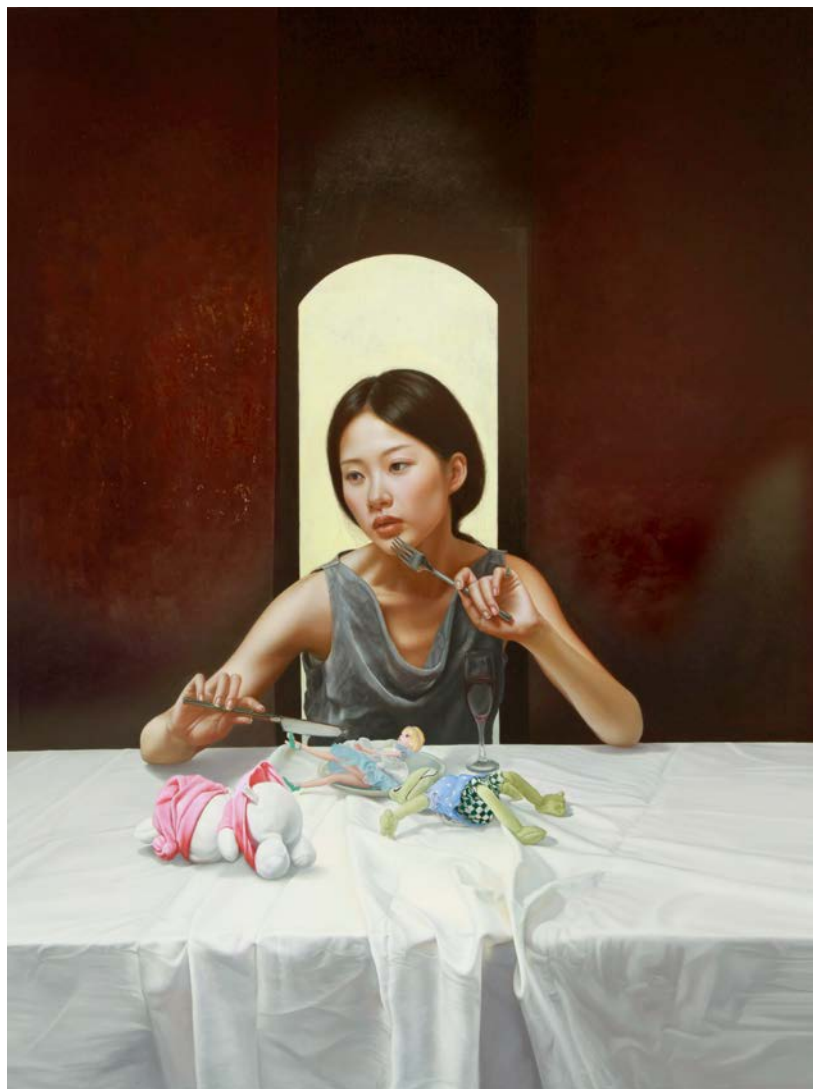
【航海日志】 83x64cm 布面油画 2013 左 【每一个逝去的都有值得回忆的理由】 120x90cm 布面油画 2013 右

the paintings until now, thousands of years of exploration, especially near the contemporary linguistic exploration and experimentation of various genres in painting, has been very good and rich. In painting through the history to find one suitable for your language, using the language and skills to express your own inner story, it's like writing, you can choose to use either English or Chinese. Subsequently when the new old, old and new is new. What concerns me most is that how the classicism to the traditional aesthetic with his own story in the present context, integration of another novelty.