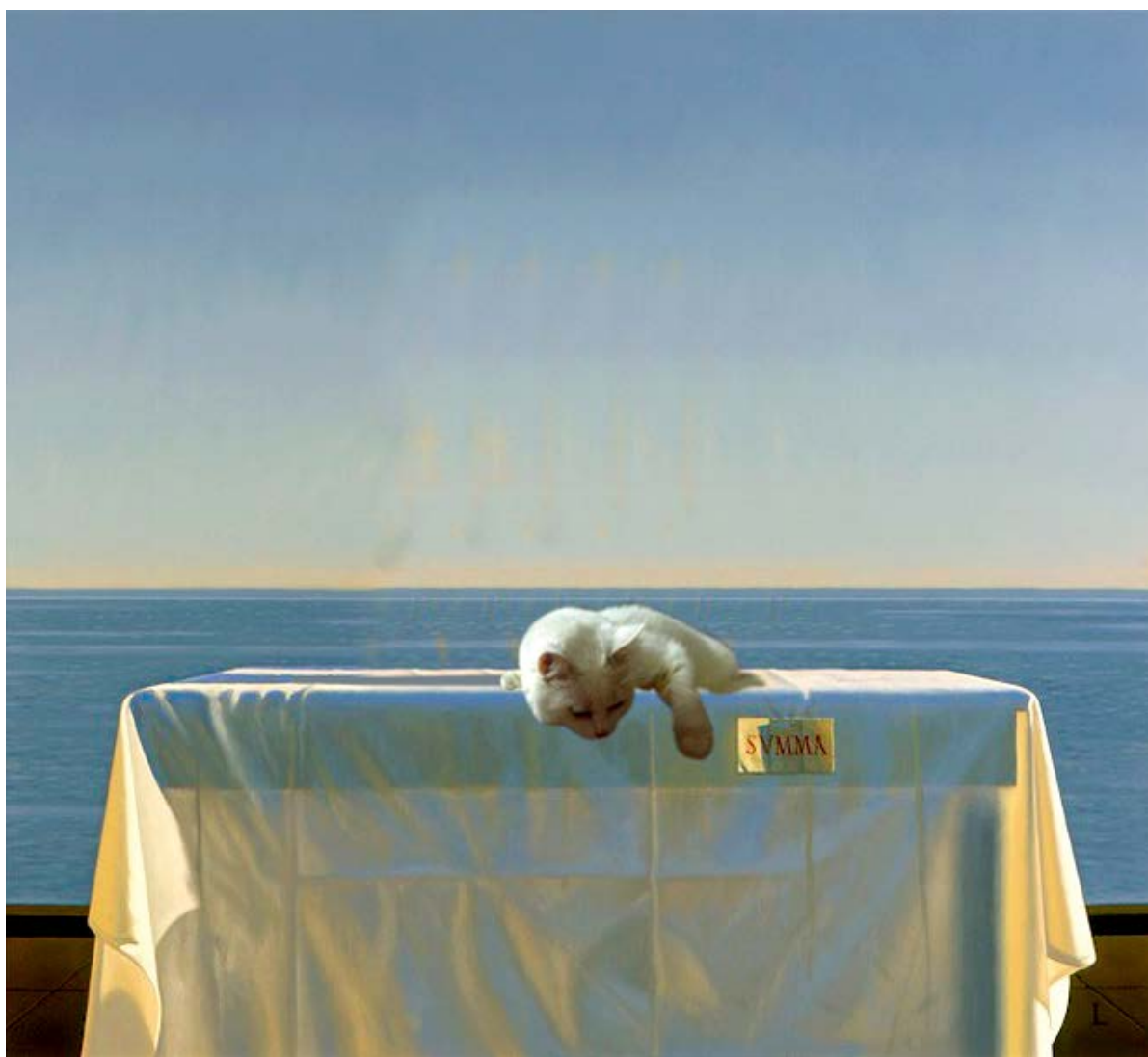
【逝系列 6】75x100cm 布面油画 2013

essential life condition and personality trait for art career.