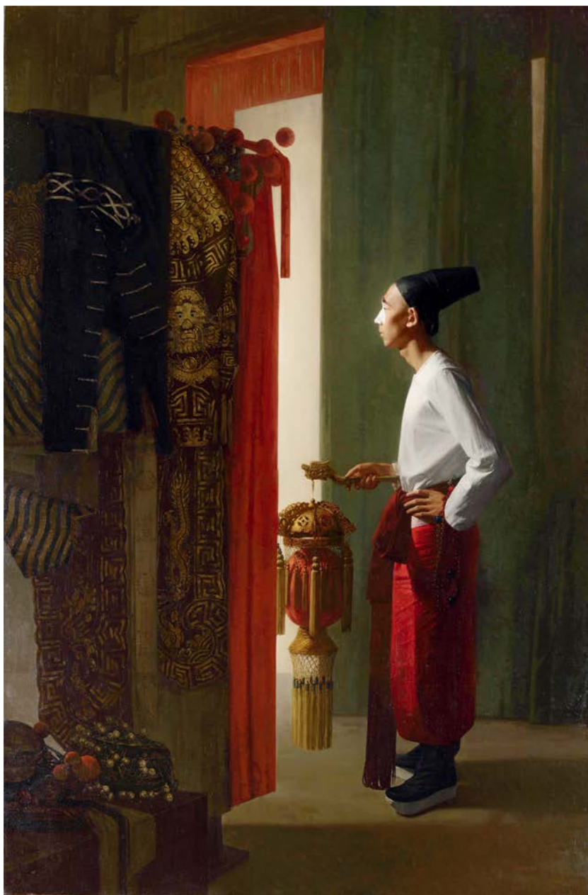
【传灯】180x120cm 布面油画 2014 上