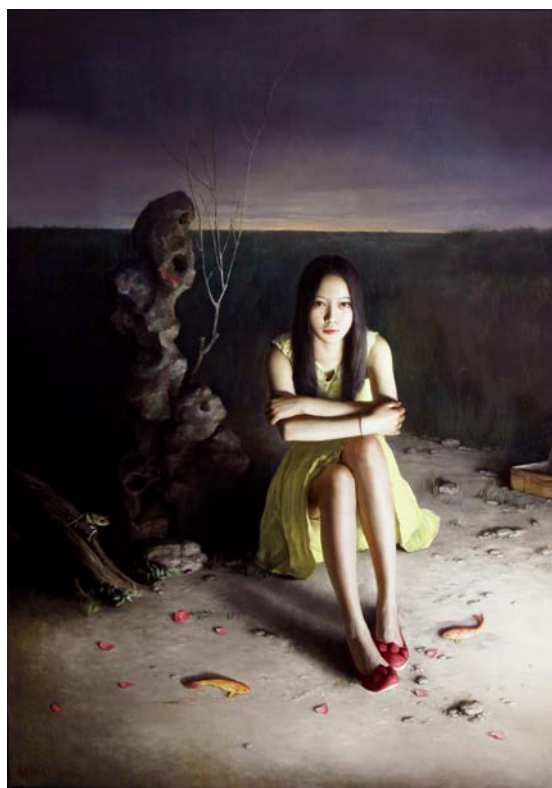
【米小姐的荒芜花园】 180x130cm 布面油画 2013