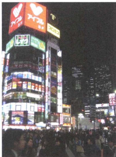
Advertising with high energy in Shinjuku, Japan.

Since the 1973 oil crisis, energy conservation has been an issue in Japan. All oil based fuel is imported, so indigenous sustainable energy is being developed.