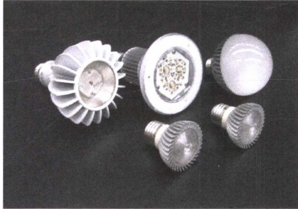
An assortment of energy-efficient semiconductor (LED) lamps for commercial and residential lighting use. LED lamps use at least 75% less energy, and last 25 times longer, than traditional incandescent light bulbs.

lower lifespans when compared to modern compact fluorescent and LED bulbs. Although these energy-efficient alternatives have a higher upfront cost, their long lifespan and low energy use can save consumers a considerable amount of money. The price of LEDs has also been steadily decreasing in the past five years, due to improvement of the semiconductor technology. Many LED bulbs on the market qualify for utility rebates that further reduce the price of purchase to the consumer. Estimates by the U.S. Department of Energy state that widespread adoption of LED lighting over the next 20 years could result in about $265 billion worth of savings in United States energy costs.