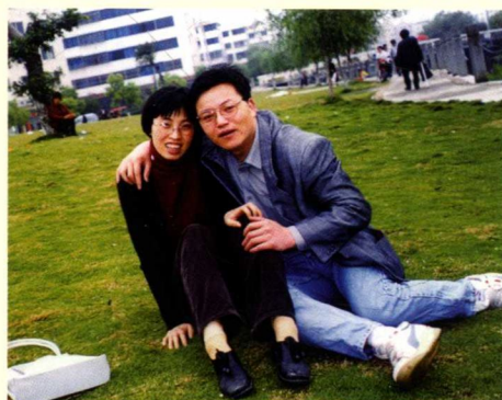
作者（3 岁时）拍摄的第一张照片 The First Picture I Took( At the Age of 3)