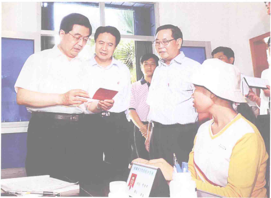
President Hu Jintao asked the villagers about the new rural cooperative medical system (NRCMS) at the health center of Betelnut Village, Pheonix Town, Sanya of Hainan Province, April 9, 2008.