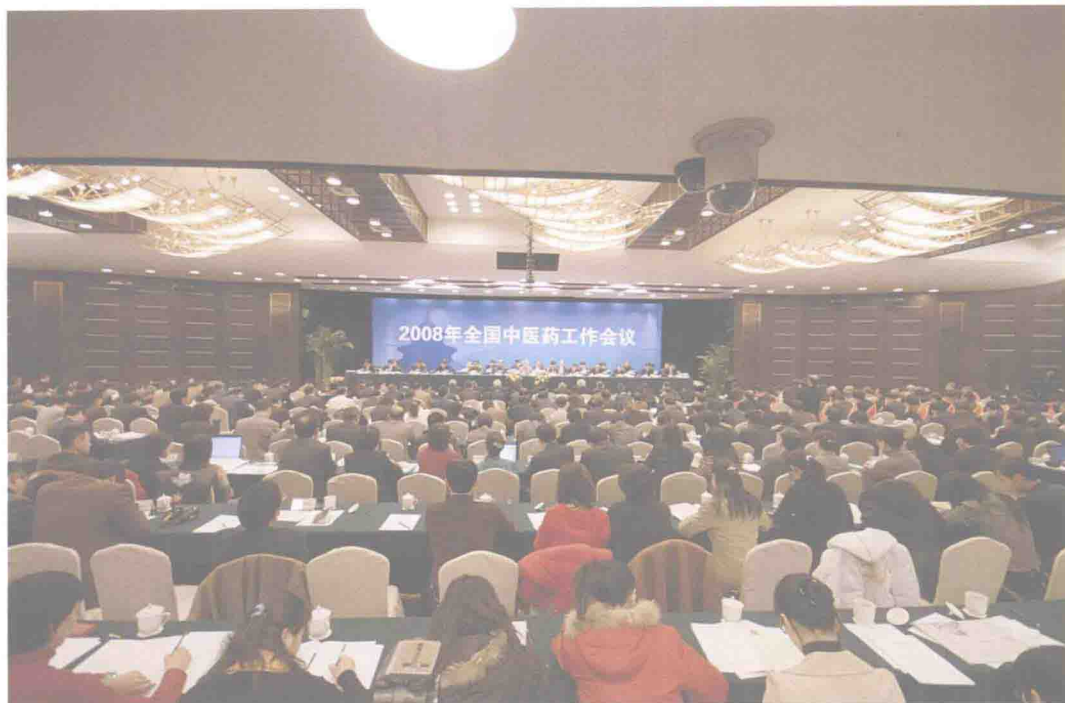
The National Conference on Traditional Chinese Medicine and Pharmacology was convened in Beijing, Jan. 24-25, 2008.