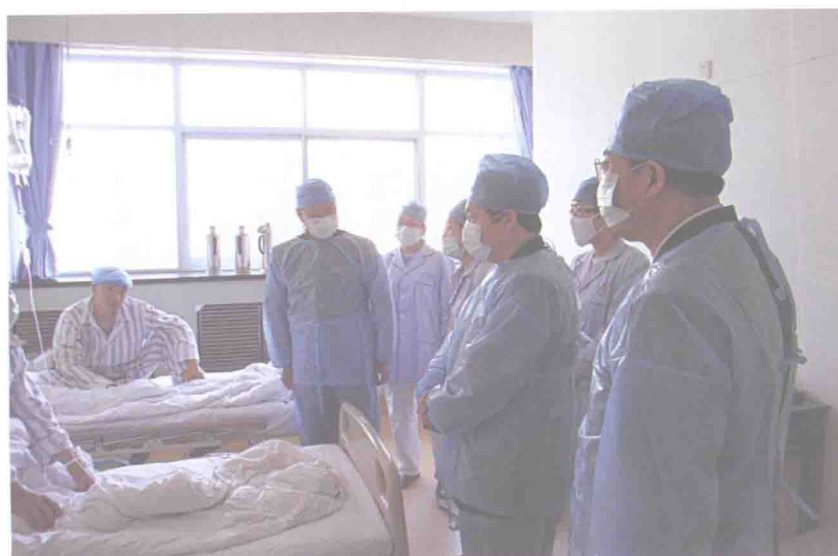
The Cobalt 60 Incident of Shanxi Academy of Agricultural Sciences was under investigation and the treatment for the victims was under way, April, 2008.