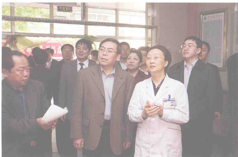
Deputy Minister of Health Liu Qian and his party conducted survey and research on the community health service in the districts of Tanggu, Hedong and Hexi of Tianjin, April 16-17, 2008. They also attended the seminar on the establishment of the cooperative mechanism for community health institutions and major hospitals.