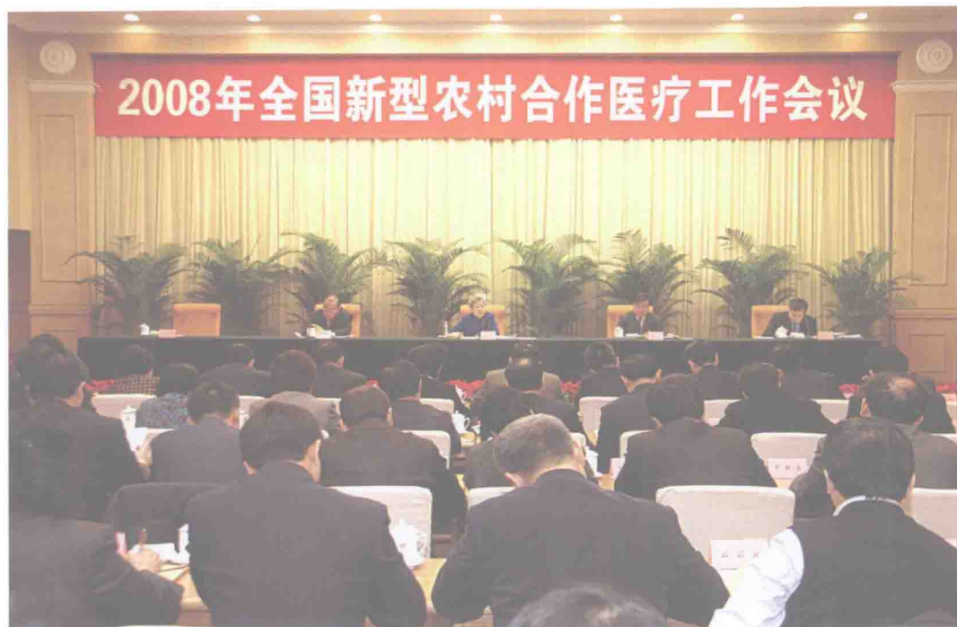
The National Conference on the New Rural Cooperative Medical System (NRCMS) was convened in Beijing, Feb. 14-15, 2008.