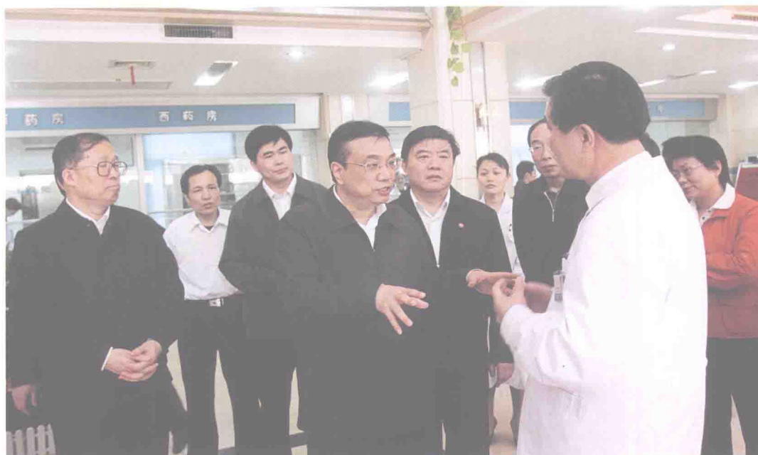
Vice Premier Li Keqiang inspected the community health service center of Honggangcheng Street in Qingshan District, Wuhan of Hubei Province, April 6, 2008.