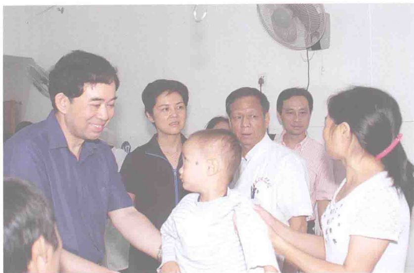
Li Xi, leader of resident discipline inspection group of Central Discipline Inspection Commission in Ministry of Health, gave instructions to the rescue and treatment of the babies stricken with "Sanlu" powdered milk in Jiangxi Provincial Children's Hospital, Sept. 26, 2008.