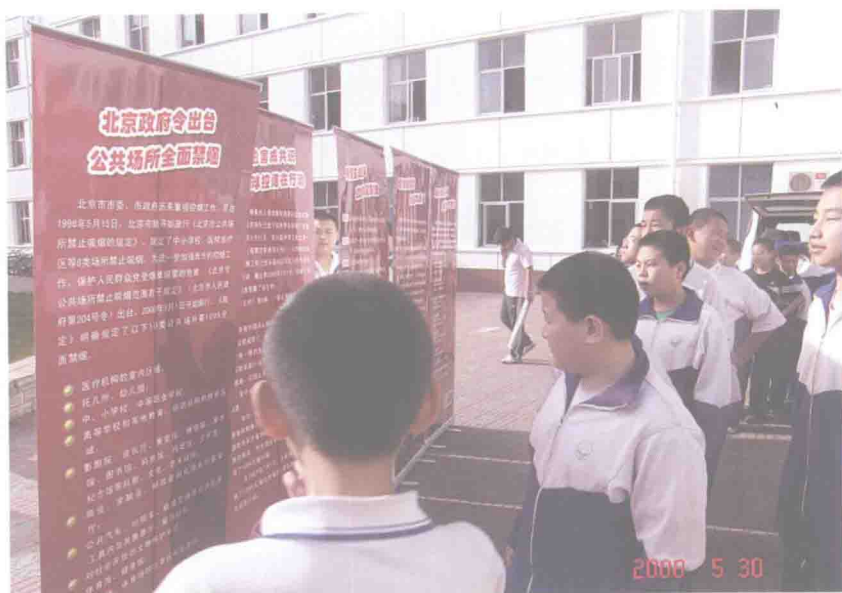
Beijing Municipal Government approved Several Regulations on Smoke-free Areas in Public Places of Beijing , Mar. 31, 2008, which would take effect since May 1, 2008.