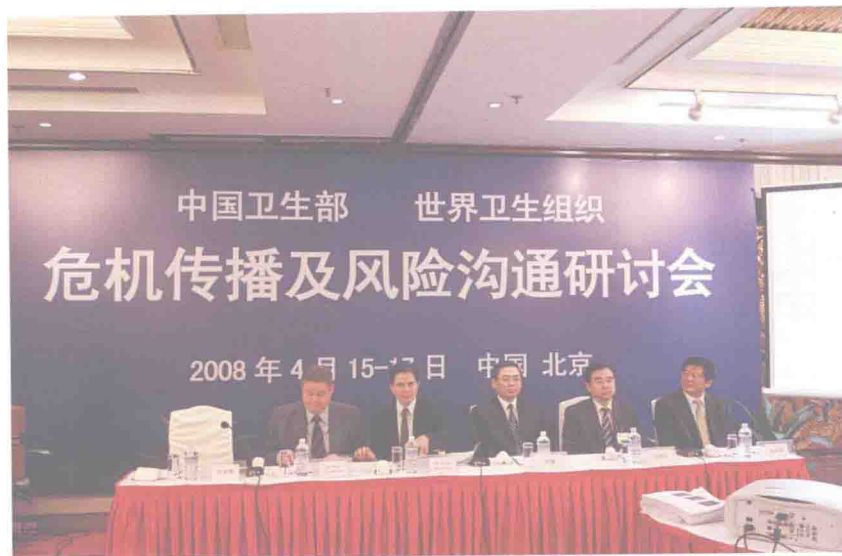
WHO/Chinese Ministry of Health Symposium on Crisis Transmission and Risk Communication was held in Beijing, April 15-17, 2008.