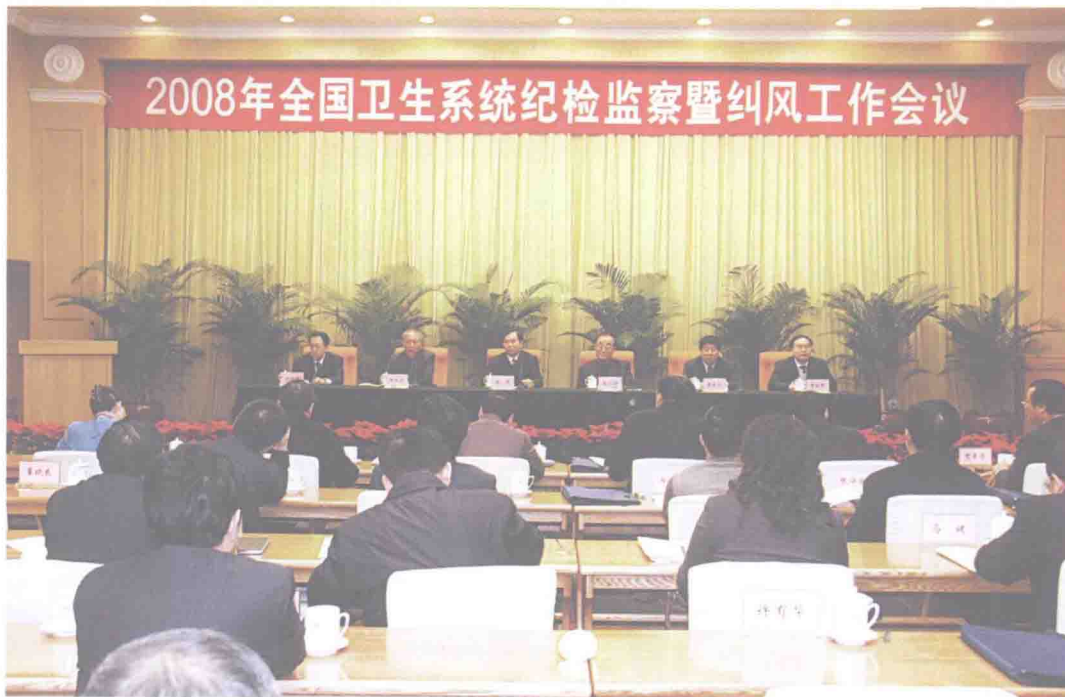
2008 National Conference on the Disciplinary Inspection & Supervision/Rectification of Medical Unhealthy Tendencies within Health Circles was convened in Beijing, Jan. 21-22, 2008.