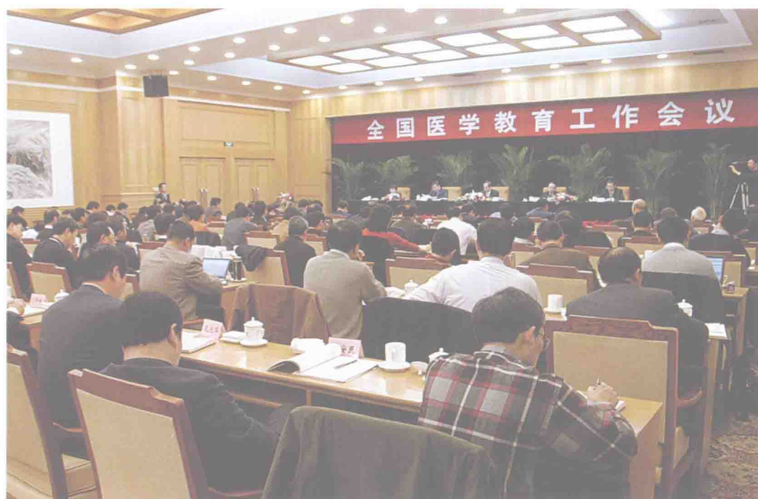
The National Conference on Medical Education was convened in Beijing, Feb. 28, 2008.