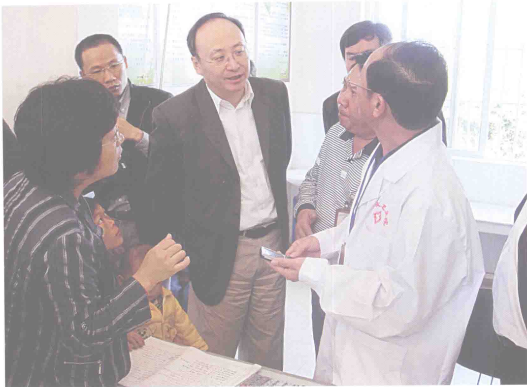
Deputy Minister of Health Yin Li inspected the designated medical institution under the new rural cooperative medical system (NRCMS) in Longhua District, Haikou of Hainan Province, Dec., 2008.