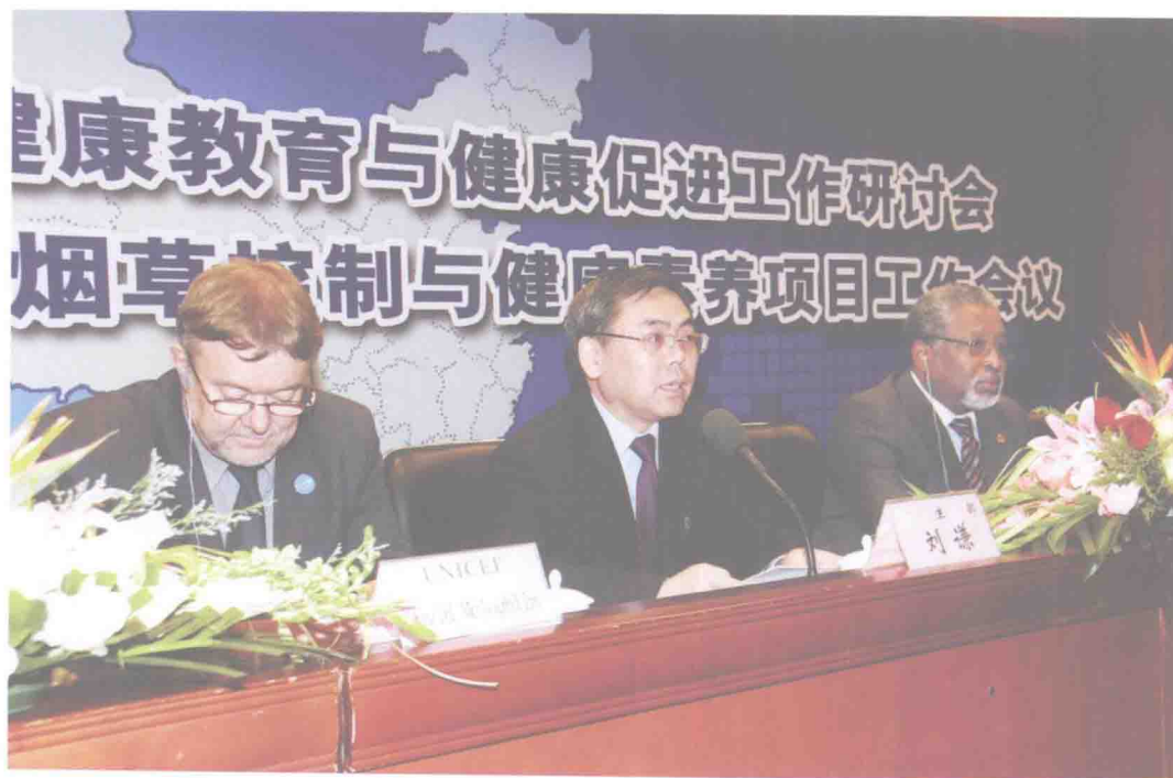
2008 National Symposium on Health Education & Promotion/Conference on the Program of Tobacco Control & Health Accomplishment with a Subsidy Granted by the Central Government was held in Beijing, Jan. 16-17, 2008. Deputy Minister of Health Liu Qian addressed the Conference.