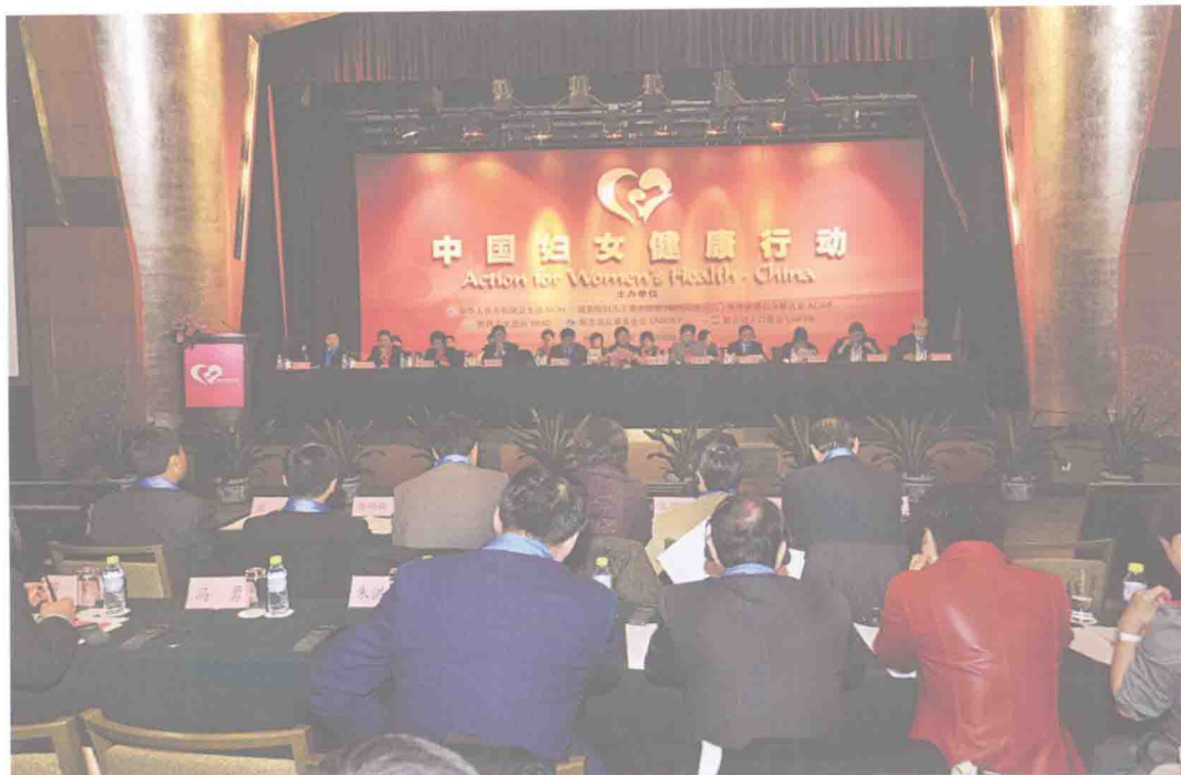
The Symposium on Action for Women's Health • China with the attendance of the departments concerned was held in Beijing, Mar. 1, 2008. The Symposium was cosponsored by Ministry of Health, the Office of National Working Committee on Children and Women under the State Council, All-China Women's Federation, World Health Organization (WHO), United Nations Children's Fund (UNICEF) and United Nations Population Fund.