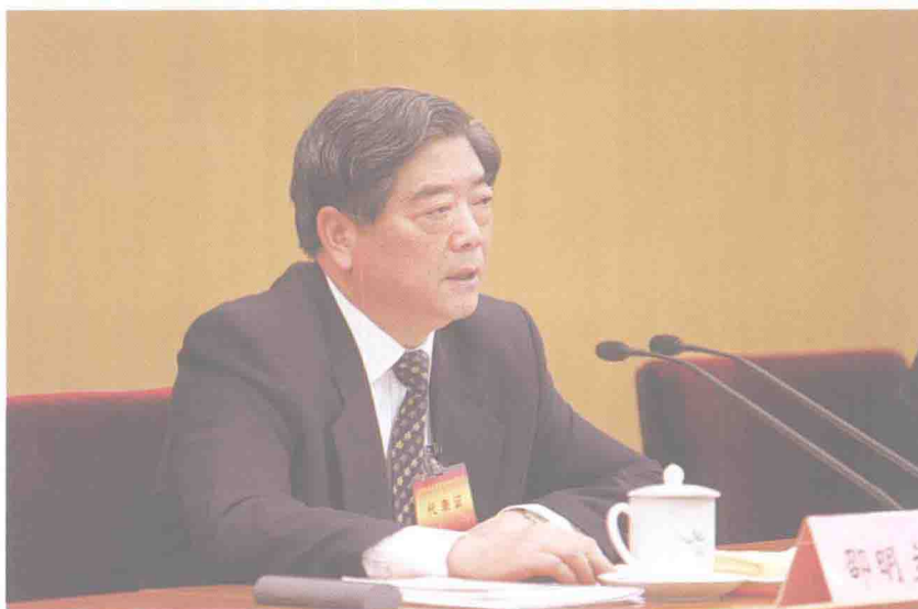
Deputy Minister of Health Shao Mingli, who is also Commissioner of State Food and Drug Administration, addressed the National Conference on the Supervision and Management of Food & Drug/Improving the Party's Working Style and Building the Clean Government, Jan. 30-31, 2008.