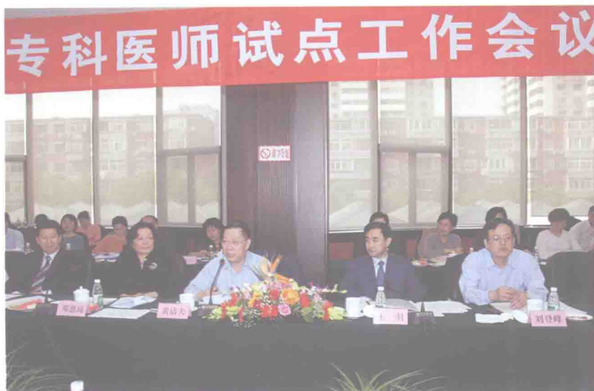
The Launching Meeting on the Pilot Project for Specialists was convened in Beijing, April 18, 2008. Deputy Minister of Health Huang Jiefu attended the Meeting and made deployment of the pilot work.