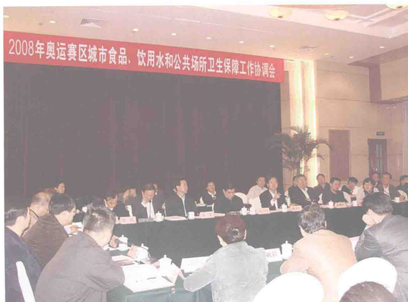
Ministry of Health held the coordinative meeting on the health security for urban food supplies, drinking water and public places of the Olympic playing areas in Beijing, April 25-26, 2008, in accordance with the overall arrangements of the work program for the Olympic health security of Ministry of Health.