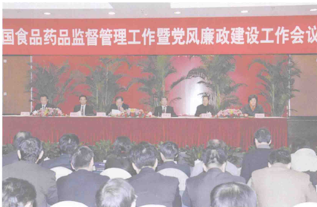
The National Symposium on the Supervision and Management of Food & Drug /Meeting on the Work of Improving the Party's Work Style and Building the Clean Government was held in Beijing, Aug. 19, 2008.