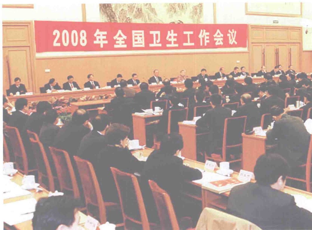
2008 National Conference on Health Work was convened in Beijing, Jan. 7, 2008.