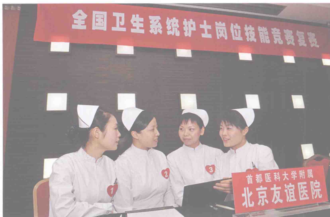
The quarter-final of the skill contest for nurses was held, Mar. 26, 2008.