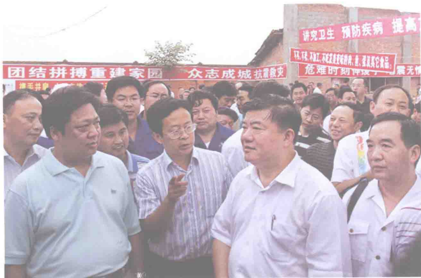
Minister of Health Chen Zhu inspected Jingan victim shelter, the comprehensive demonstration pilot project for disease prevention and the post-earthquake reconstruction of the health center of Sangzao Town, An County, Mianyang, June 20, 2008.