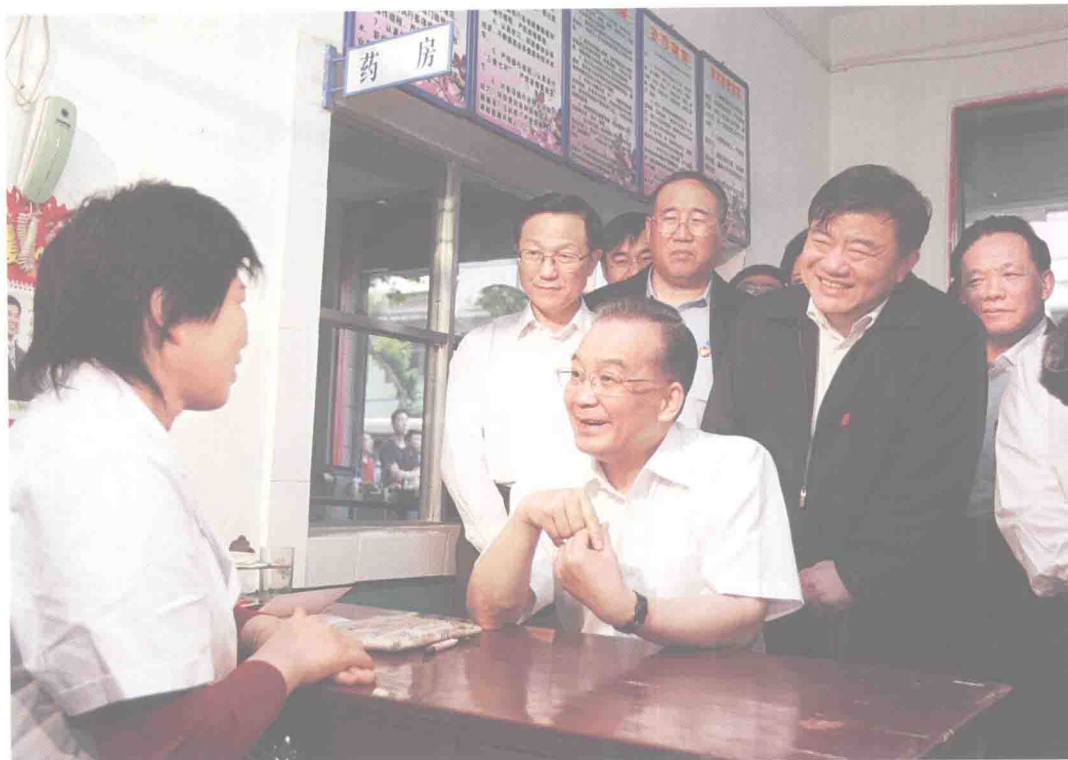
Premier Wen Jiabao learned about the epidemic prevention for the villagers from a health care worker at the health center of Danshui Village, Danshui Town, Xixia County, Henan Province, May 10, 2008.