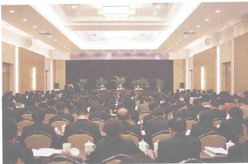
2008 National Conference on Health Supervision was convened in Beijing, Mar. 27-28, 2008.