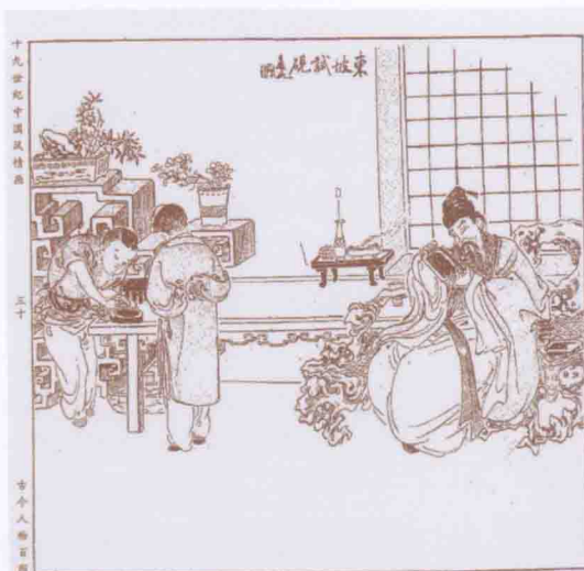
吴有如《古今人物百图》 Portrait of Su Dongpo in contemplation, drawn by Wu Youru