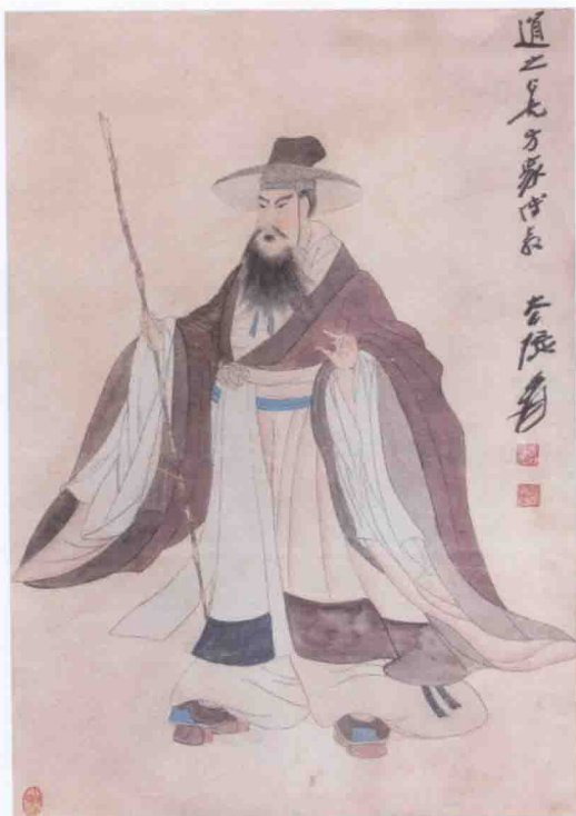
张大千《苏东坡像》 Portrait of Su Dongpo drawn by Zhang Daqian