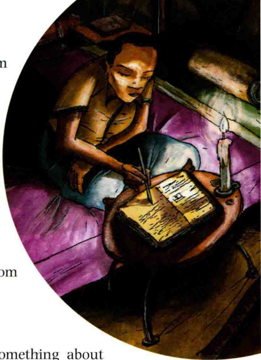
Good night, diary.

I don't know what other people think about all day, but I think about Tutankhamun. Mr Carter says he lived with his brothers and sisters when he was a little boy. Later he married the beautiful Ankhesenamun. Some people say he has no tomb because he died suddenly when he was very young. But tombs were very important in old Egypt and Mr Carter thinks Tutankhamun has his tomb somewhere in this valley. But where?