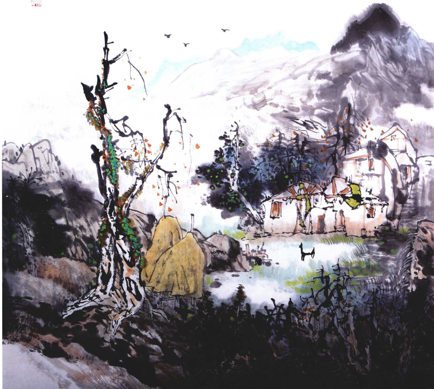
初晴 国画 68cm×68cm 2014年 何力