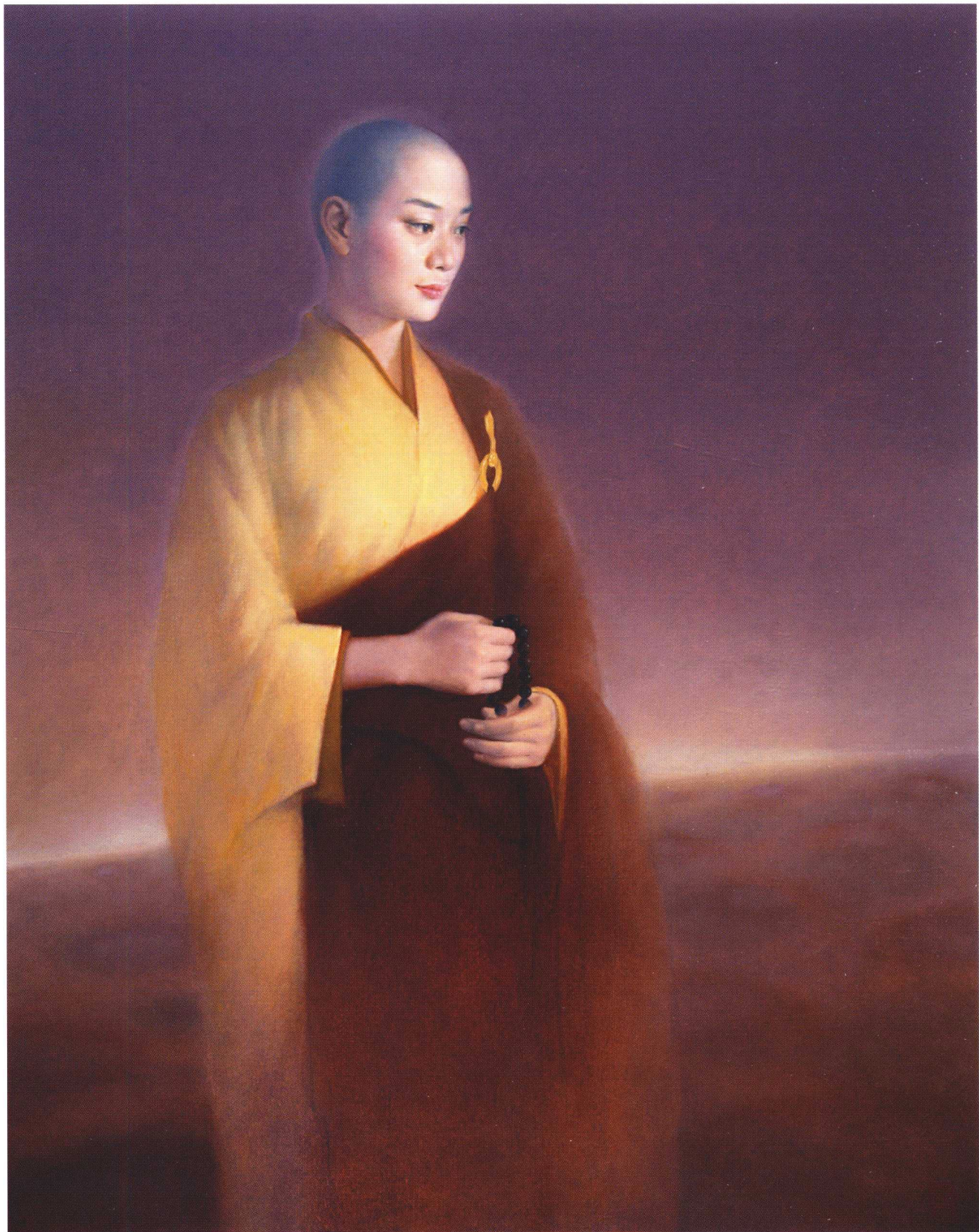
尼众·际 布面油画 120cm×95cm 丁超