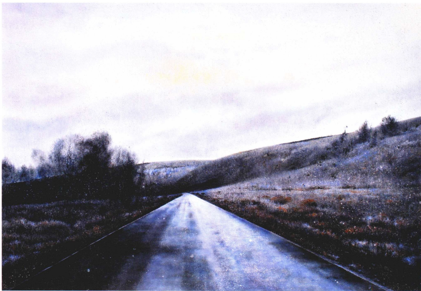
远行 水粉 110cm×80cm 2009年 陈祥杰