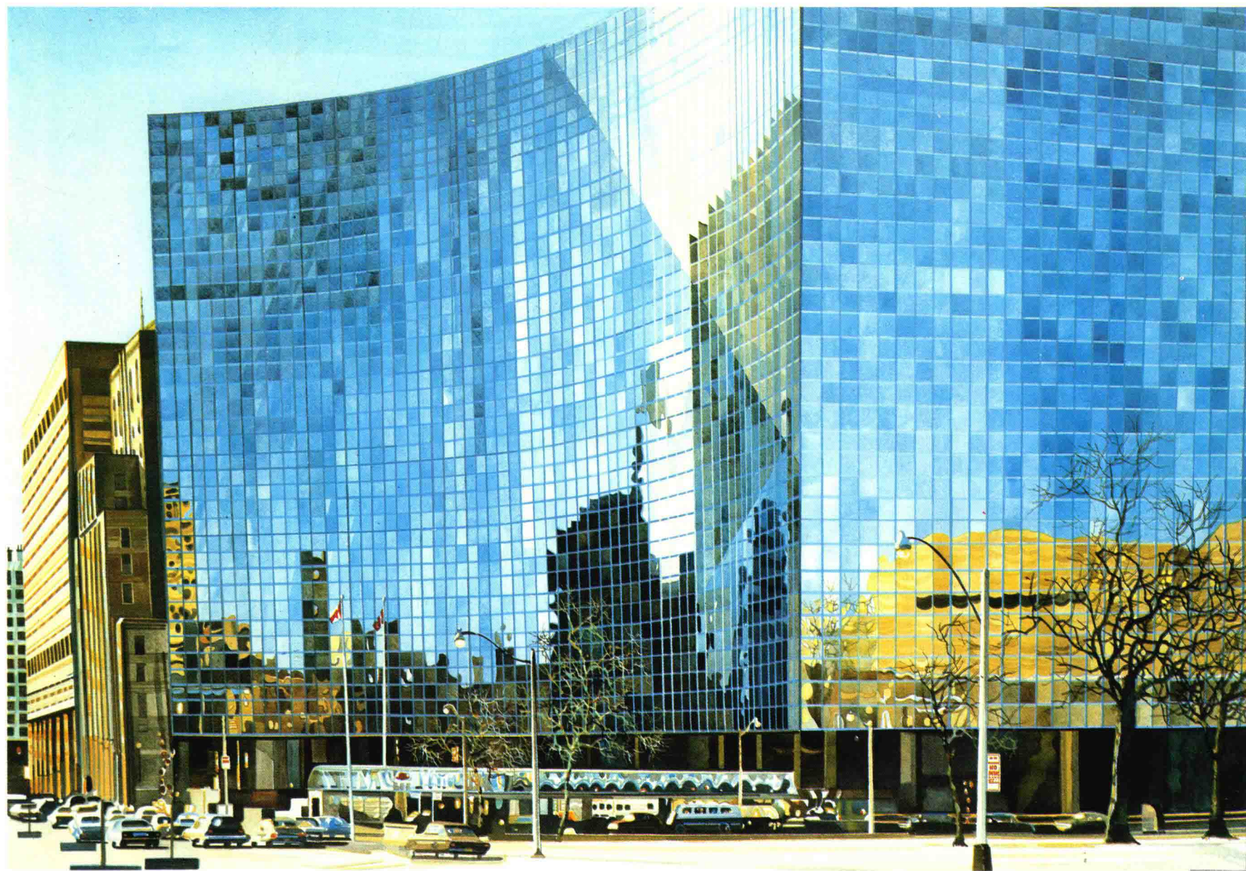
無題(水彩畫) Untitled (Watercolor) 46.4×67cm 1976