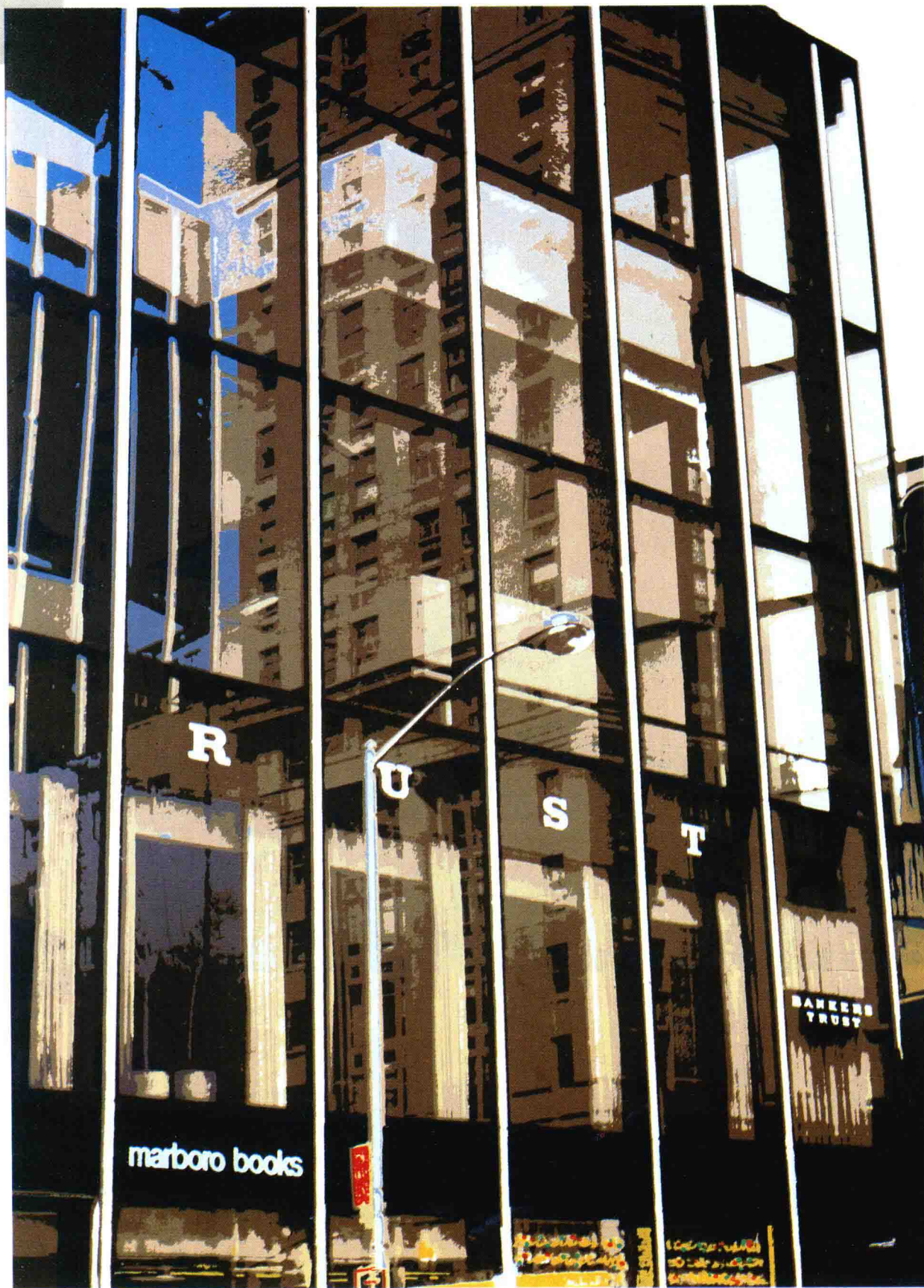
馬波羅書店 (絹印版畫) Marboto Books (Screenprint) 72.7×52cm 1974