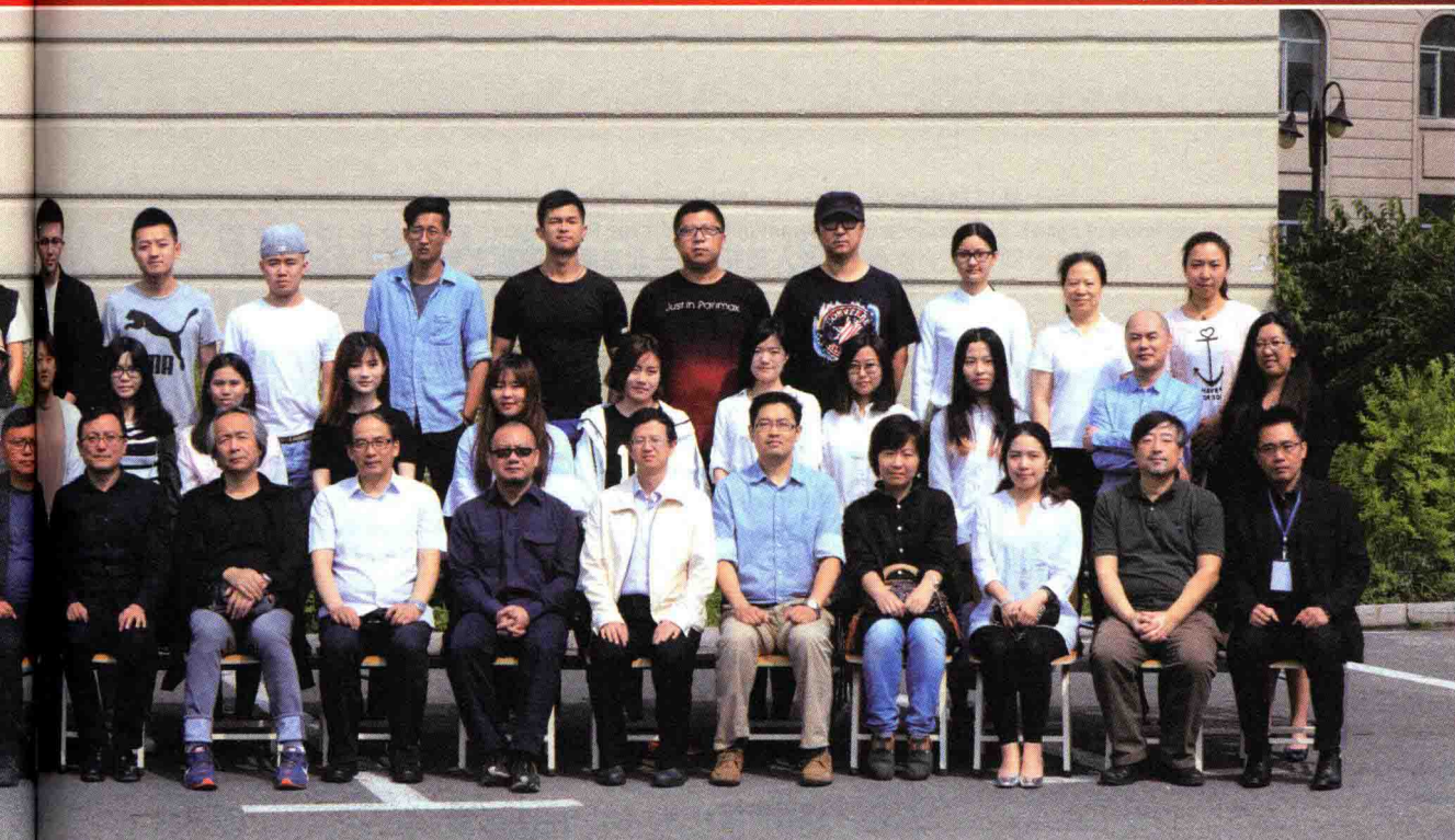
CIID “室内设计 6+1” 2016 (第四届) 校企联合毕业设计 全体师生合影