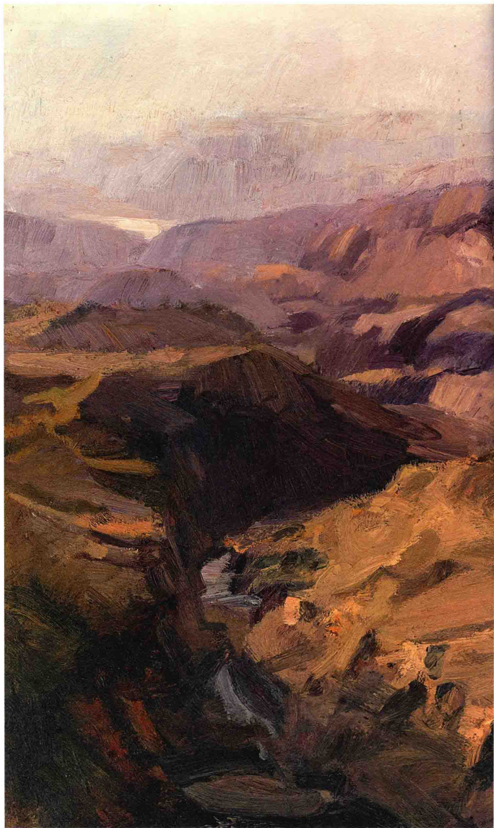
惟余莽莽 Luxuriant whiteness 110 × 160cm 2013 布面油画 / Oil on canvas