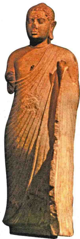
• 印度释迦牟尼佛立像 Standing Statue of Sakyamuni