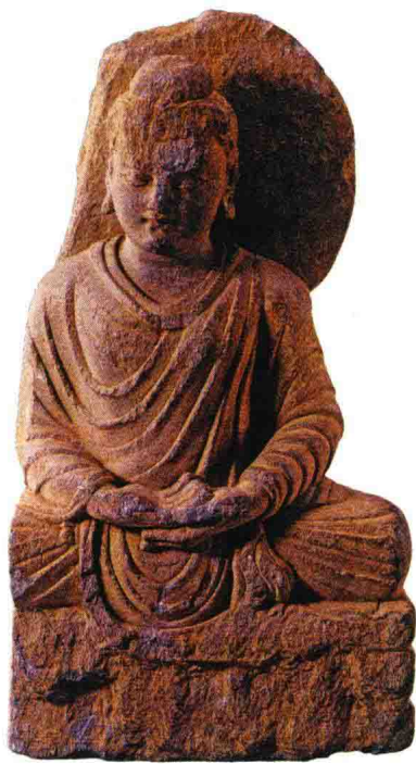
• 印度释迦牟尼佛坐像 Sitting Statue of Sakyamuni

空白，或是脚印、莲花、菩提树等象征物来表现佛陀是远远不够的。再者考虑到信徒们阅读经文时，倘若面前有一尊佛像的话，就能很容易进入“冥想”（修行、禅思）的境界。于是佛教徒们吸收了希腊艺术的表现形式，以传说中的理想帝王——转轮圣王的身体特征为依据，再加上一些超于凡人的特征来