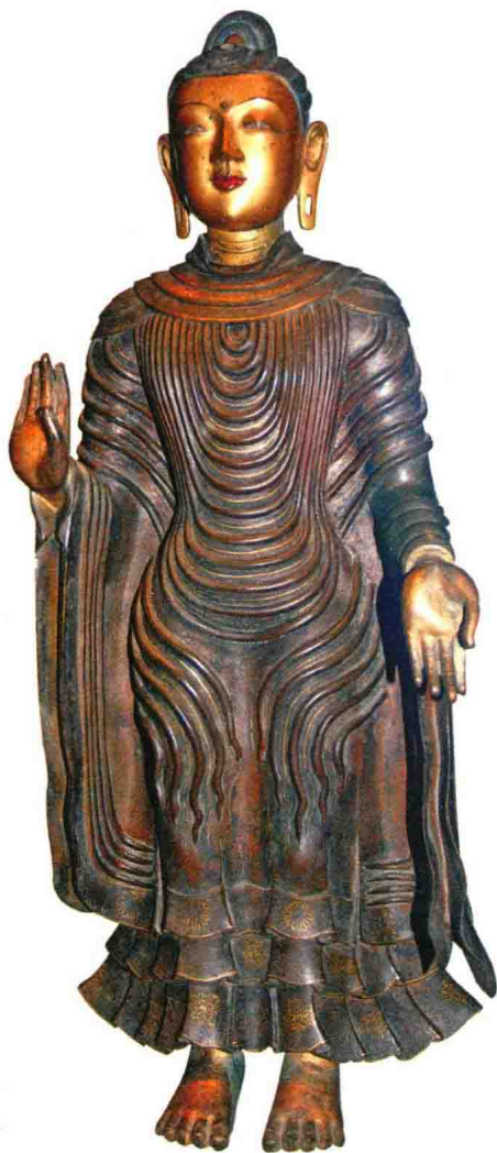
• 铜镀金旃檀佛像（清） Gold-Plated Copper Chandana Buddha Statue

According to the sutras, when Sakyamuni was with his disciples in the Veluvana Bamboo Grove monastery in Rajagaha, he was invited by Sakra-devanam-Indra to go to the Trayastrimsa Heaven Palace and deliver the Buddhist doctrine for his deceased mother, Maha Maya. When he was up in the Heaven Palace, the King Udayana missed Buddha so much, so he ordered people to use the ox-head chandana wood (an ancient name for sandalwood) to carve out a statue of Sakyamuni. Meanwhile, another King Sini also made people to cast a statue of