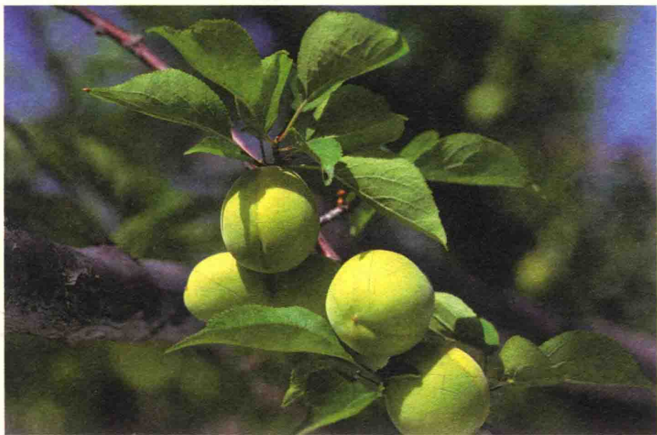
• 枝头的青梅 Greengages on the branch

景，联想到时光无情，自己青春流逝，却婚嫁无期，不禁以梅子起兴，唱出了对爱情的渴求。这首诗说明，当时在陕西地区梅树十分普遍，而且已经开始了引种野梅使之向家梅驯化的过程。在湖南长沙的马王堆汉墓的出土文物中，有一些陶罐里面放有完好的梅核和梅干，这说明在西汉初期，长江流域的人早已引种、栽培梅树，并利用梅子加工食品了。在栽种梅树、采摘加工梅子的同时，人们逐渐喜爱并欣