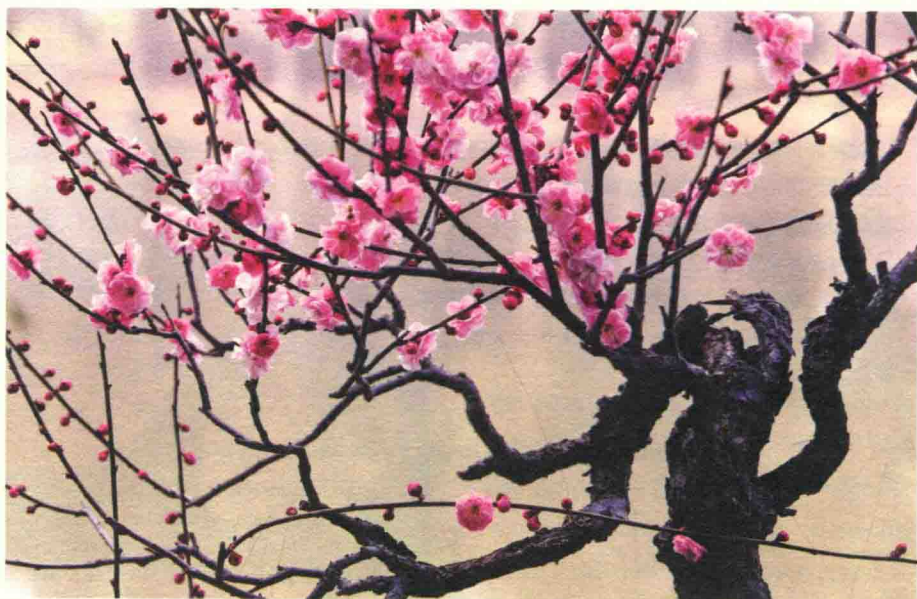
• 枝条扭曲的龙游梅 Tortuous plum with twisted branches

红梅等，用于食用；而花梅则以观赏为主，生长姿态各不相同。按照梅枝的姿态不同，花梅又可分为直枝类、垂枝类和龙游类三种。直枝梅是中国梅花中最常见、品种最多、变化最广的一类。垂枝梅的枝条自然下垂或斜出，形成独立的伞状树态；而龙游梅的枝条扭曲，姿态奇特，富有韵味。