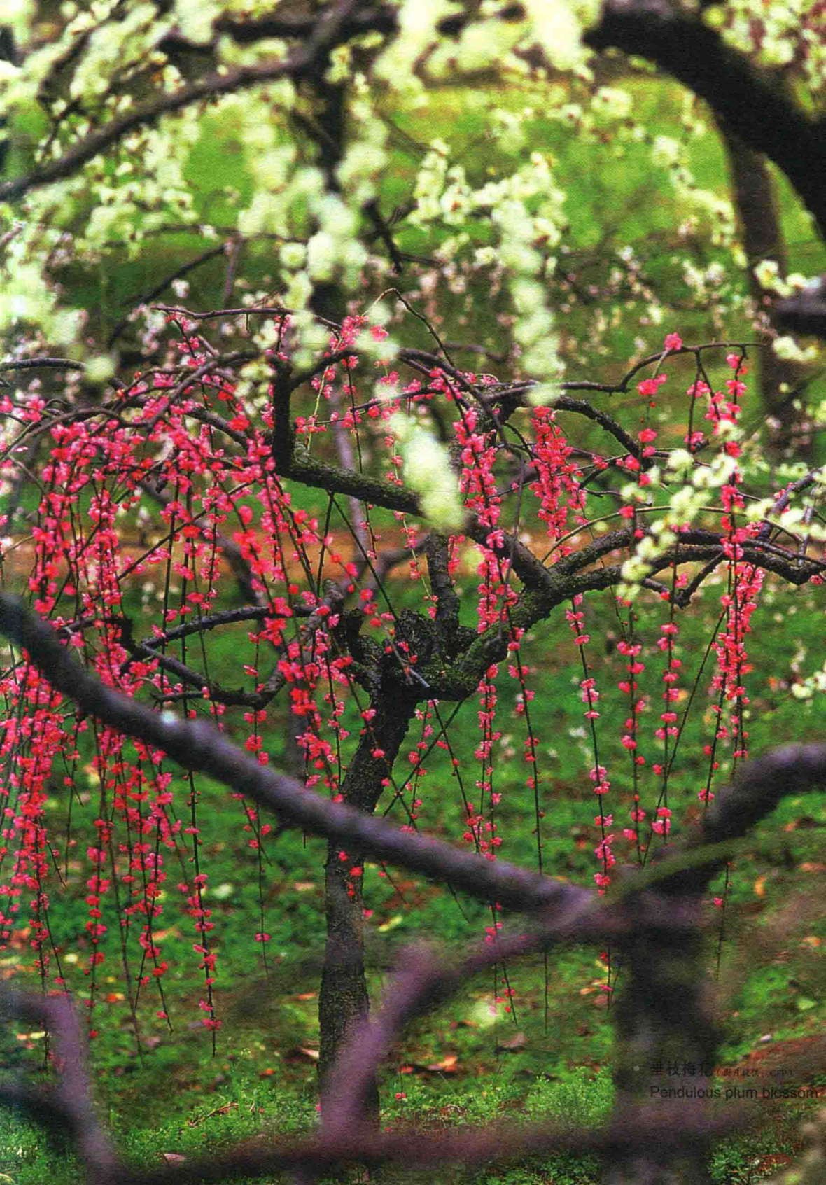
垂枝梅花 (興仁社、京都) Pendulous plum blossom