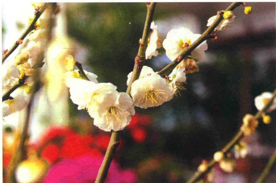
• 直枝梅花中的玉蝶梅 Upright jade butterfly plum blossom