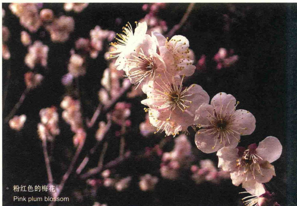
• 粉红色的梅花 Pink plum blossom