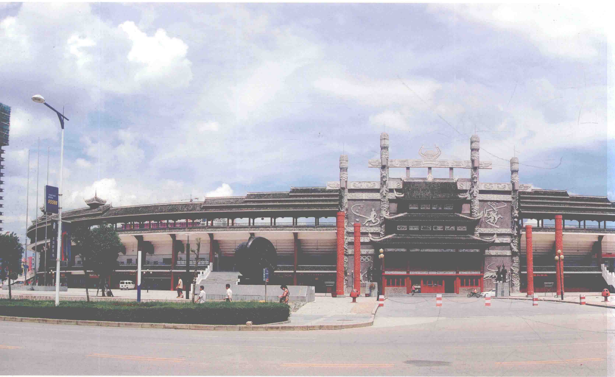
凯里民族体育场 Kaili National Stadium