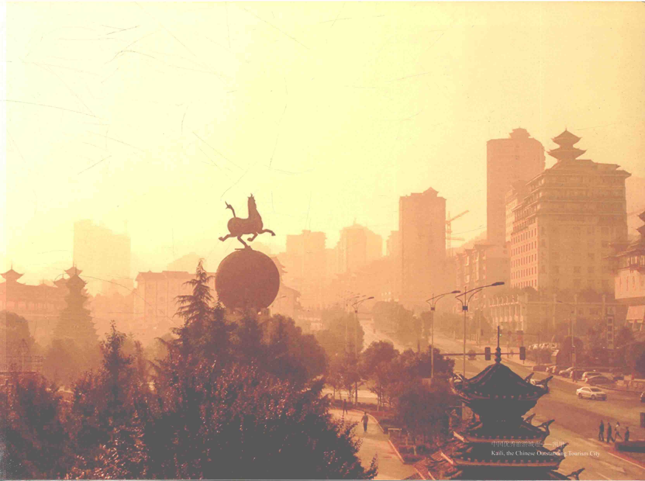
中国优秀旅游城市——凯里 Kaili, the Chinese Outstanding Tourism City