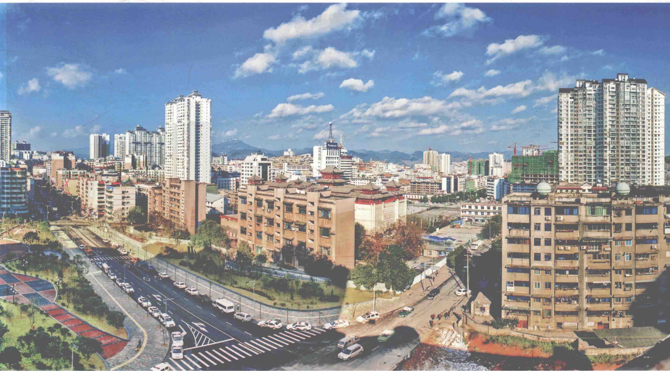
凯里城市风貌 Townscape of Kaili