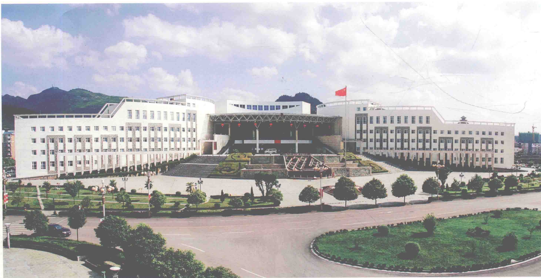
凯里市政广场 Kaili Civic Square