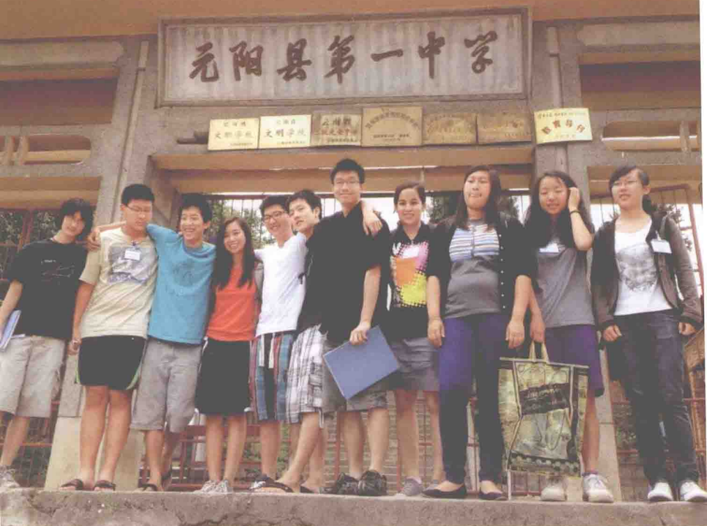
The Teeanage Teachers 小老师们