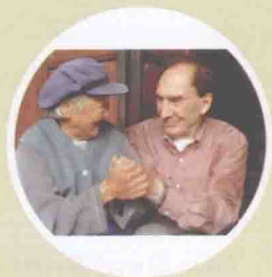
Our Oldest Volunteer 最老的志愿者