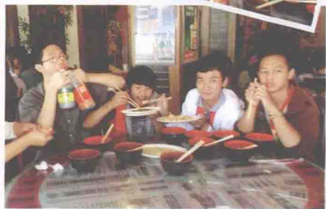
Touring the Old Town Center 古城游记