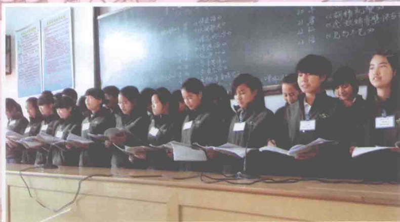
Reciting Poems 朗诵