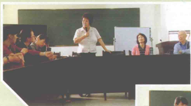
Meeting with Peach Graduates 感人的见面会