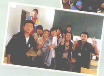
Game Day 游戏日