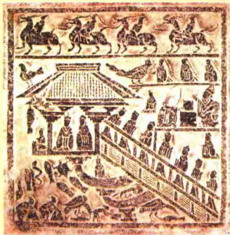
• 水榭人物画像石（东汉） Stone Relief with Waterside Pavilion and Figures (Eastern Han Dynasty, 25-220)

Stone reliefs, a rich artistic heritage of China, were highly popular during the Han and Wei Dynasties through the Sui and Tang Dynasties. They have been unearthed in large quantities in Shandong, Henan, Sichuan, Jiangsu and Shaanxi. Famous ones include the stone reliefs found on Song Mountain in Jiaxiang; Liangcheng Mountain in Jining; Yinan in Linyi, Shandong; Nanyang, Henan; Xuzhou, Jiangsu; and Suide in northern Shaanxi.