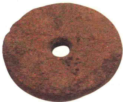
• 石纺轮（新石器时代） Stone Spinning Wheel (Neolithic Age, approx. 8,000 years ago)

近50年来，在各地高周墓葬中出土了大批石制品，除一般的工具外，还有一些石雕人物、动物、乐器和盘壶等。北京的故宫博物院和中国历史博物馆藏有河南境内出土的商代的大理石雕刻的牛头、坐兽、虎首人身怪兽、虎纹石磬、饕餮纹石皿、石盘等。上海博物馆也藏有商代晚期的羊耳夔纹石壶。这些石雕造型生动，用刀简洁豪放，可以看出当时工匠们的雕刻技艺已经达到很高水平。