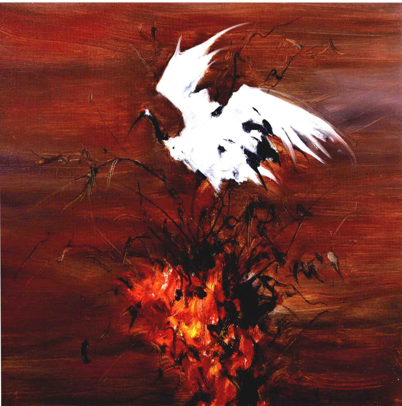
寸草集·司空 布面油画·丹培拉 Young Grass Collection • in Charge of Sky Oil on Canvas • Tempera 50x50cm 2013