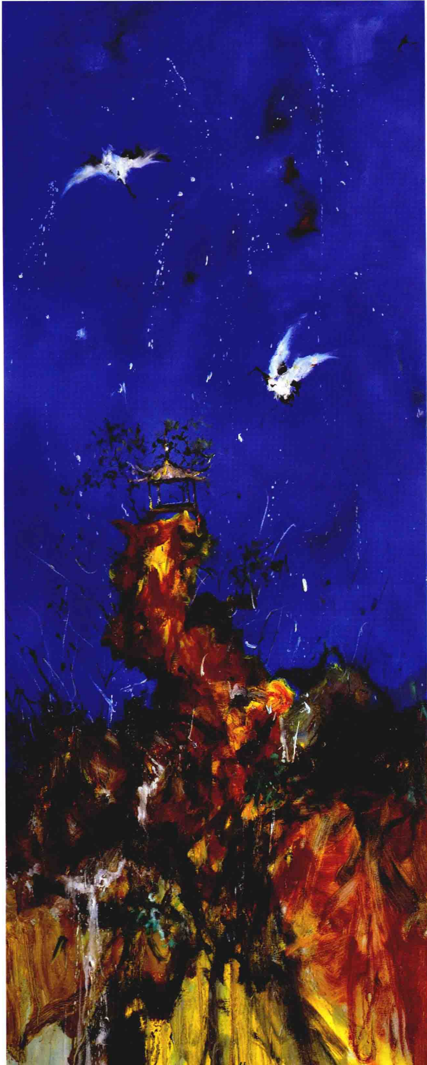
古琴台 布面油画 Guzintai Oil on Canvas 160x60cm 2013