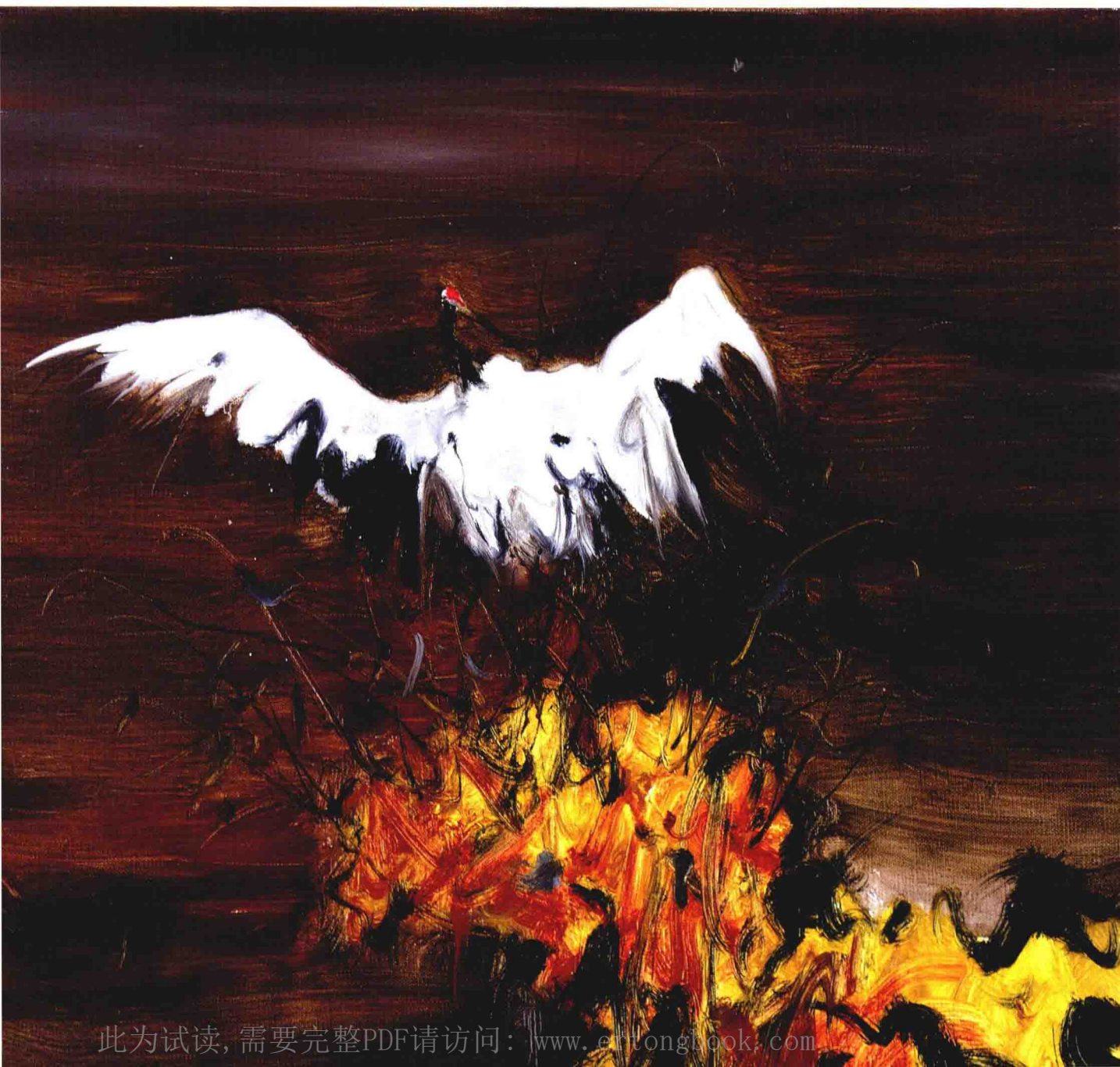
寸草集 • 风行 布面油画 • 丹培拉 Young Grass Collection • Gone with the Wind Oil on Canvas • Tempera 50x50cm 2013