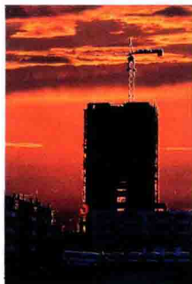
建設中的郵電大廈 Post and Telecommunication Mansion in building