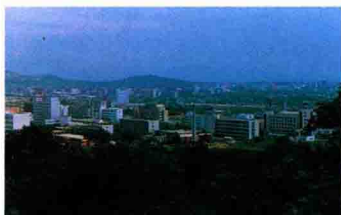
營口經濟技術開發區 Yingkou Economic and Technologic Development Zone