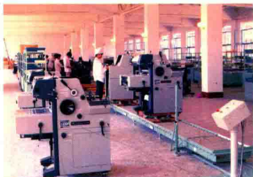
營口復印機有限公司 Yingkou Duplicating Machine Co., Ltd.