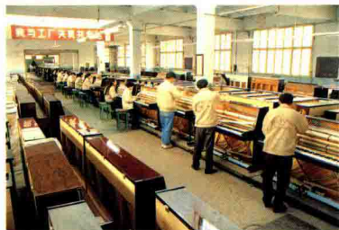
營口東北鋼琴(集團)公司 Yingkou Northeast Piano (Group) Co.

In 1992, the State Council approved the founding of Yingkou Economic and Technologic Development Zone and enjoyed the relevant policies. A series of foreign investment preferential policies have also been issued by Yingkou.