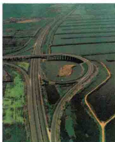
瀋(陽)大(連)高速公路 Shenyang-Dalian Expressway