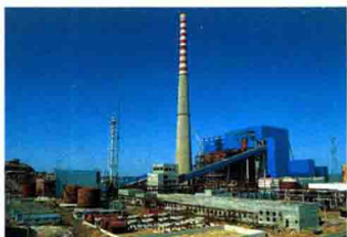
華能營口電廠 Yingkou Huaneng Power Plant

地。全市已有十四大類 300 多個品種出口，針紡織品、礦產品、機電產品是主要出口商品，年出口貨額在 20 億元左右。