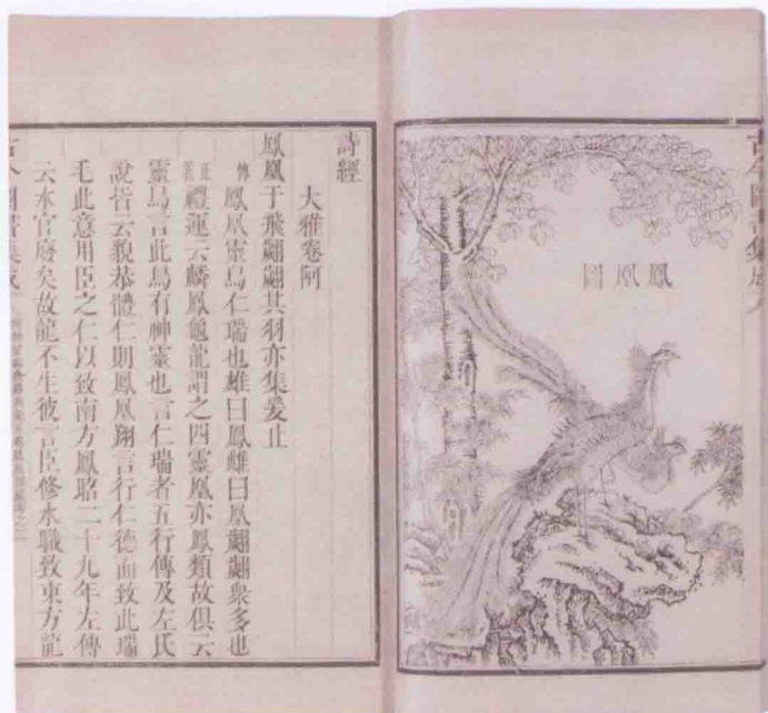
《诗经》书影 Book of Poetry (Qing Edition) 1644—1911