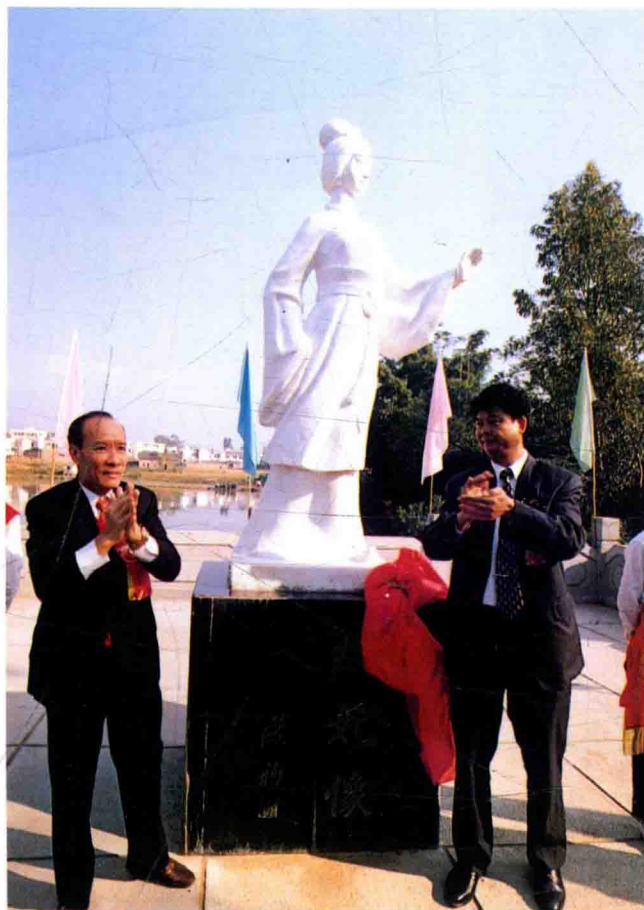
黎子流市長、邱隆基縣長為“胡妃玉像”揭幕。 Mayor Li Ziliu and Mr. Qiu Longji, the county Magistrate, are unveiling "the Jade Statue of Imperial Concubine Hu".