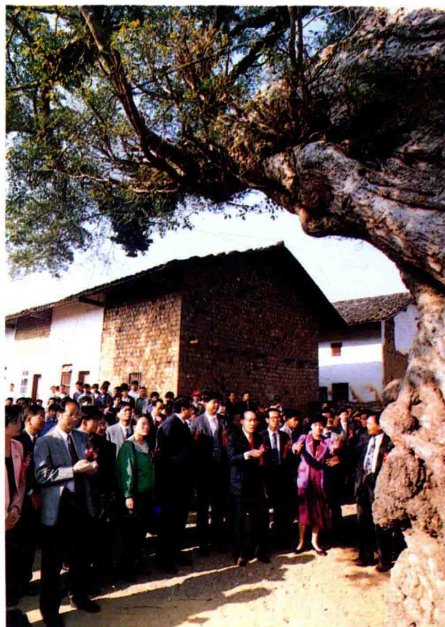
千年古榕枝繁葉茂，給人們留下美好的紀念和憧憬。 The thousand-year-old banyan with its luxur- iant branches and leaves helps the visitors to gain good memory and will.