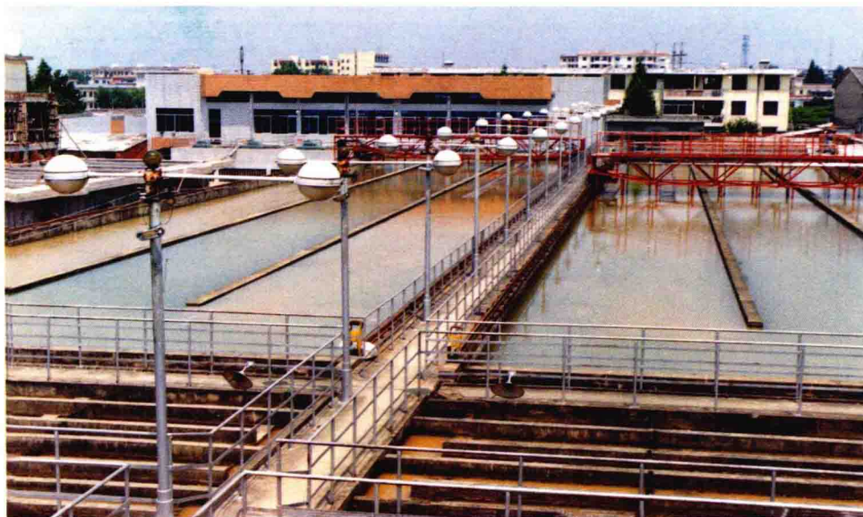
净水池 A water purification pool.

Lu'an Waterworks now has brand new irrigation equipment. The amount invested in this venture totals RMB 45,290,000. The daily water supply capacity is 140,000 tons. And it has reached the same technological level of that of the national waterworks of the mid 1990's.