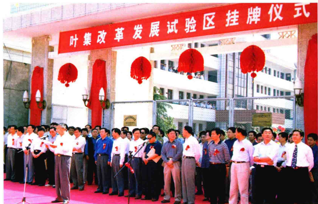
叶集改革发展试验区挂牌 Yeji Reform and Development Experimental Zone at its formal founding ceremony.