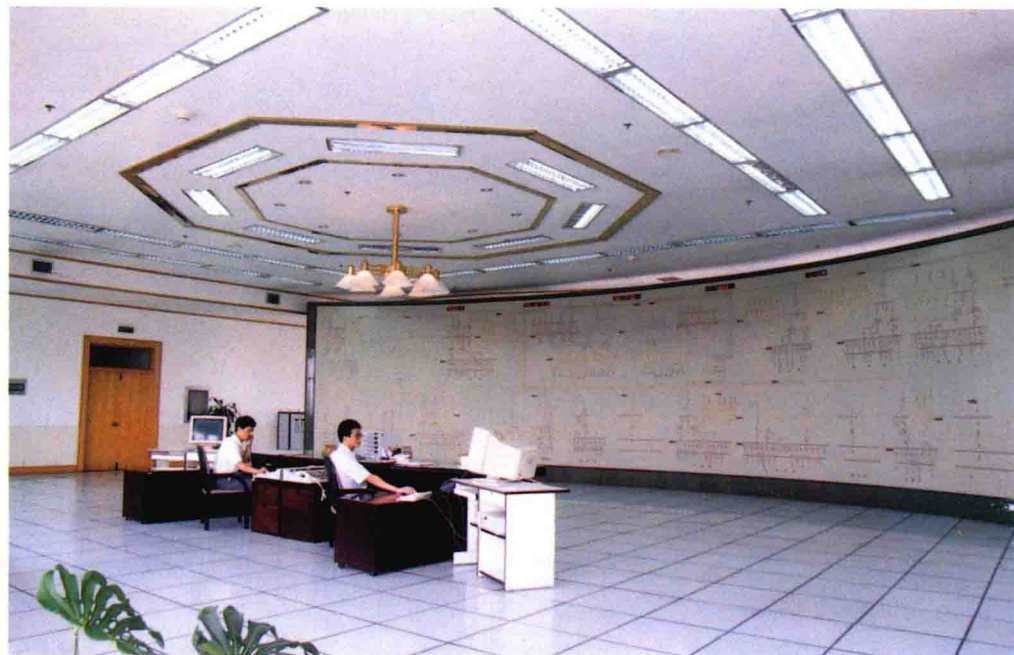
地区供电局总调度室 The general Control Room of the Prefectural Electricity Supply Bureau