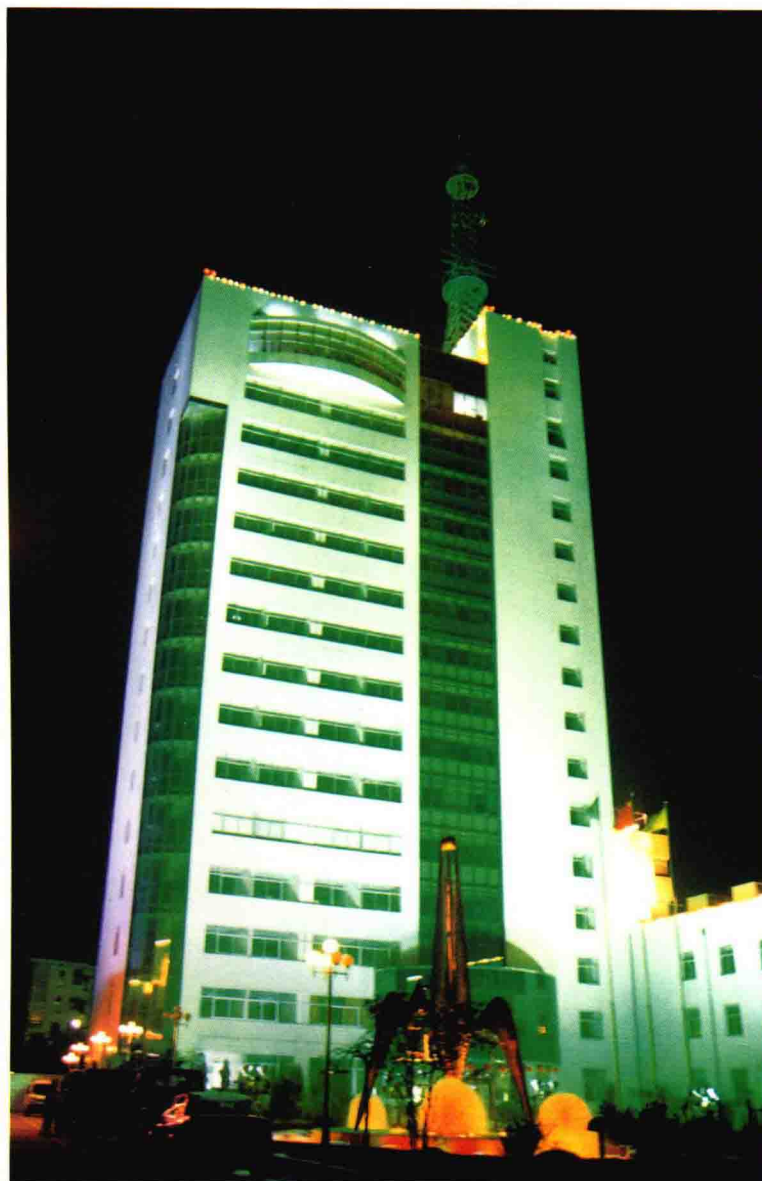
地区供电局大楼 The Prefectural Electricity Supply Bureau .

全区水能开发已装机17.4万千瓦。佛子岭等大型水电站总装机12.7万千瓦；小型水电站装机4.6万千瓦，全区已实现村村通电。