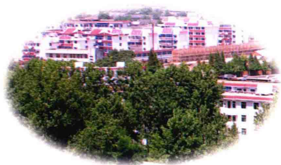
六安市淠苑小区 Piyuan Block, Lu'an City.