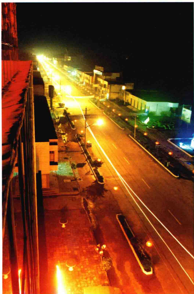
叶集之夜 Yeji by night

In January 1999 Yeji Town, the provincial-level and state-level reformed experimental town, became the only reformed and developed experimental zone in the whole province that was able to exercise county-level comprehensive power.