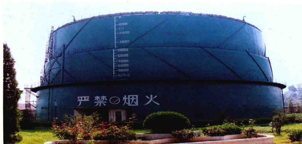
六安市煤气公司二万立方米煤气柜 A 20,000m 3 gas tank of Lu'an Gas Company.