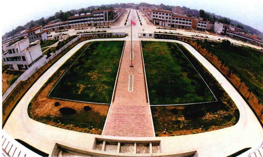
全国小城镇建设示范镇霍邱姚李镇 Yaoli Town, an example of a national small-town construction, Huoqiu City.