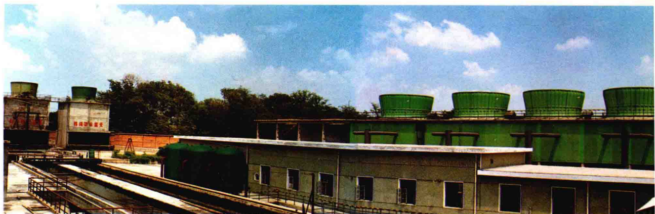
污染治理 Pollution management.

The favourable biological environment has effectively promoted a quick transformation from environmental theories into real action.