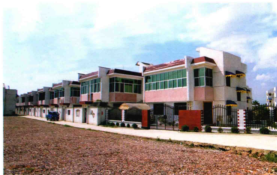
六安市振华新村 Zhenhua New Village, Lu'an City.