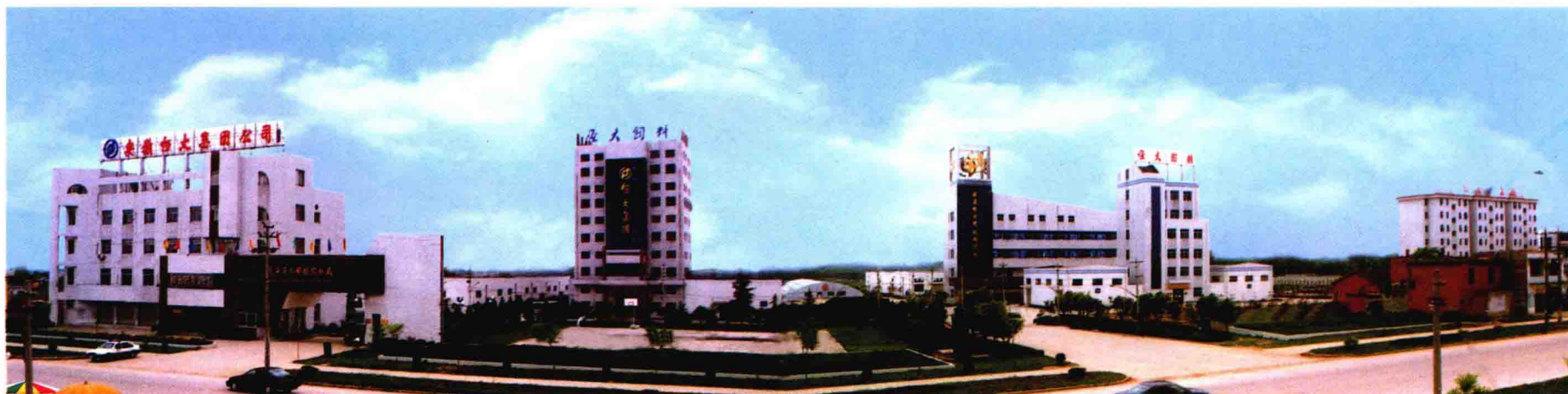
位于开发区的全国科技示范企业恒大集团 The national science and technology example enterprise, Hengda Group.

Ratified by Anhui Provincial Government, the Lu'an Economic and Technological Development Zone, has attracted more than 40 domestic and foreign enterprises, including Hengda Group, to come and invest in the zone. The total amount invested amounts approximately to RMB 310 million. Currently, 2 km 2 has been developed. It has become the new growth point in the economic development of Lu'an Prefecture.