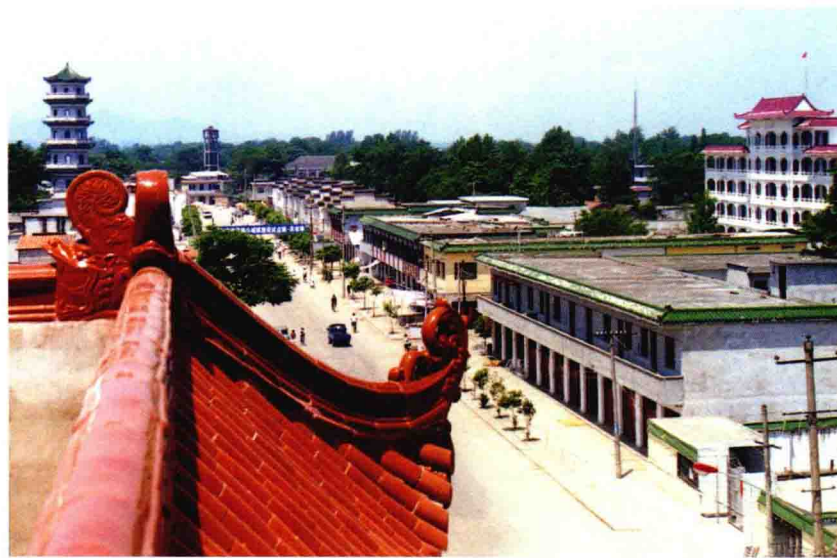
全国小城镇建设示范镇六安市苏埠镇 Subu Town, an example of a national small-town construction, Lu'an city.