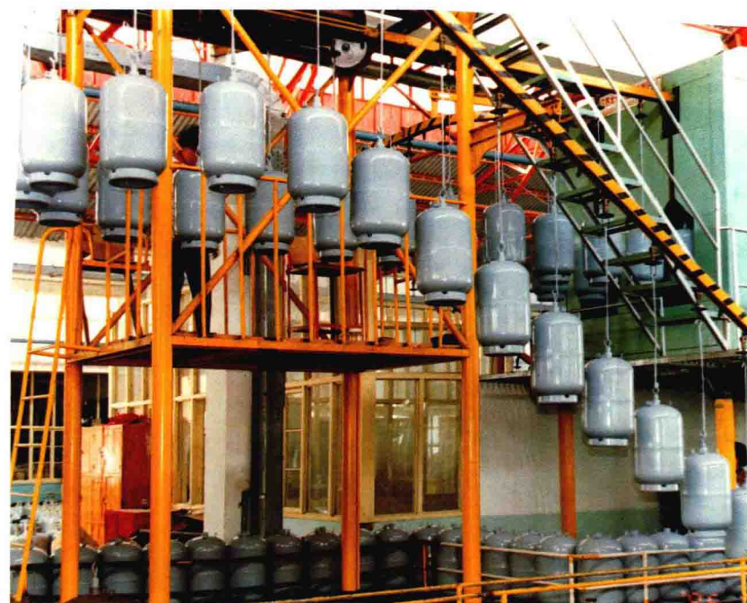
六安市国桢燃气公司的供气站 A gas supply station of Lu'an Guozhen Gas Company.