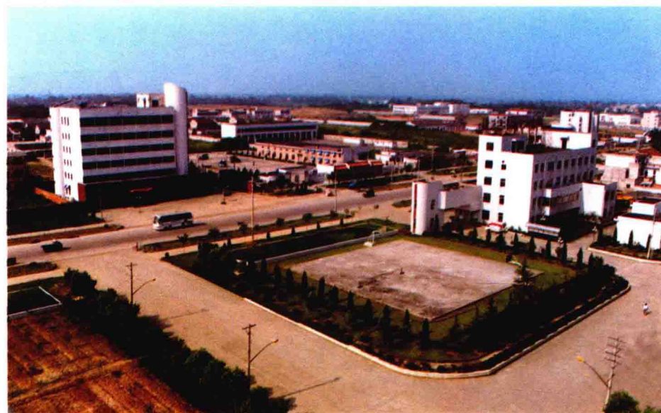
开发区一角 A corner of the zone