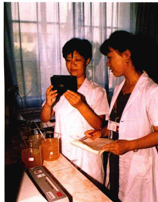
水质化验 Checking water quality.