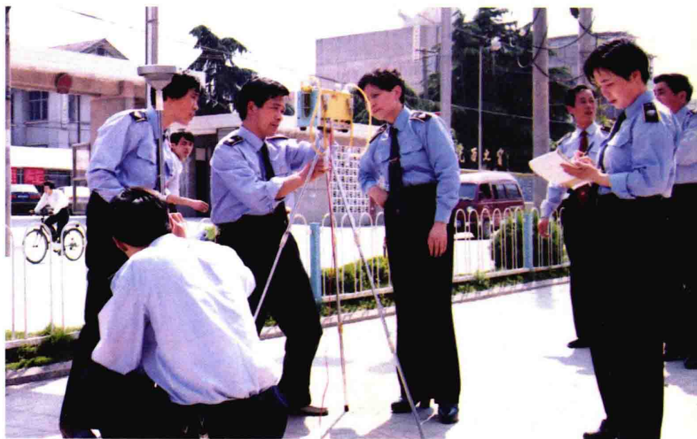
环境监测 Environment monitoring.