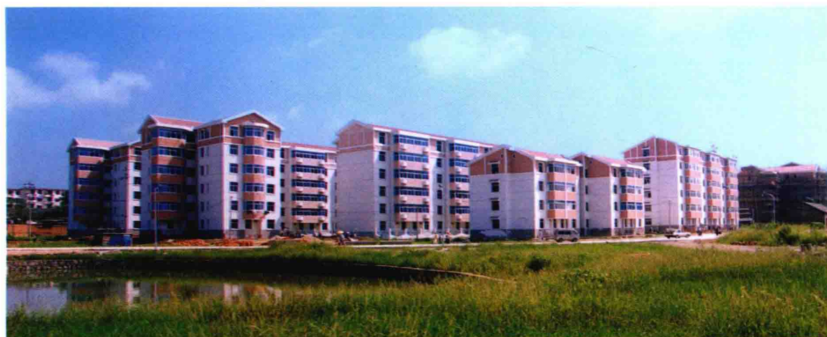
六安市东苑小区 Dongyuan Block, Lu'an City.