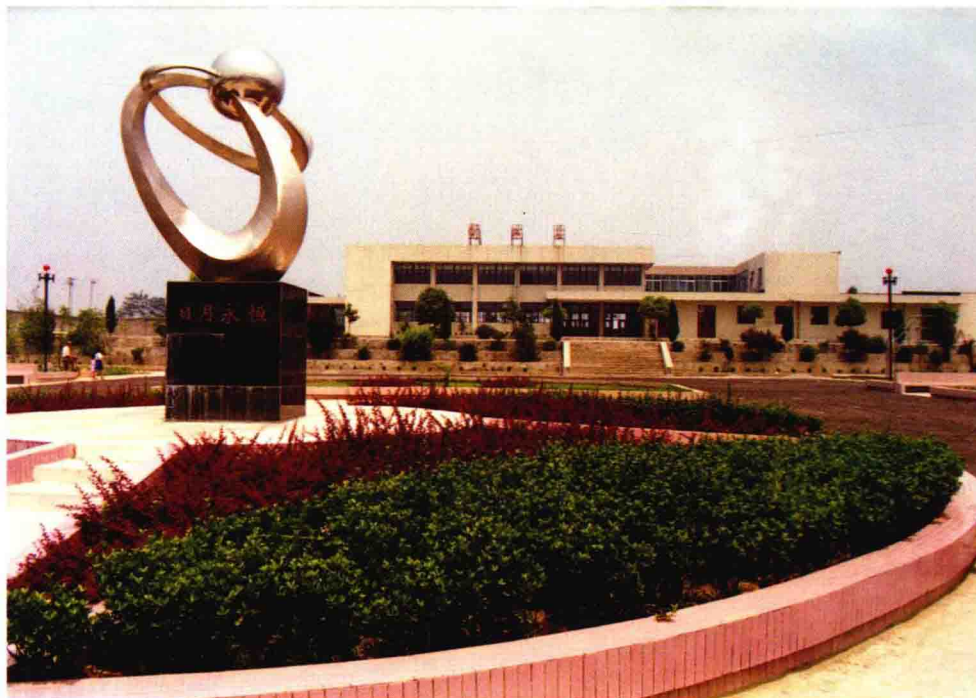
全省小城镇建设示范镇舒城杭埠镇广场 Hangbu Town Square, an example of a national small-town .