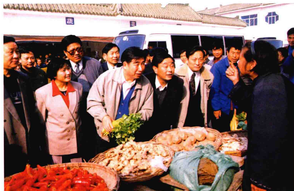
省委书记回良玉、六安地委书记朱成林、六安行署专员洪文虎视察叶集市场 The Secretary of Anhui Party Committee, Hui Liangyu, Lu'an Prefectural Party Secretary Zhu Chenglin and Head of Lu'an Prefectural Government Hong Wenhu inspecting the market in Yiji.