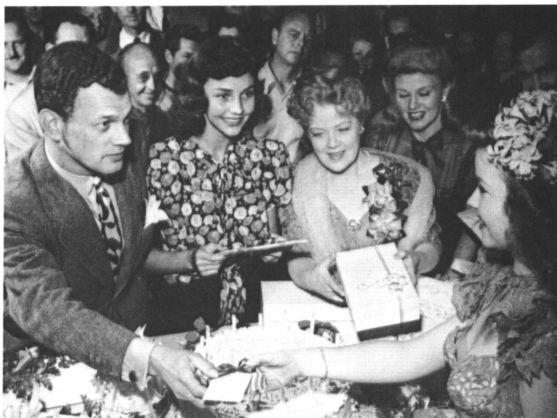
My sixteenth birthday on the set of I'll Be Seeing You : Joseph Cotten, Jennifer Jones, Spring Byington, Ginger Rogers, 1944 ( Selznick International Films )