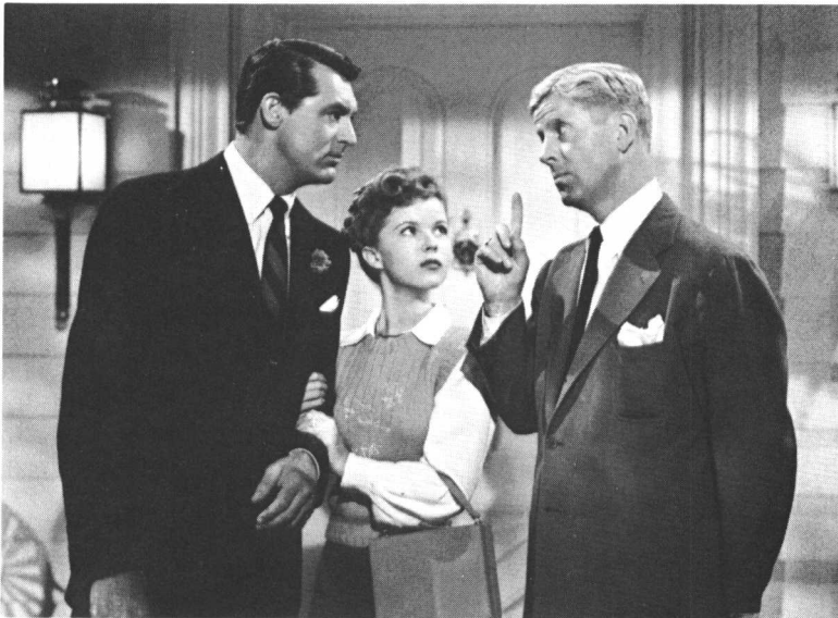
Cary Grant and Rudy Vallee during The Bachelor and The Bobbysoxer , 1947 ( RKO Radio Studios )