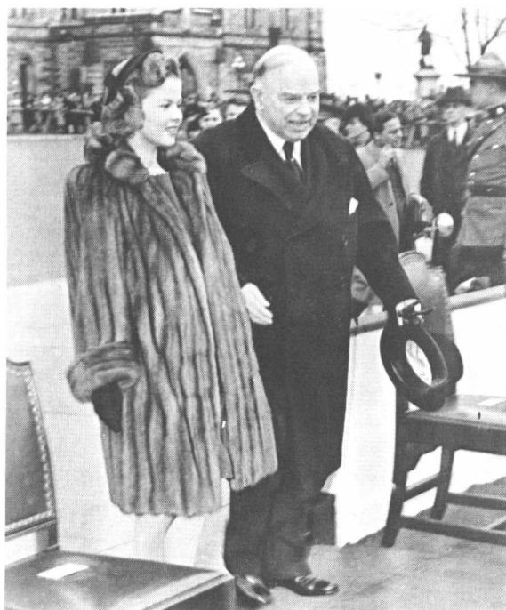
Clairvoyant Prime Minister Mackenzie King of Canada, Ottawa, 1944