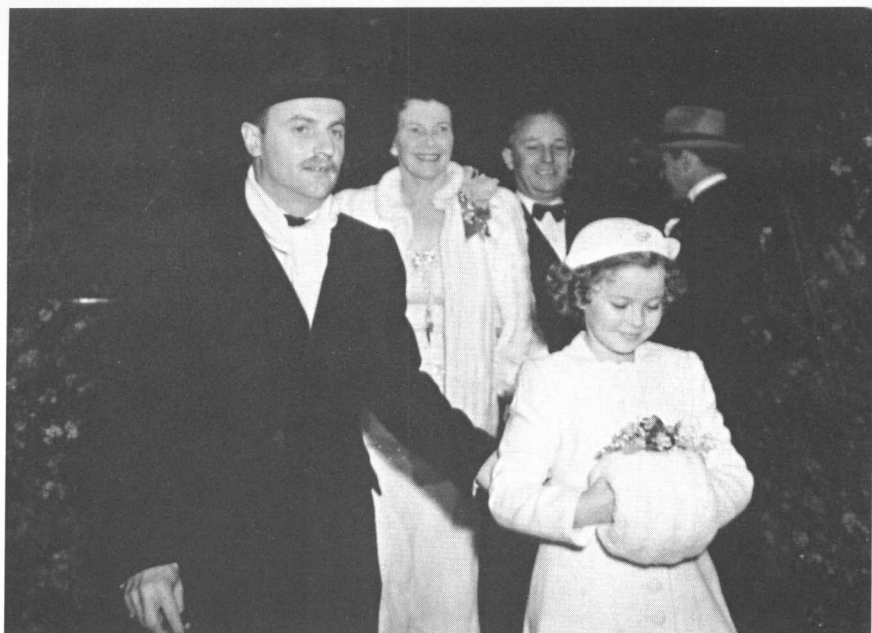
The Little Princess première: My parents and I with Darryl Zanuck, 1938