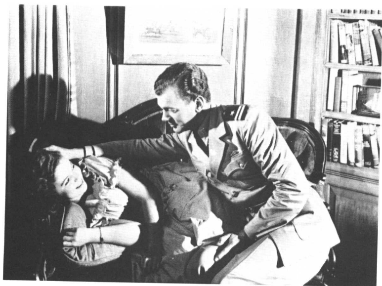
Wishful romance, with Lieutenant Joseph Cotten in Since You Went Away , 1944 ( Selznick International Films )