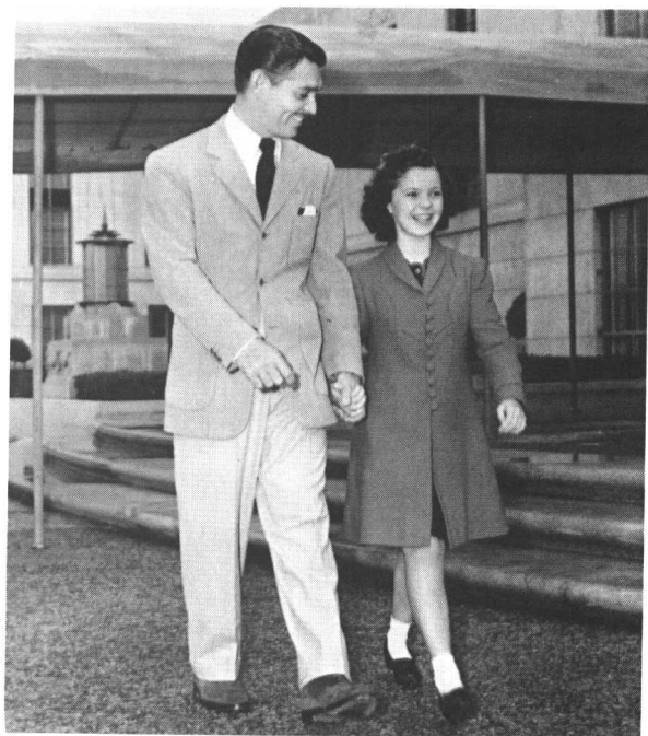
Clark Gable on MGM lot during Kathleen, 1941