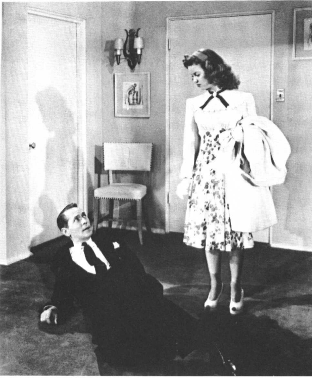
Martial arts with Franchot Tone, Honeymoon , 1946 ( RKO Radio Studios )