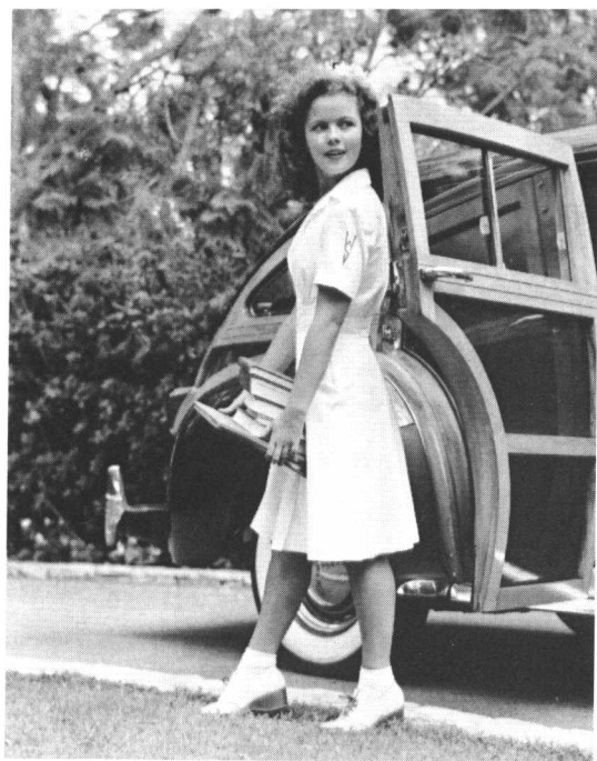
Old-time student, Westlake School, 1944