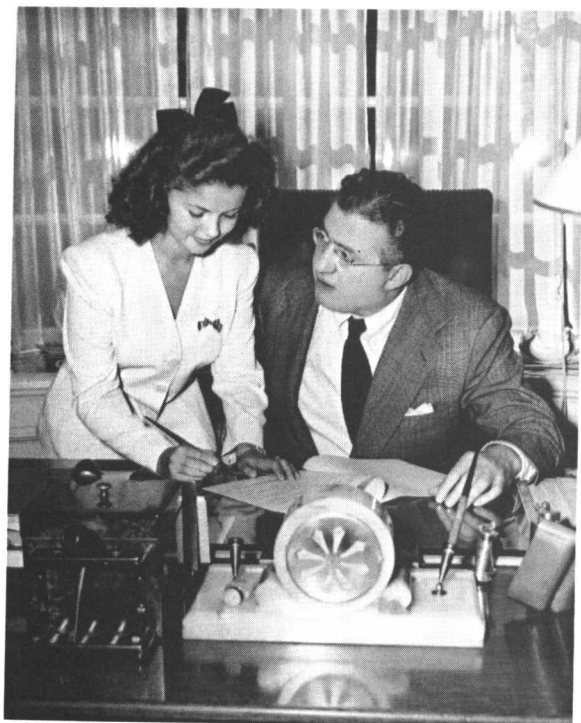
Signed with David O. Selznick, 1943 ( Selznick International Films )