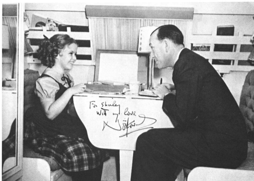
Teaching Noel Coward fractions in soundstage trailer, 1938