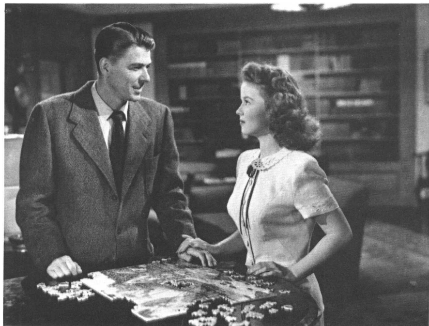
Serious talk with Ronald Reagan, father-lover figure in That Hagen Girl, 1948