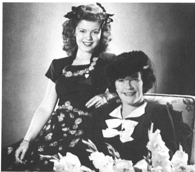
With Mother, 1944