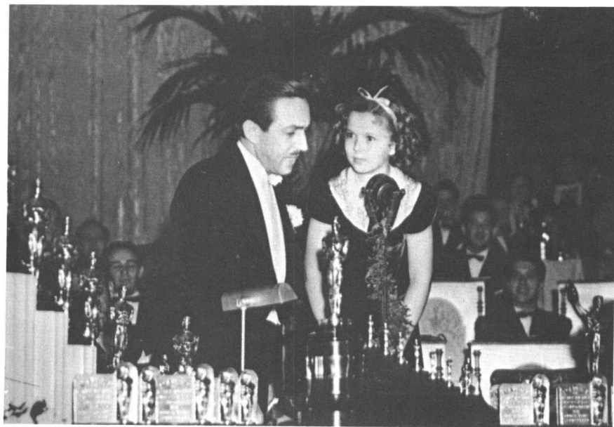
Oscar awards to Disney, seven dwarfs, but no Snow White, 1939