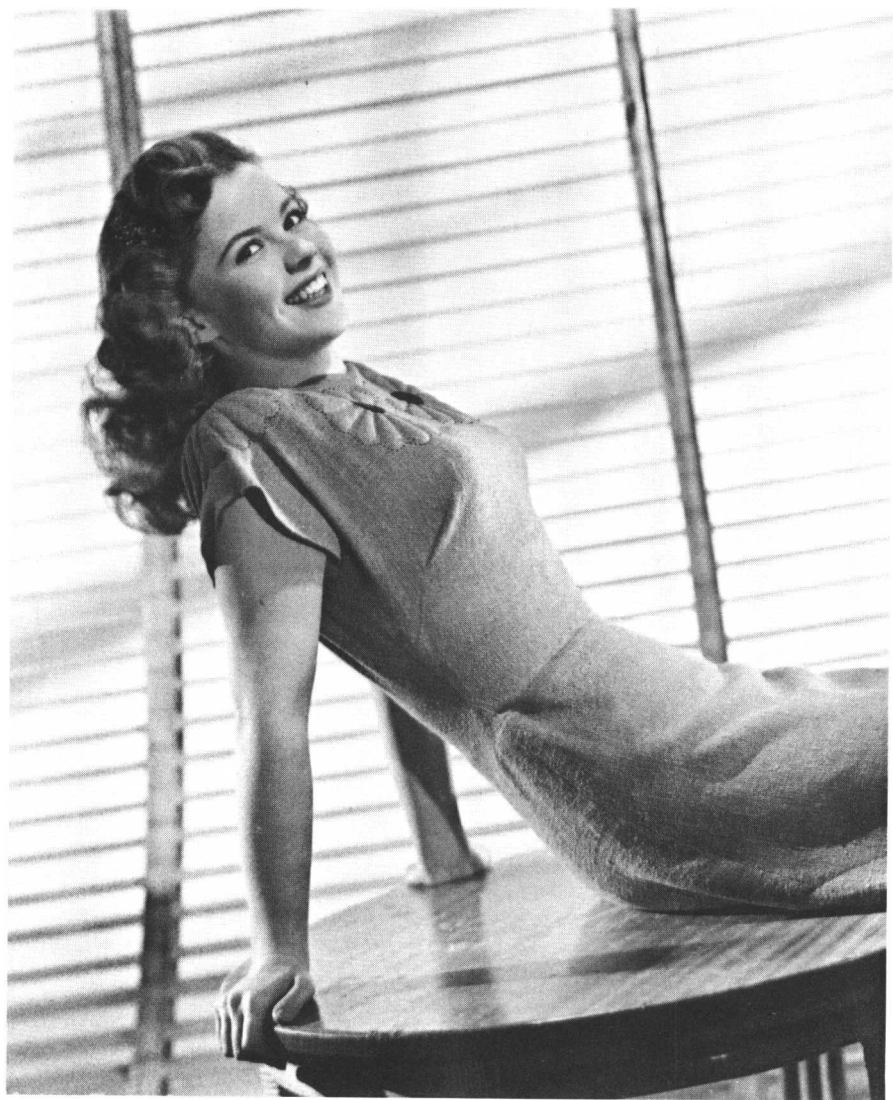
Newly engaged to be married, 1945