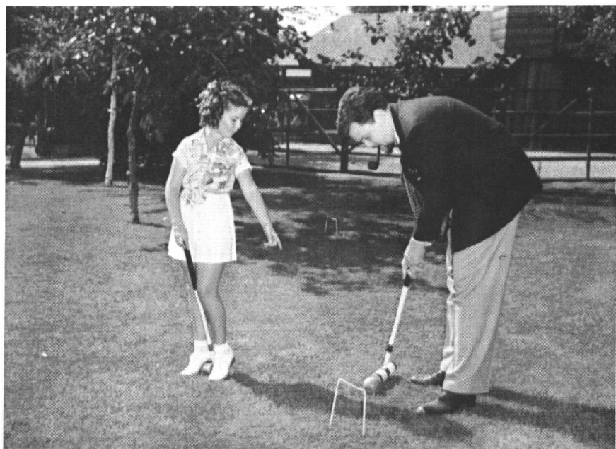
Croquet challenge match with Orson Welles, 1939