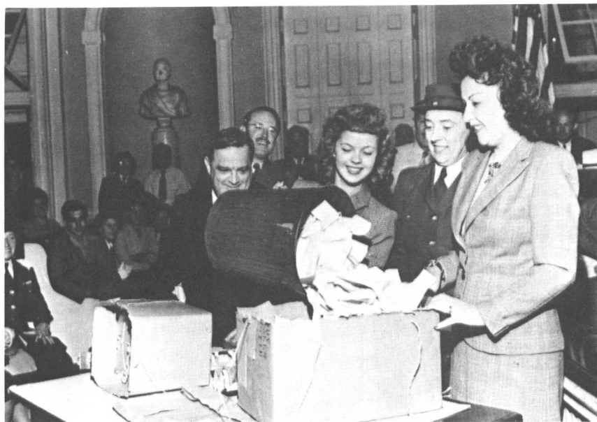
Wastepaper collection with Mayor Fiorello La Guardia ( left ) and Ethel Merman ( right ), 1944