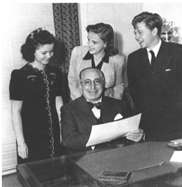
MGM adolescents: Judy Garland and Mickey Rooney, with Louis B. Mayer, 1941