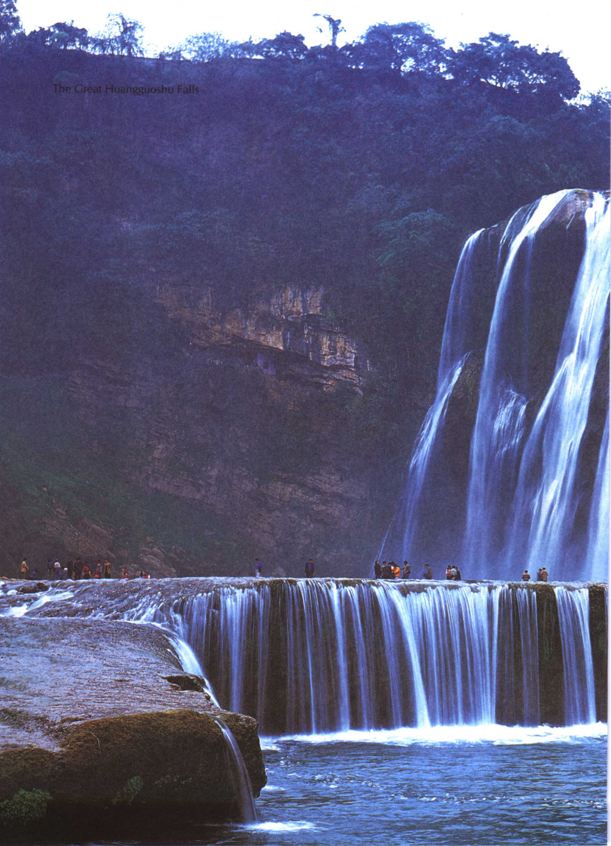
The Great Huangguoshu Falls