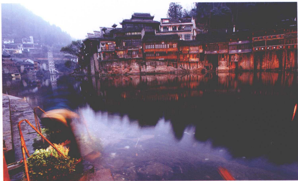
Scenic beauty in Miao village