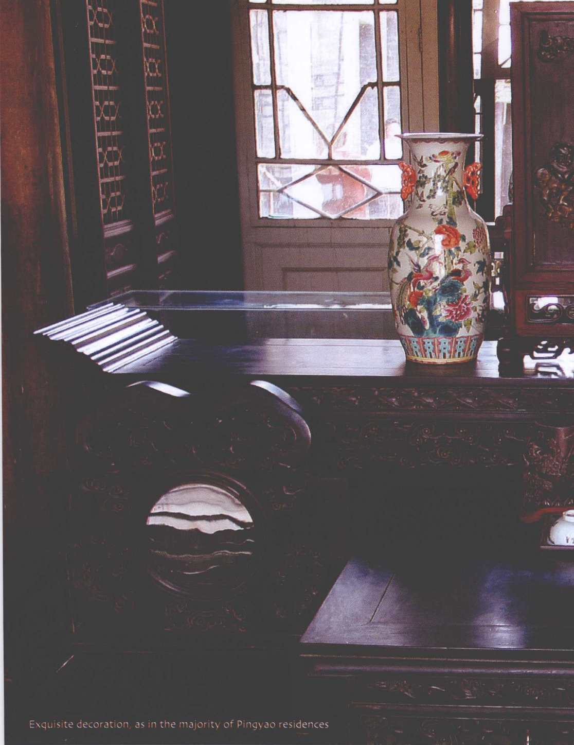
Exquisite decoration, as in the majority of Pingyao residences