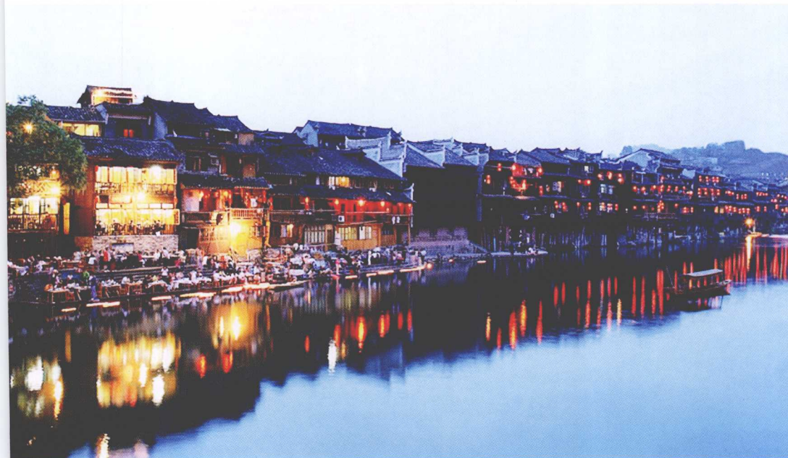
Evening scene, Fenghuang

The local cuisine is similar to that of adjacent eastern Sichuan Province, namely vinegary, salty and hot spiced. This is particularly true of dishes using aquatic products, preserved ham, chicken and duck. The stewed items are served in a thick, slightly sour-tasting, broth. For stir-fried dishes the meat is often boiled briefly before being sautéed. Visitors who are