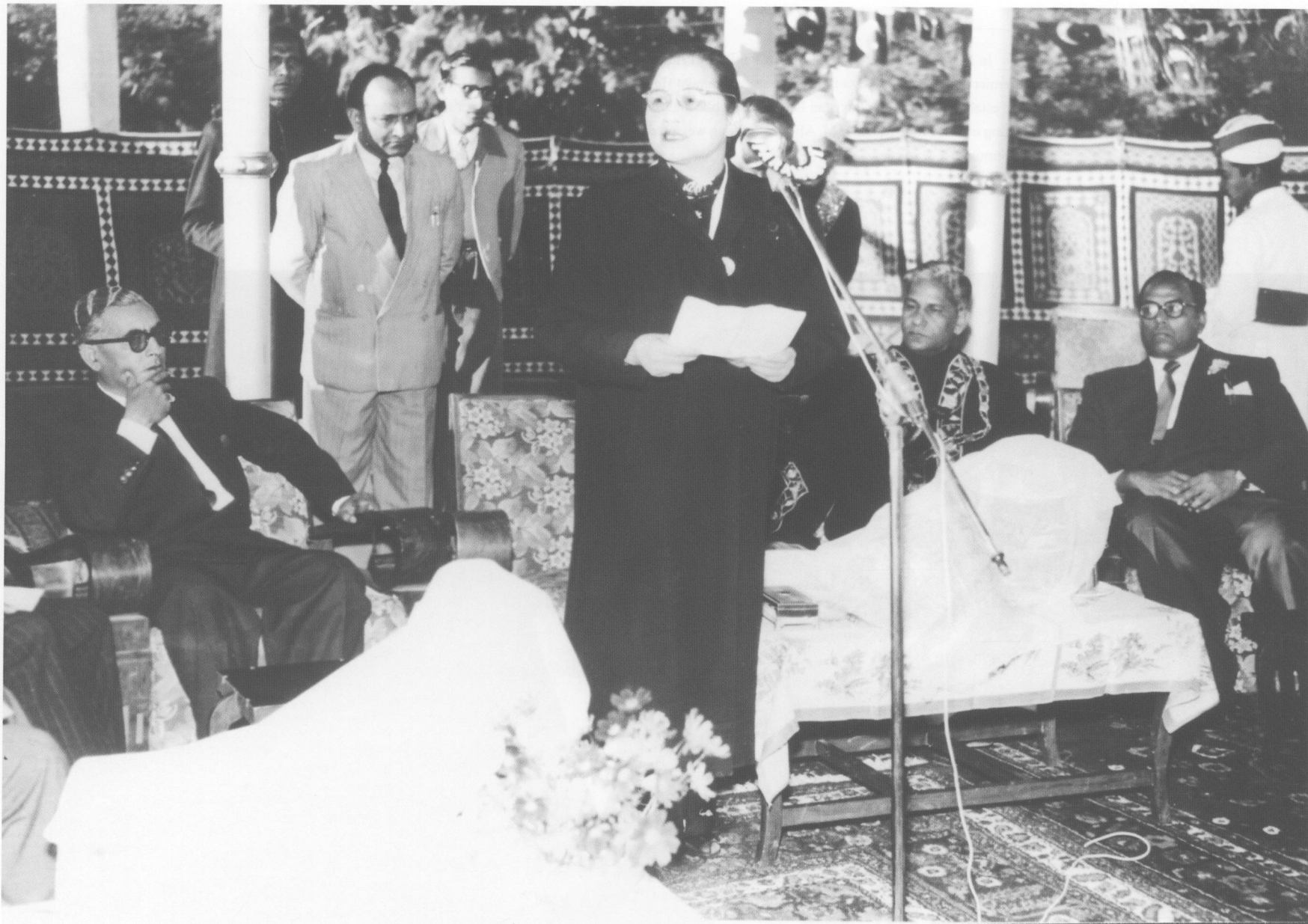
From Jan. 24 to Feb. 1 in 1956, Soong Qing Ling, vice-chairperson of Chinese NPC Standing Committee, paid a friendly visit to Pakistan at the invitation. During her visit, Karachi Municipal Council held a grand gathering to welcome Soong Qing Ling. Soong is delivering a speech at the gathering.