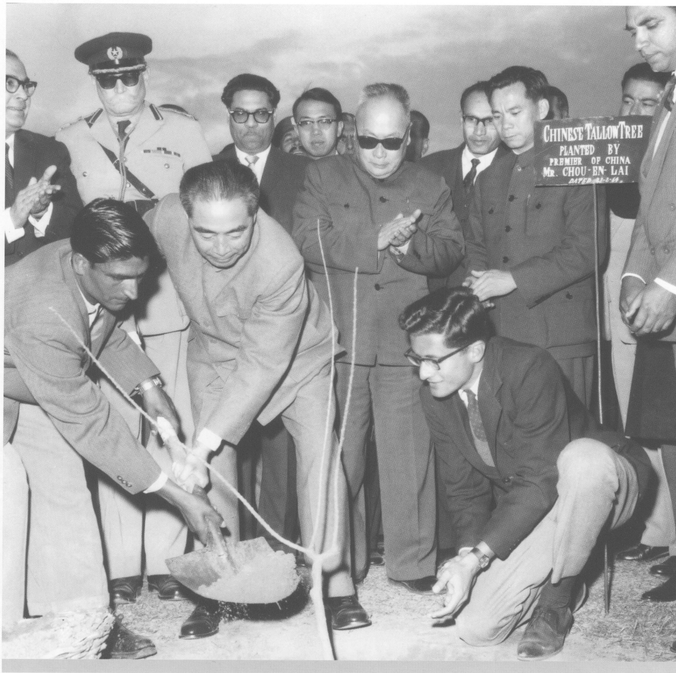
From Feb. 18 to 26 in 1964, Premier Zhou Enlai visited Pakistan for the second time. On Feb. 21, Premier Zhou planted a seedling of Chinese tallow tree on the Shakarparian Hills in Islamabad as a souvenir for his visit in Pakistan.