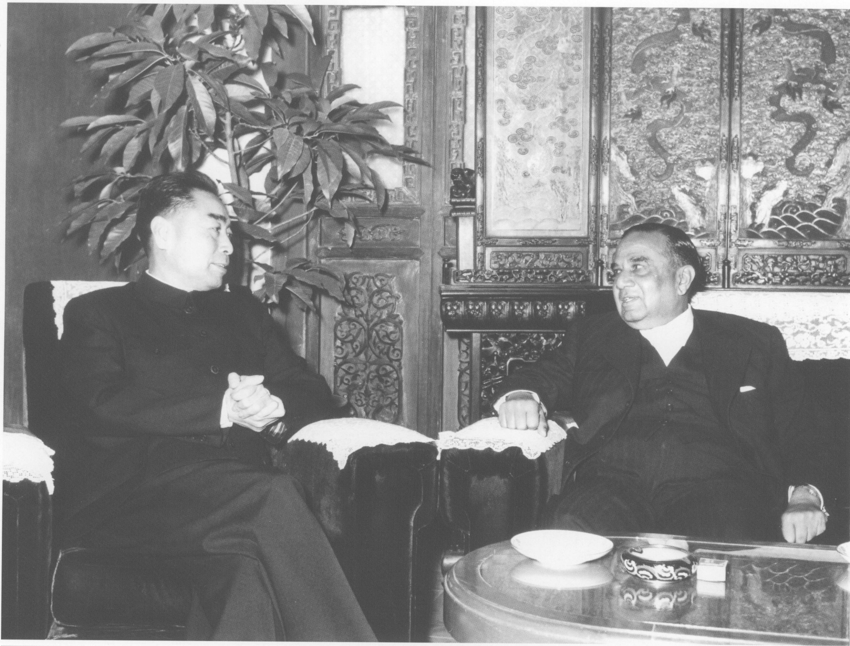
On Oct. 19, 1956, Chinese Premier Zhou Enlai held talks with Pakistani Premier Hossain Shahid Sulawadi.