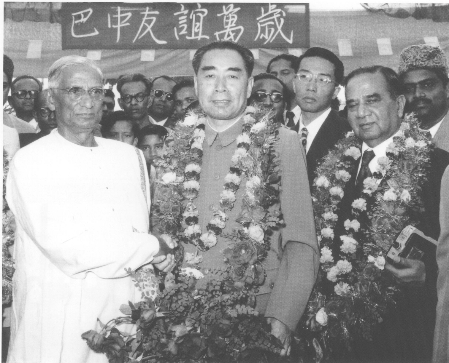
From Dec. 20 to 30 in 1956, Chinese Premier Zhou Enlai paid his first visit to Pakistan. He was warmly welcomed by the Pakistani Government and people.