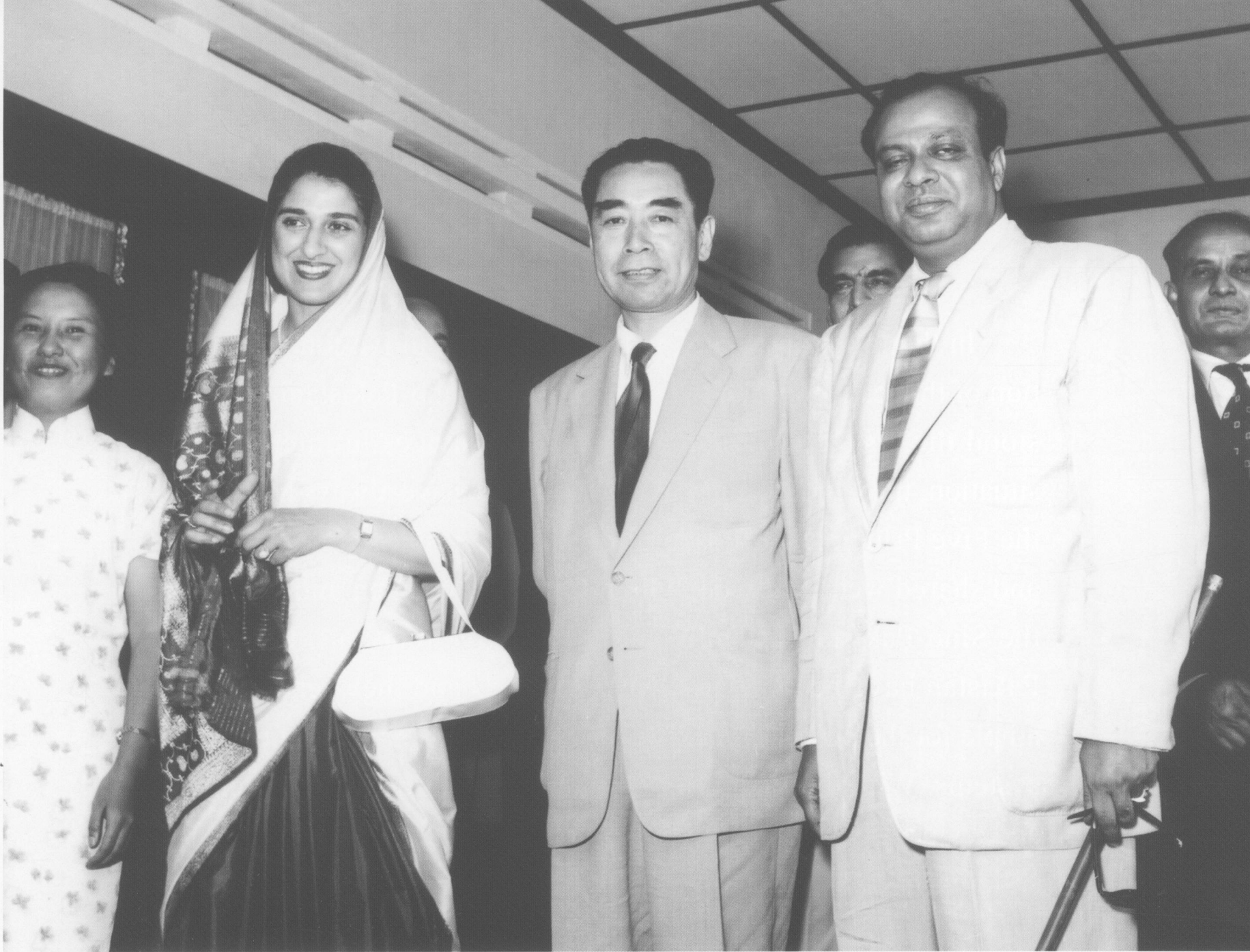
During the Bandung Conference in April 1955, Chinese Premier Zhou Enlai met with Pakistani Prime Minister M. Ali.