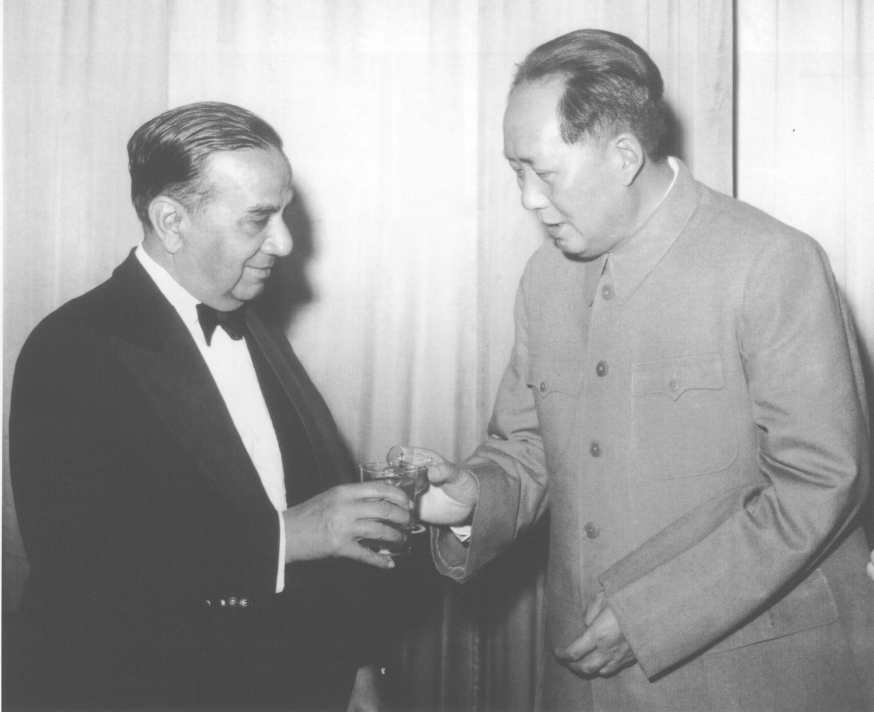
On Oct. 22, 1956, Chairman Mao Zedong met with and gave a banquet to Pakistani Prime Minister Sulawadi.