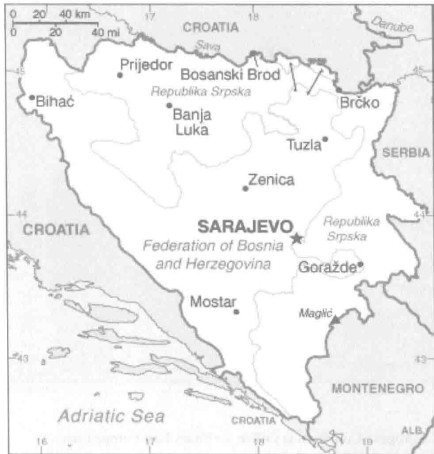
Bosnia and Herzegovina