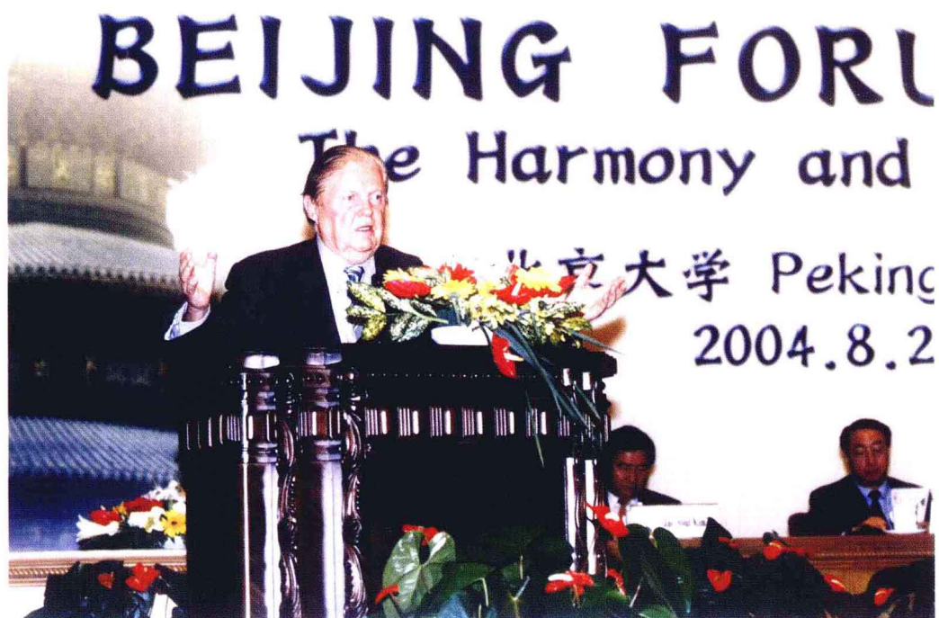
1999 Nobel Prize Laureate Professor Robert A. Mundell at the Opening Ceremony of Beijing Forum (2004)