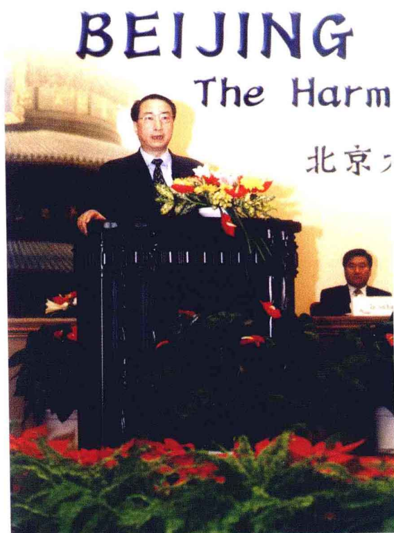
Chinese Vice-Minister of Education Zhang Xinsheng at the Opening Ceremony of Beijing Forum (2004)