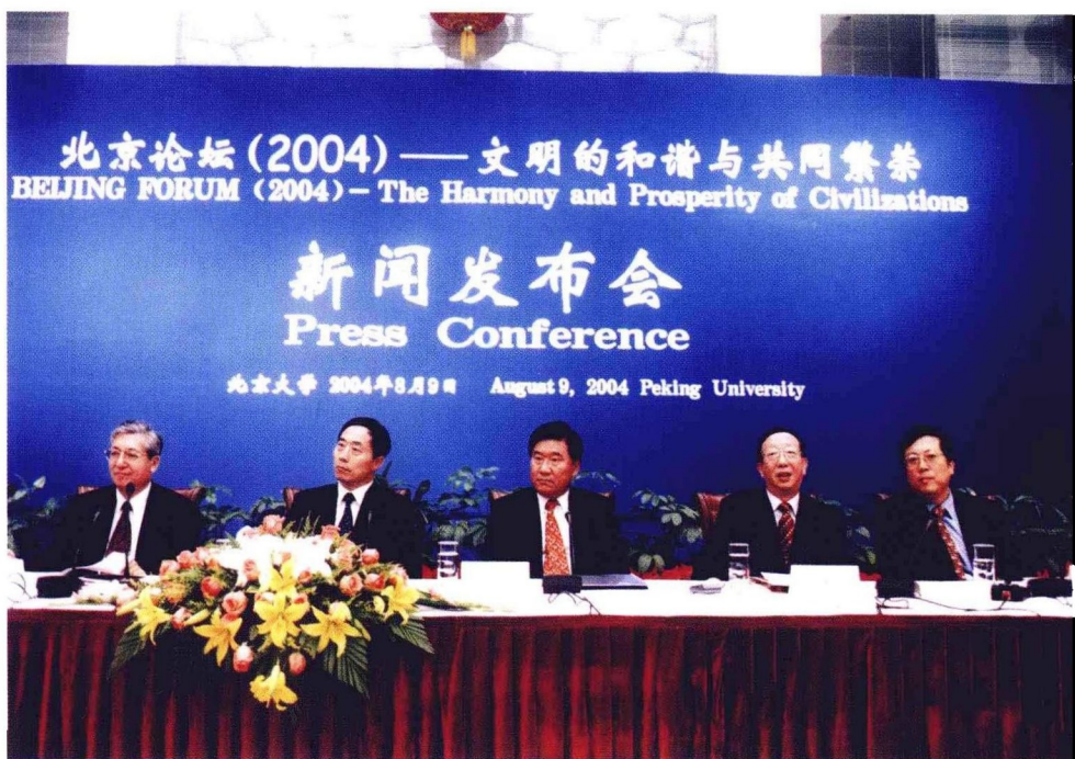
The Press Conference of Beijing Forum(2004)