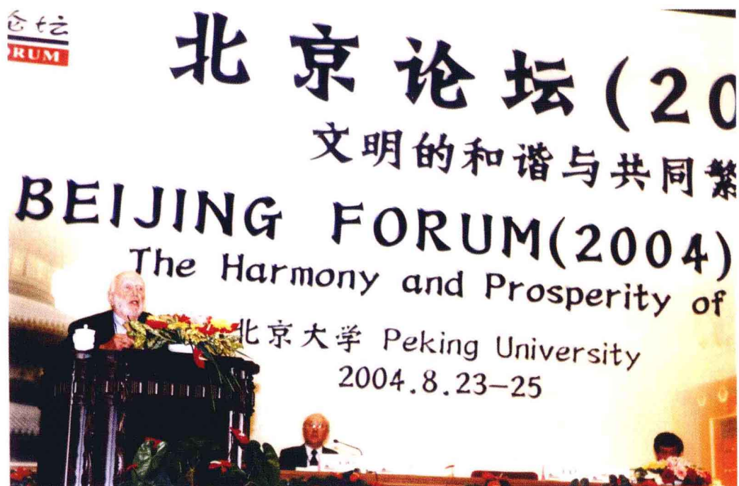
1993 Nobel Prize Laureate Professor Douglass C. North at the Opening Ceremony of Beijing Forum (2004)