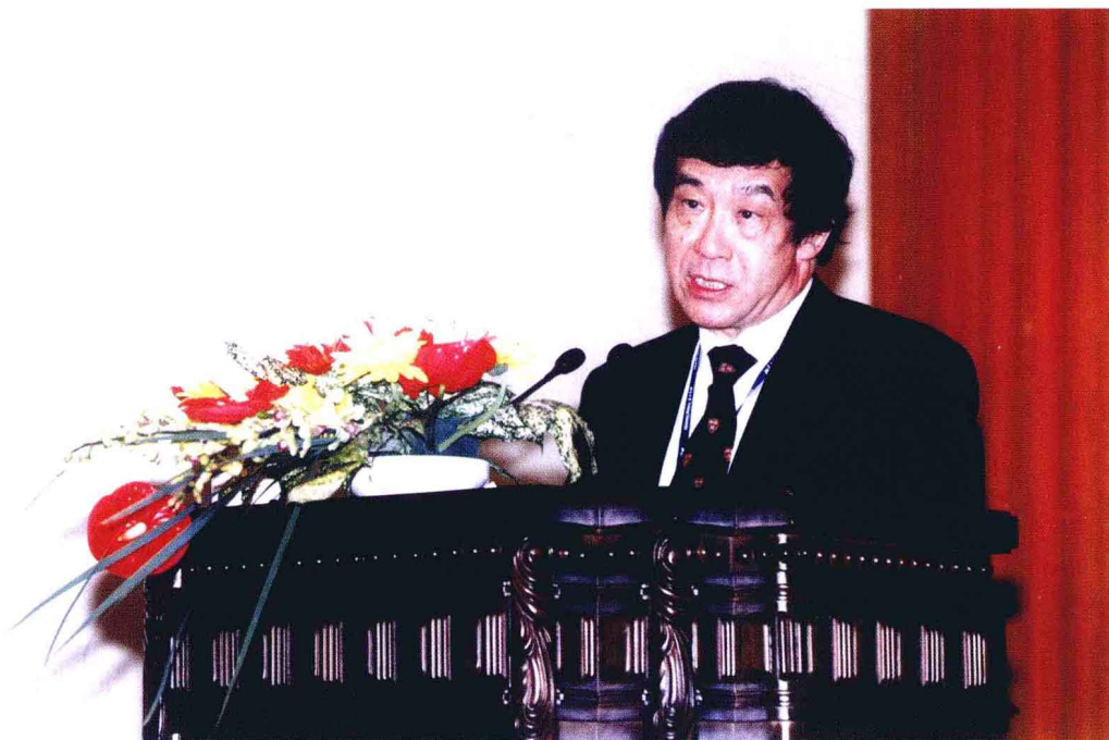
Director of The Harvard-Yenching Institute Tu Weiming at the Opening Ceremony of Beijing Forum (2004)