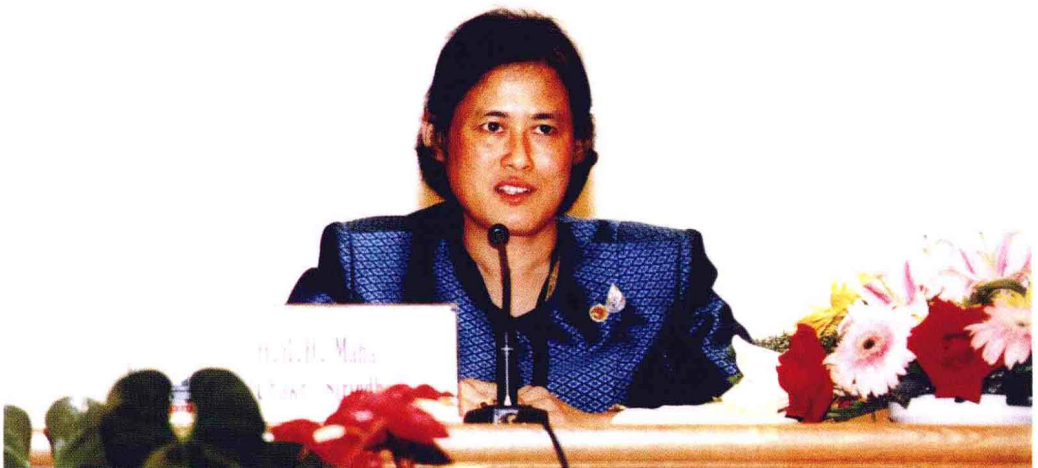
Princess of Thailand H.R.H. Maha Chakri Sirindhorn at the Opening Ceremony of Beijing Forum (2004)