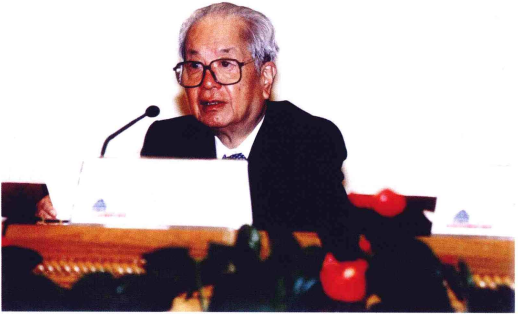
Former Vice-Premier of the PRC State Council Dr. Qian Qichen at the Opening Ceremony of Beijing Forum (2004)