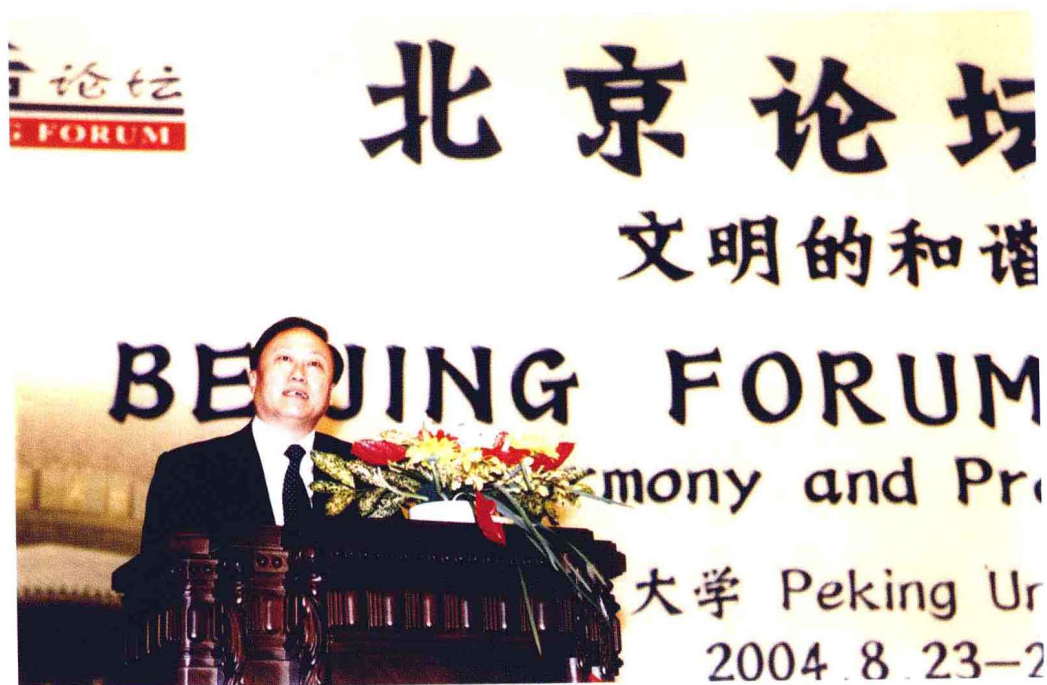
Vice-Mayor of Beijing Municipal Government Zhu Shanlu at the Opening Ceremony of Beijing Forum (2004)