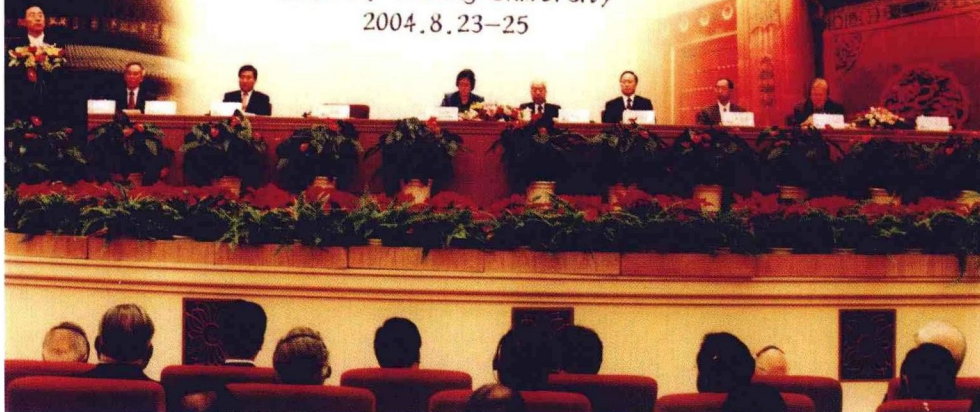
The Opening Ceremony of Beijing Forum(2004)