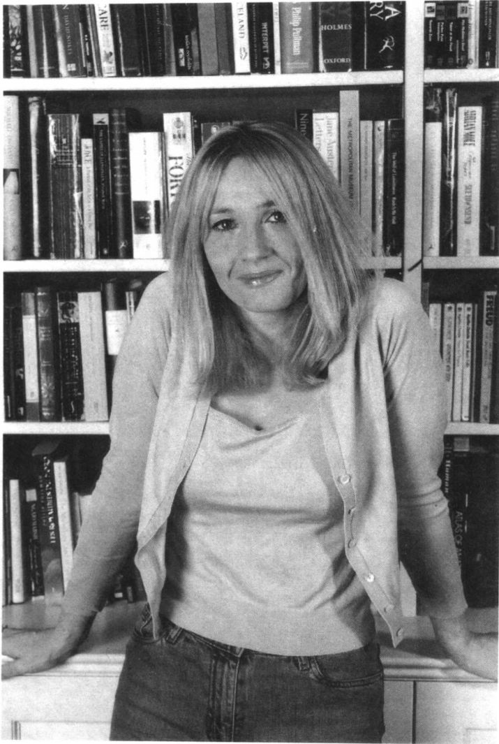
Joanne Kathleen (J.K.) Rowling's books have captivated children and adults all over the world.