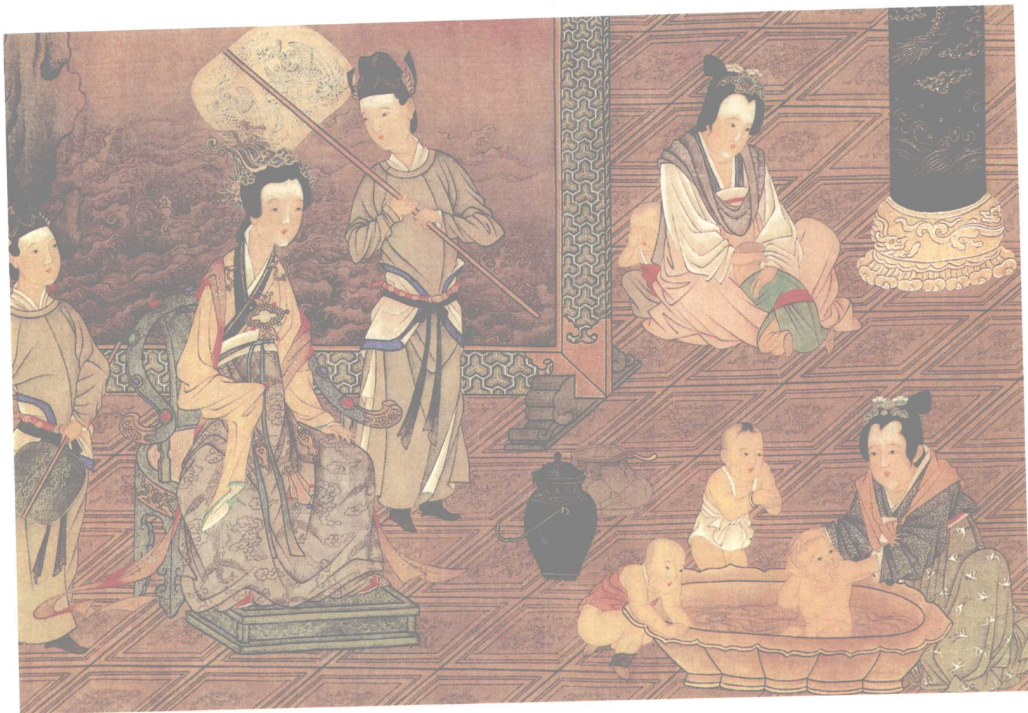
Feet of Chinese Unicorn (Partial) (attributed to) Zhou Fang Tang Dynasty (618–907) Color on silk 36.7 × 328cm

This section of the long scroll portrays a noble lady on an arm-chair watching attentively her children being bathed by a maidservant.