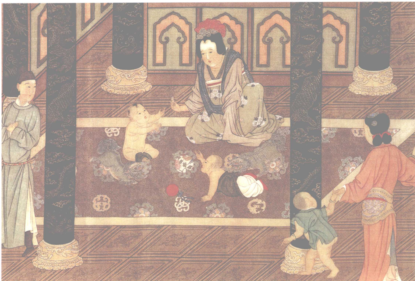
Feet of Chinese Unicorn (Partial) (attributed to) Zhou Fang Tang Dynasty (618–907) Color on silk 36.7 × 328cm

This section of the long scroll portrays a noble lady playing with her two children on a rug, while a third one led by a maidservant is eager to join them.