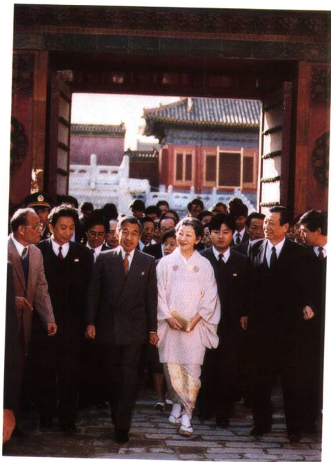
Lower: Emperor Akihito and Empress Michiko of Japan toured the Palace Museum in Beijing during their visit to China in October 1992.