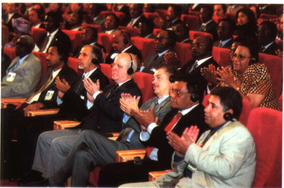
Middle: The Forum on China-Africa Cooperation - Ministerial Conference 2000 was held in Beijing in October 2000.