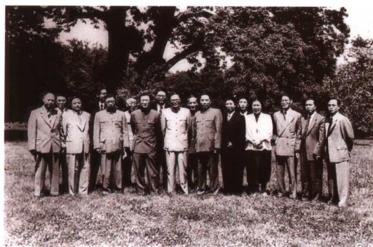
Upper: Deng Xiaoping's inspection tour of southern China including Guangzhou, Zhuhai, Shenzhen, Wuhan between Jan. and Feb. 1992, during which he made a series of remarks, popularly known as "south China tour remarks". China's reform and opening-up endeavor has since sped up.