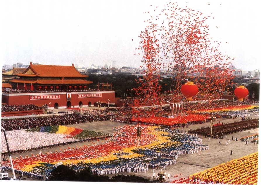
Upper: The founding of the People's Republic of China on 1 October 1949. Picture: Chairman Mao Zedong reading out a government proclamation on the Founding Ceremony