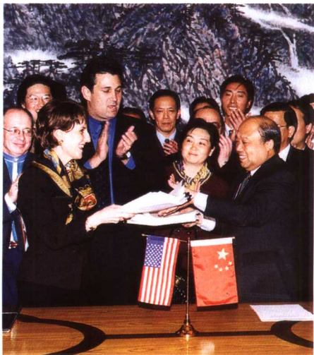
Lower: China and the United States signed the Bilateral Agreement between China and the United States on China's Accession to the WTO on 15 November 1999. Picture: Mr. Shi Guangsheng, Minister of Foreign Trade and Economic Cooperation of the People's Republic of China, and the US Trade Representative Barshefsky exchanging the documents after affixing their signatures on the Agreement