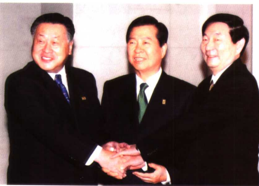
Lower: Premier Zhu Rongji together with Prime Minister Moreyoshiro of Japan and President Kim Dae Jung of the Republic of Korea during the 10+3 meeting held in Singapore in November 2000