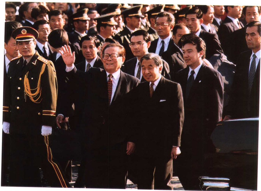
Upper: The welcoming ceremony by Emperor Akihito of Japan for President Jiang Zemin's visit to Japan in November 1998, the first such visit ever made by the Head of State of China.