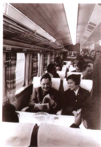
Lower right: Deng Xiaoping on the Shincanshen train during his visit to Japan in October 1978