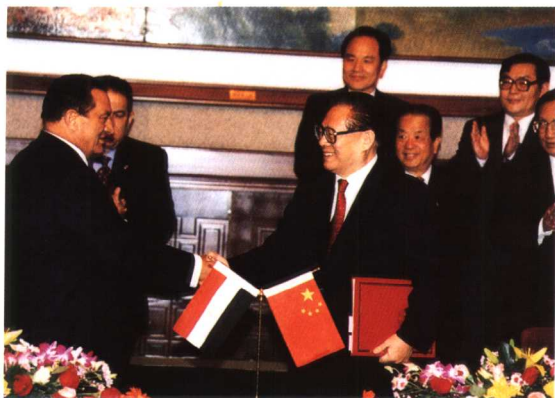
Upper: President Jiang Zemin and President Mohammed Hosni Mubarak of Egypt signed a joint communique on the establishment of a strategic cooperative relationship between China and Egypt in April 1999.