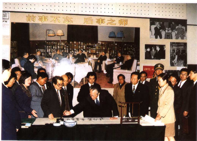
Upper: The signing of the Treaty of Peace and Friendship between China and Japan in Beijing on 12 August 1978