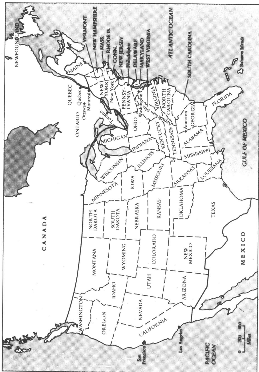
The United States and Canada