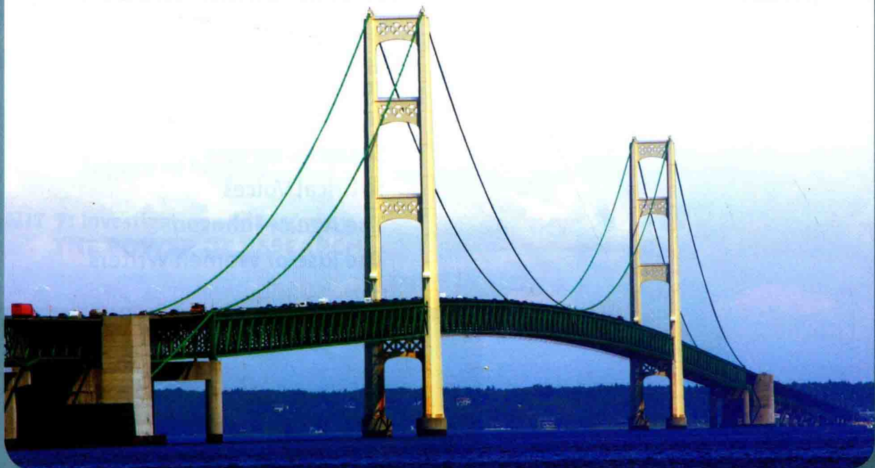
Mackinaw Bridge, Michigan

MICHIGAN HIGH SCHOOL CONTENT EXPECTATIONS FOR ENGLISH LANGUAGE ARTS S1