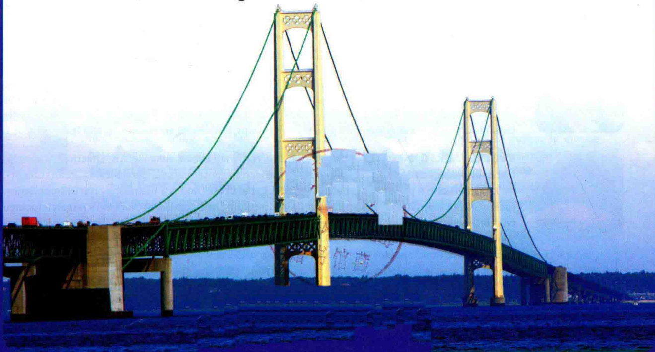
Mackinaw Bridge, Michigan