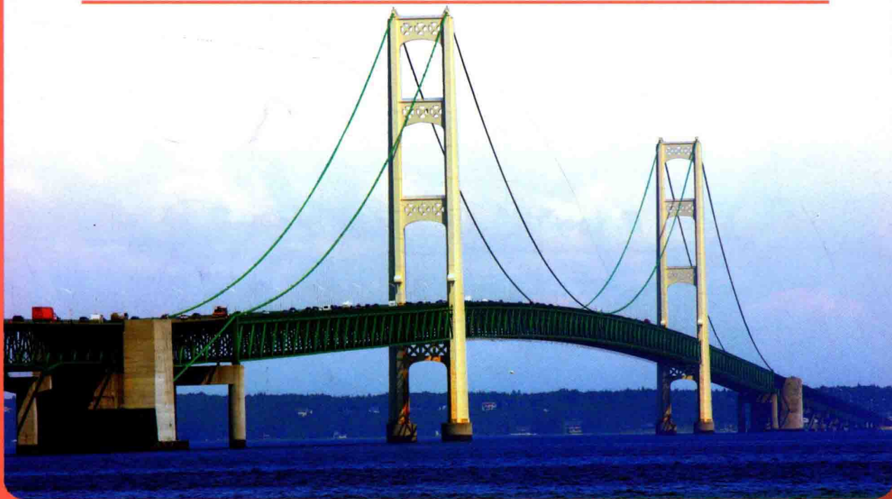
Mackinaw Bridge, Michigan