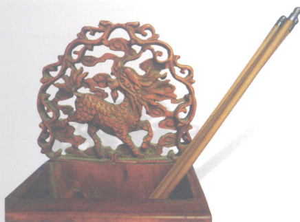
Kylin on a Chopsticks Container

form of artistic expression in the Chinese historical and cultural tradition, auspicious patterns are closely linked to the people's everyday life, customs and cultural background. They are symbols with certain implied meanings developed from some decorative motifs.