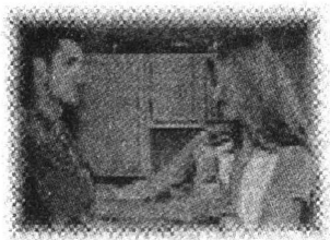
In a family