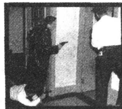
In a bank