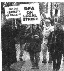
In a workplace