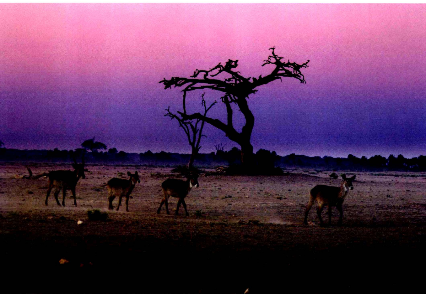
A wildlife reserve in Kenya.