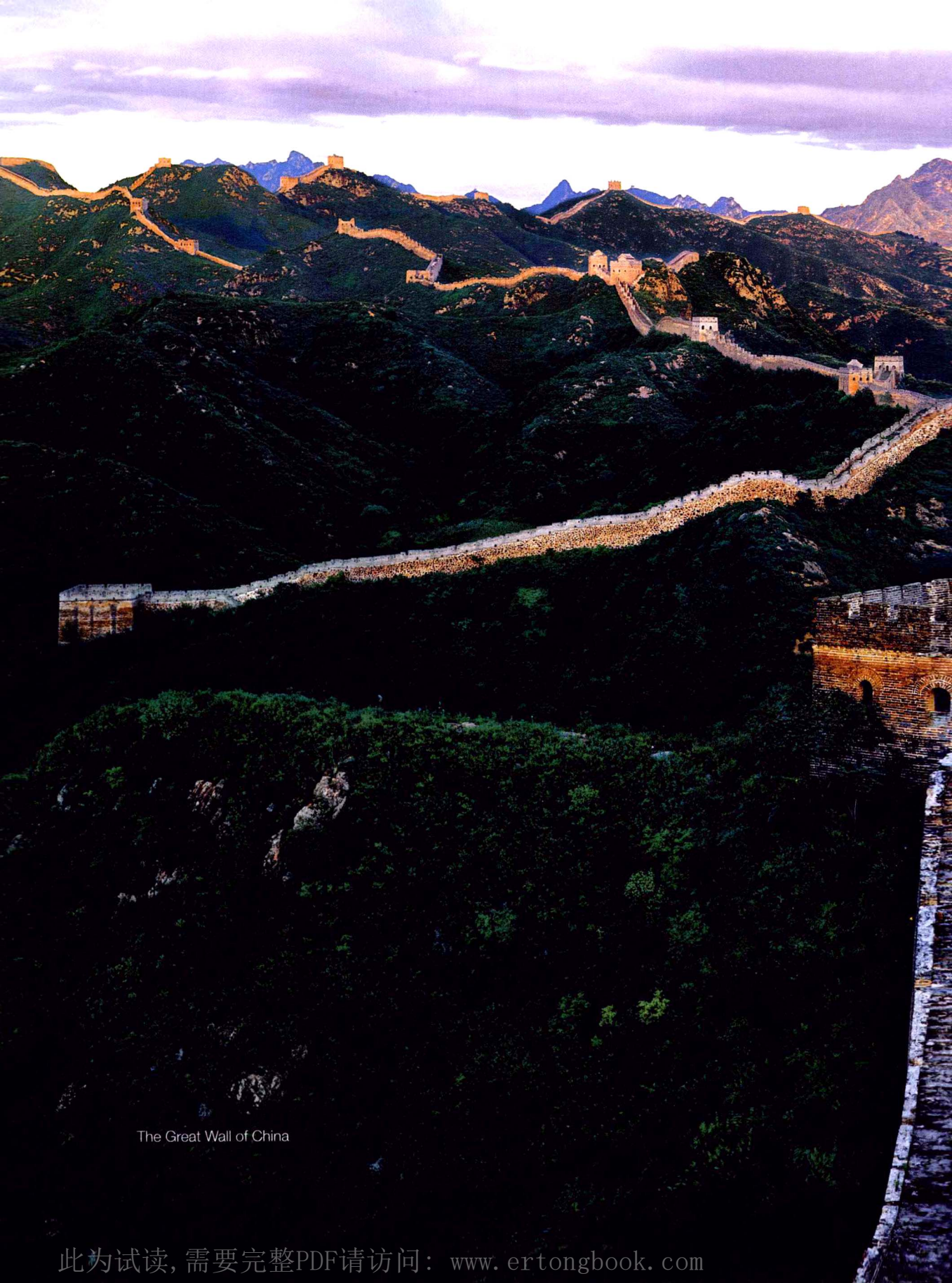
The Great Wall of China