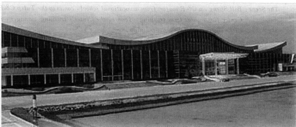
GUILIN INTERNATIONAL C&E CENTER