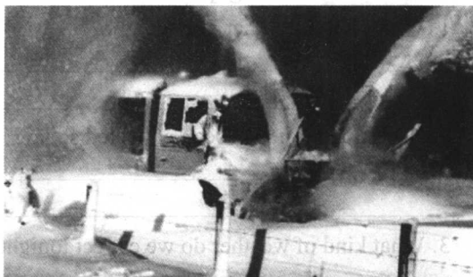
A snow blower in action

B. Listen to the passage about road maintenance and answer the questions below. Don't forget to take notes while you are listening.