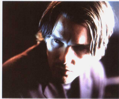
Top: Ethan Hawke in Hamlet (2000) Bottom left: Kenneth Branagh (1996) Bottom right: Laurence Olivier (1948)

I expect that many more directors and actors will make films of Hamlet . Shakespeare's play is more than 400 years old but people continue to want to see it. Perhaps in 400 years from now, they will play Hamlet on Mars.