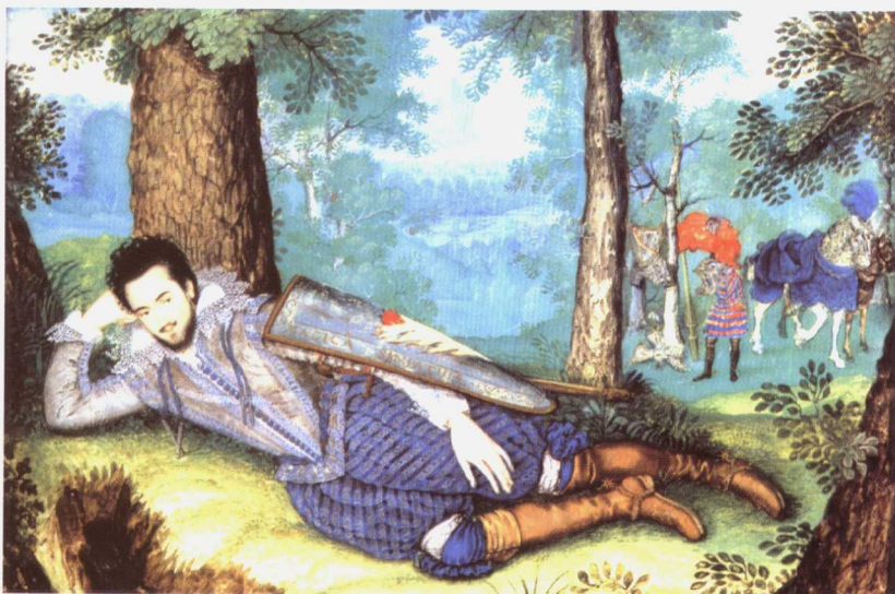
A young nobleman meditating on the meaning of life. Edward Herbert I (1610) , by Isaac Oliver.

Drama in Elizabethan England was as important as television and films today. It examined political, religious and social questions. There were many popular plays by various writers about revenge 1 . But Hamlet is certainly the most complex revenge tragedy of all. It is one of the plays which have made Shakespeare famous for his imagination 2 , his use of language and his understanding of human psychology. Like Dante in Italy, Cervantes in Spain or Goethe in Germany, he is considered his country's greatest writer.