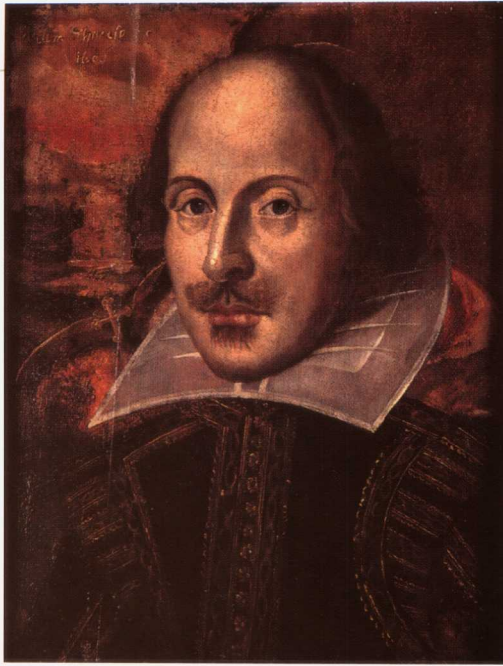
The Flower Portrait of William Shakespeare by unknown artist