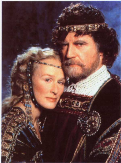
Glenn Close as Queen Gertrude and Alan Bates as King Claudius in Franco Zeffirelli's film of Hamlet

Hamlet is one of Shakespeare's most famous plays. It was written in 1601. One night Prince Hamlet of Denmark meets the ghost of his dead father on the battlements 1 of Elsinore Castle. The Ghost tells him that he was murdered 2 by Hamlet's uncle Claudius. Now Claudius has married Hamlet's mother, Gertrude, and has made himself the new king. The Ghost tells Hamlet to take revenge. The Prince's life changes completely. He finds that the girl he loves, Ophelia, her father Polonius and even his mother the Queen all support Claudius. Everybody except his friend, Horatio, believes that Hamlet is mad. Even when he demonstrates that the Ghost's story is true, it is still difficult for Hamlet to find the opportunity to take revenge. One disaster follows another. There is accidental murder, exile, madness and suicide. Finally, Hamlet kills Claudius. But his revenge causes many other people to die... including himself. Only Horatio survives 3 to tell the truth 4 to the world and to help create a new beginning for Denmark.