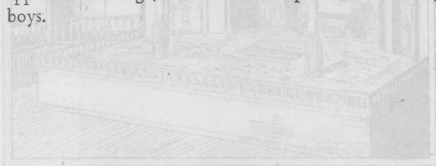
THE SWAN THEATRE

The company was a 'Fellowship of Players', who were all partners and sharers. There were usually ten to fifteen full members, with three or four boys, and some paid servants. Shakespeare had therefore to write for his team. The chief actor in the company was Richard Burbage, who first distinguished himself as Richard III; for him Shakespeare wrote his great tragic parts. An important member of the company was the clown or low comedian. From 1594 to 1600 the company's clown was Will Kemp; he was succeeded by Robert Armin. No women were allowed to appear on the stage, and all women's parts were taken by boys.