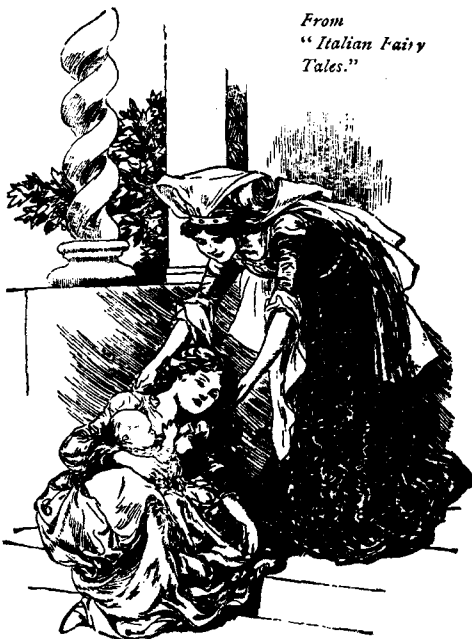
From "Italian Fairy Tales."

Their charm enhanced by the numerous characteristic illustrations, these stories, with their vivid local colouring, gathered from the fairy tales and folk-lore of lovely Italy, translated and retold, form a truly magnificent volume. Printed on rough art paper. 12 full-page colour plates. 144 pp. letterpress, crown 4to.