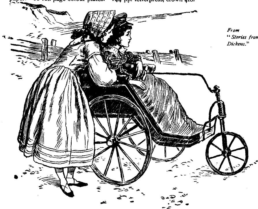
From "Stories from Dickens."

The histories of Sir Walter Scott's most popular characters condensed into short stories, and thus adapted as an interesting introduction to the Scott classics so worthily considered a part of the education of every up-to-date boy and girl. These tales are admirably illustrated with numerous drawings in colour and black and white. Printed on rough art paper. 12 full-page colour plates. 144 pp. letterpress, crown 4to.