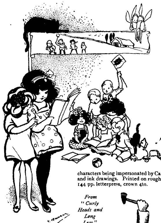
From "Curly Heads and Long Legs."