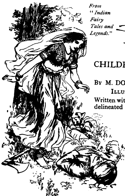
From "Indian Fairy Tales and Legends."