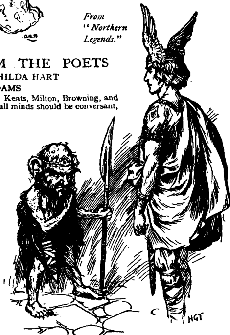
From "Northern Legends."