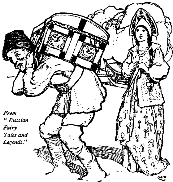
From "Russian Fairy Tales and Legends."