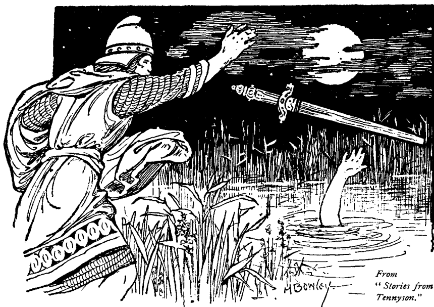
From "Stories from Tennyson."