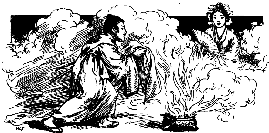
FROM "A DAUGHTER OF THE MOON"

And so it is that its literature includes all these qualifications. In Japan books are written in Japanese or Chinese. Chinese is used for history and science, and for all serious subjects, while Japanese is preferred for the lighter forms, such as poetry and fiction. The earliest book that is in existence to-day goes back to A.D. 712, and is written in a strange mixture of Japanese and Chinese.