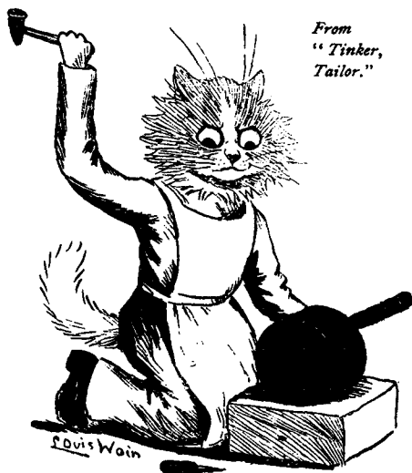
From "Tinker, Tailor."

Tales of exciting adventure and the entertaining histories of "Tinker, Tailor, Soldier, Sailor," etc., the characters being impersonated by Cats in a large number of coloured and pen and ink drawings. Printed on rough art paper. 12 full-page coloured plates. 144 pp. letterpress, crown 4to.