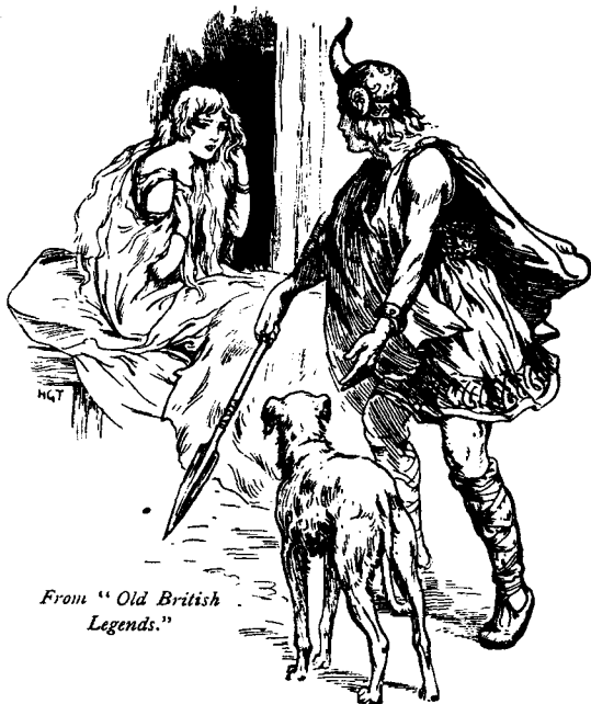
From "Old British Legends."

These ancient legends of England, Scotland, Wales, and Ireland, delightfully narrated and brilliantly illustrated, constitute a volume which may well claim to be amongst the most beautiful books of this beautiful series. Printed on rough art paper. 10 full-page colour plates. 144 pp. letterpress, crown 4to.