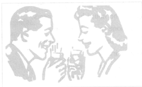
图：一对夫妇 (couple)，高兴；庆祝他们的纪念日 (anniversary)。

Describe the picture with the help of the Chinese version and the English words given in the brackets.