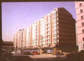
新怡家园 XINYI GARDEN