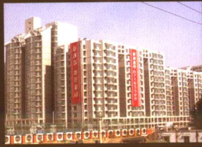
新景家园 II 期 NEW VIEW GARDEN PHASE II