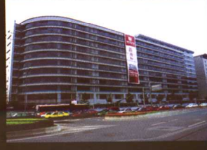
新成文化大厦 XIN CHENG COMMERCIAL BUILDING