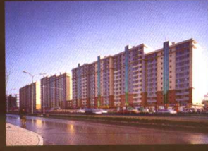
新裕家园 XINYU GARDEN