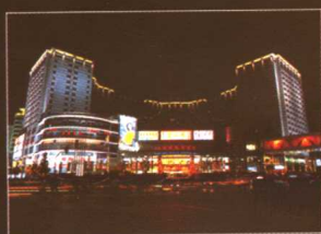
太华公寓 TAIHUA PLAZA