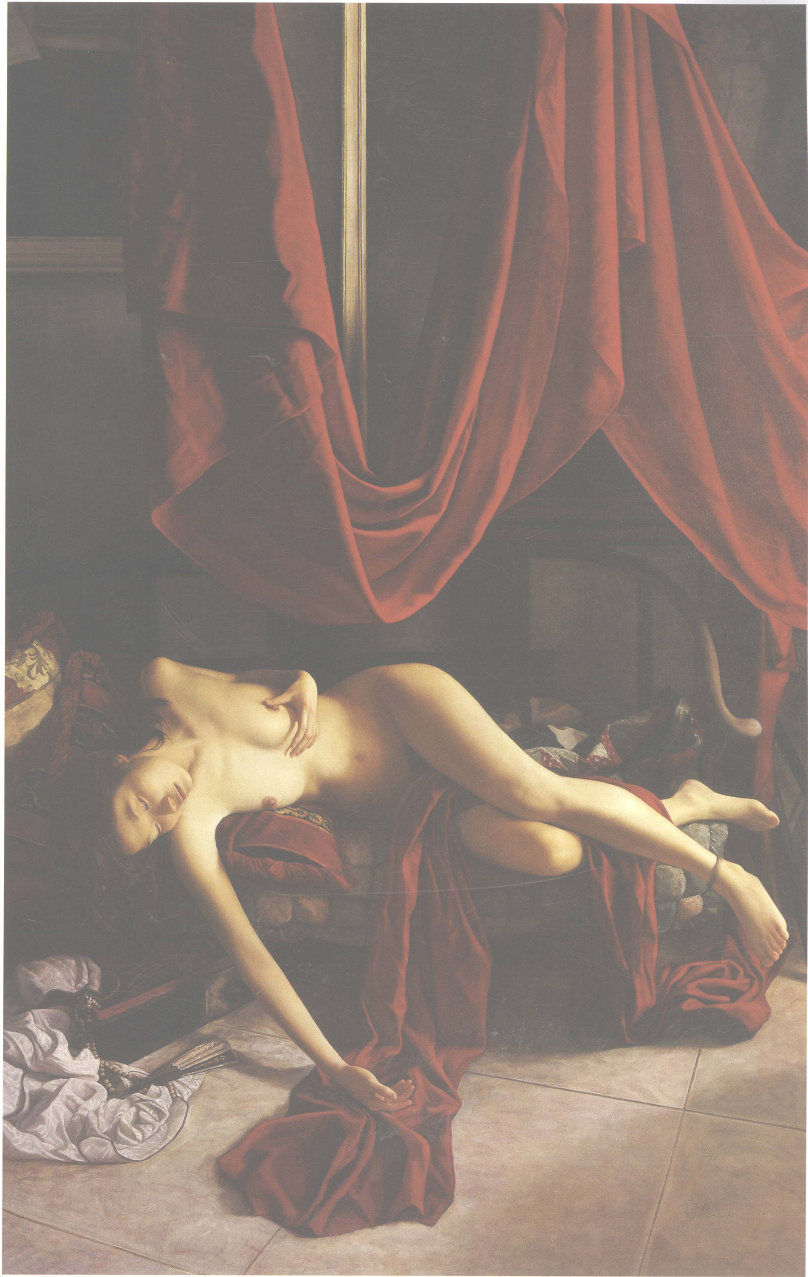
紅 Red Back- ground