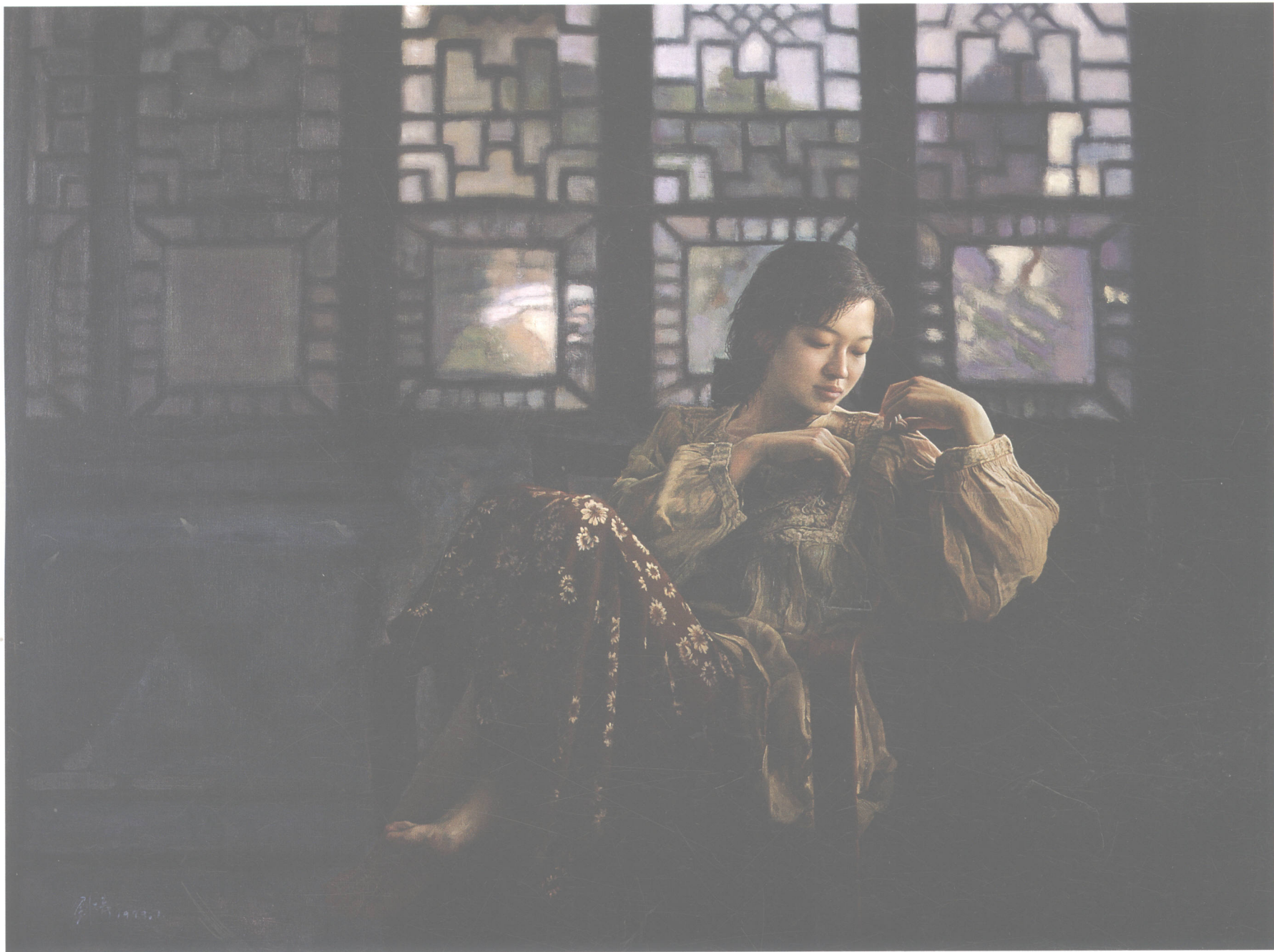
肩上的髮絲 Hair on the Shoulder