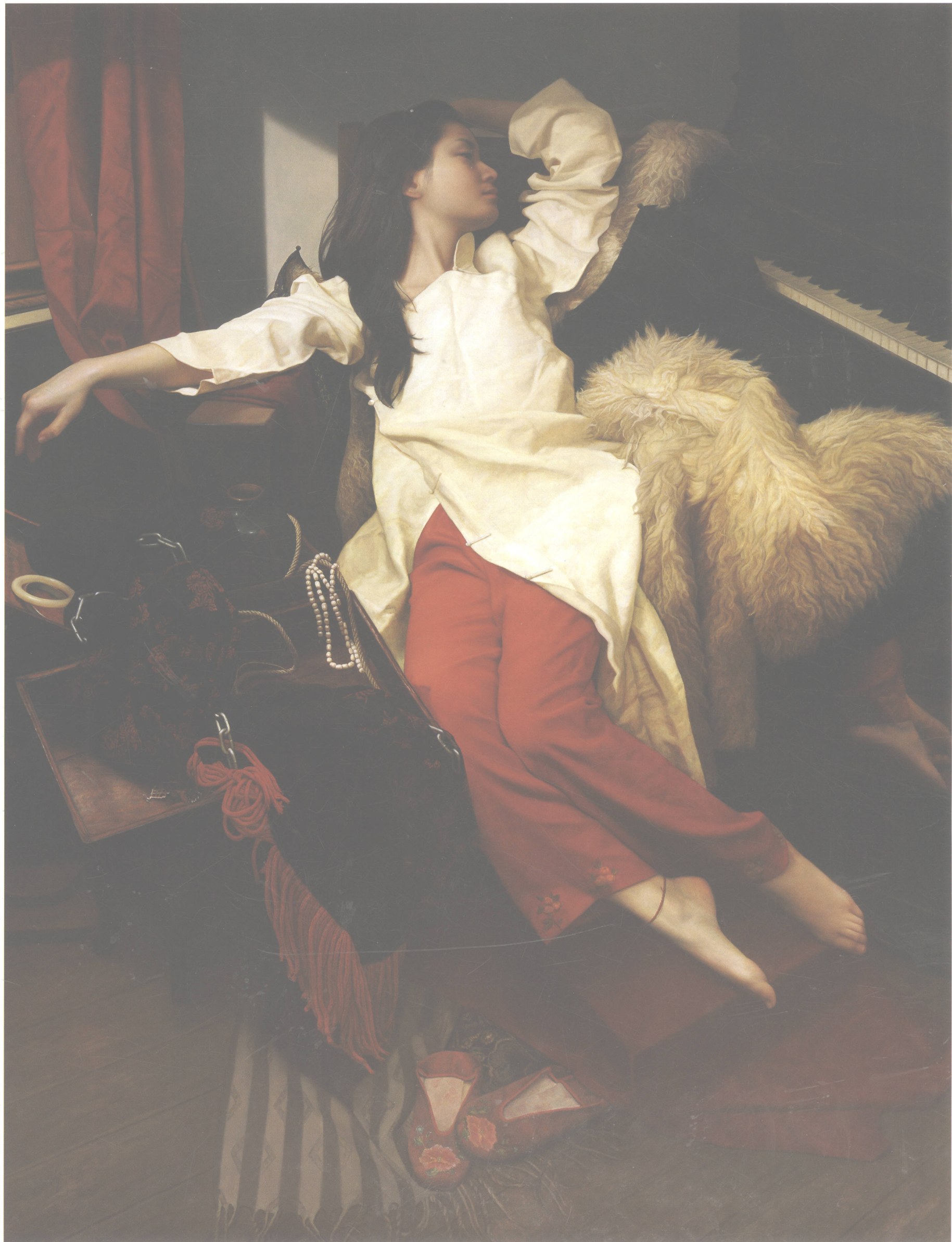
妮嬭 A Fair Maiden