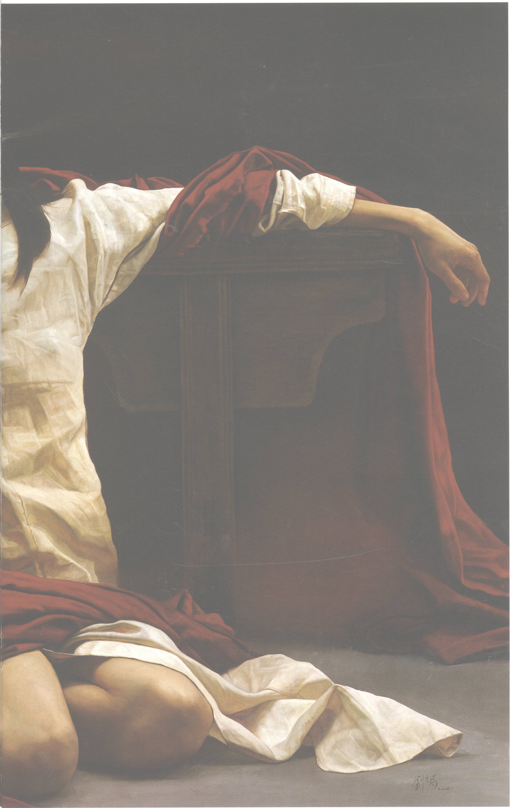
鳥 Bird-shaped Posture