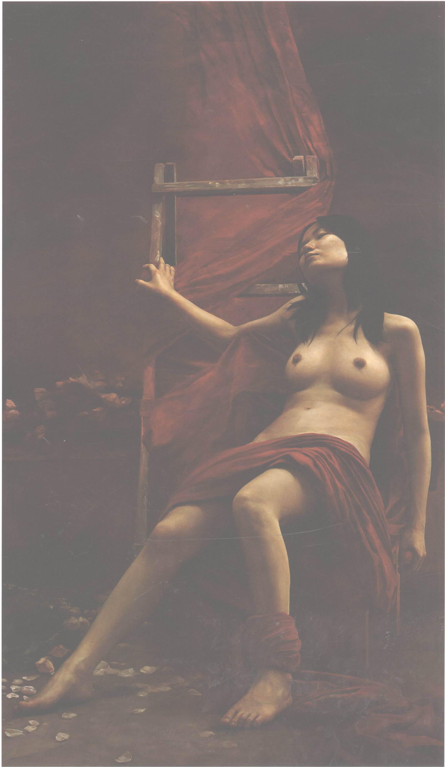
天梯（一） Girl Leaning against the Ladder (I)