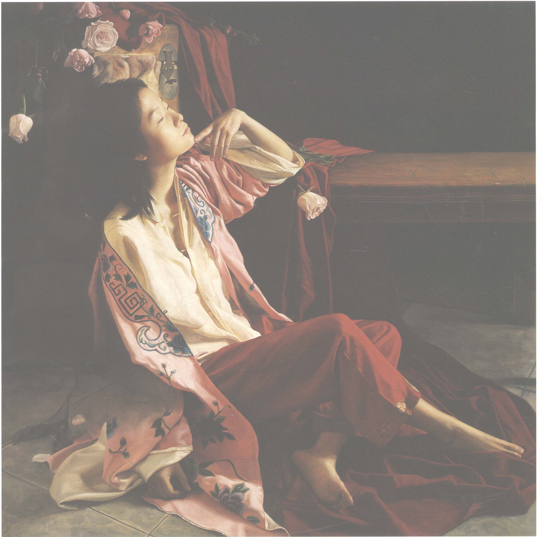
小阳春 Quiet and Elegant