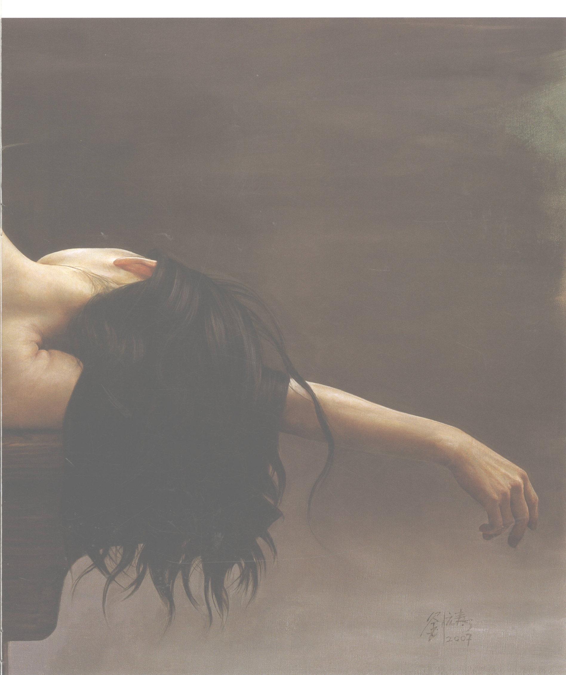
背影 Back Sight