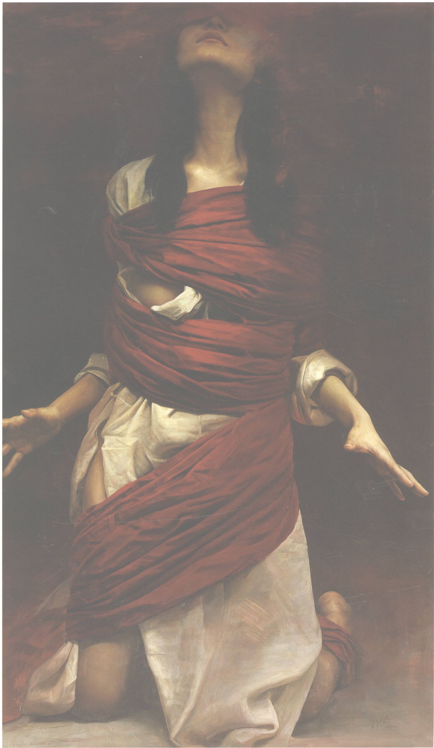
紅俑（一） Red Figurine (I)